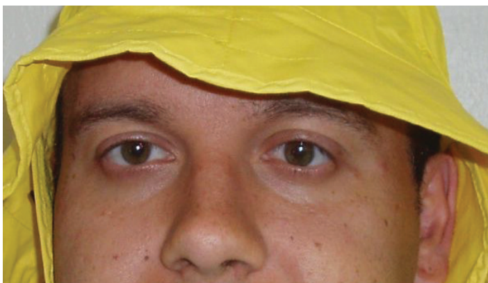
Figure 19. Flexible, lightweight chemical-resistant hat.

Hats must not contain absorbent material such as cotton, leather, or straw. Many chemical-resistant jackets or coveralls can be purchased with attached protective hoods.