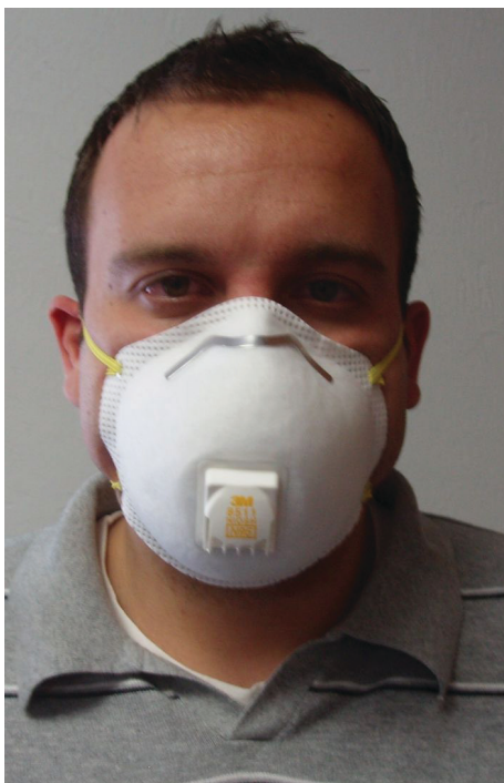
Figure 27. Dust/mist respirator.