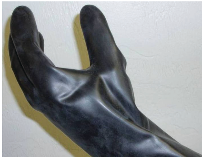
Figure 14. Natural rubber gloves.