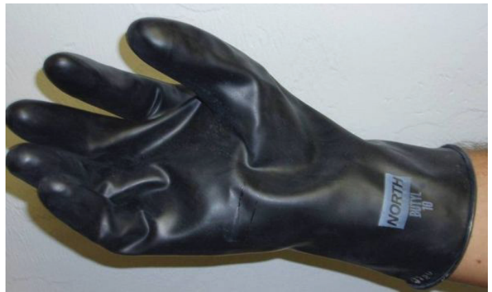
Figure 11. Butyl rubber gloves.