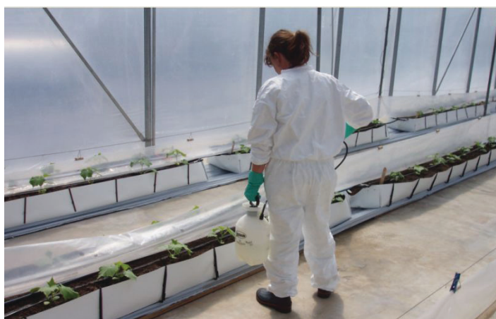
Figure 6. Tyvek coveralls.