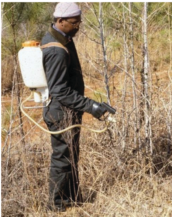
Figure 5. Cotton coveralls.