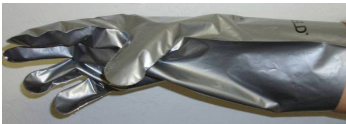
Figure 10. Barrier laminate gloves.

Polymers used for chemical-resistant gloves (Figures 10–15) include those materials listed in Table 1. These materials are used either individually or in various combinations in commercially available gloves. Canvas and leather gloves will not protect against exposure to pesticides because these materials absorb pesticide easily and cannot be decontaminated.