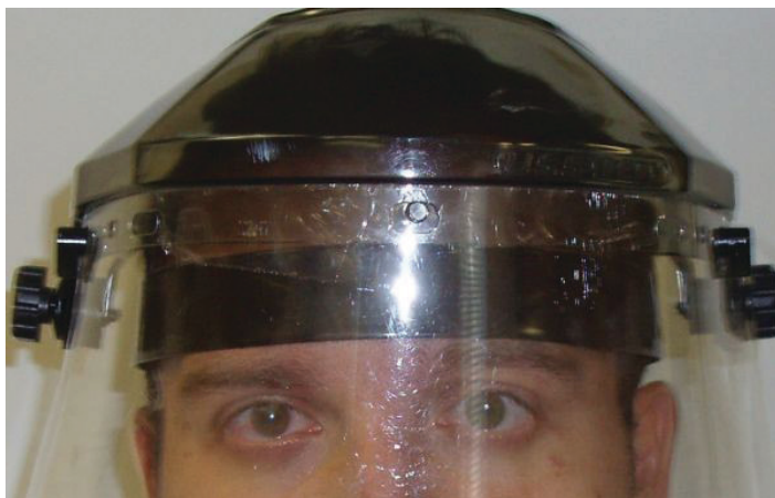
Figure 21. Full face shield.