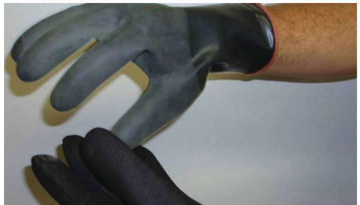
Figure 13. Neoprene rubber glove in two styles-the upper has a textured-surface for better gripping.