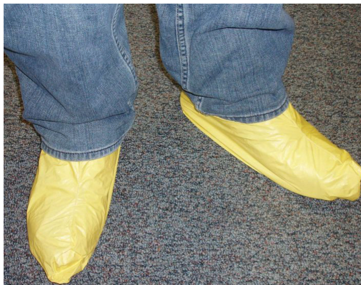
Figure 16. Shoe covers designed for use while handling pesticides.

waterproof boots when entering or walking through recently treated areas such as lawns before the spray has dried.