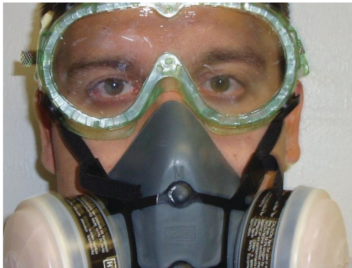
Figure 23. Wearing goggles with a half-face respirator.

Shielded safety glasses and full face shields are good choices in many handling situations because they are relatively comfortable, do not cause fogging or sweating, and provide good eye protection. If goggles will be worn, materials made of polycarbonate that have protected air baffles to avoid fogging are the most comfortable choice. Either goggles or shielded safety glasses can be worn with a half-face respirator (Figure 23).