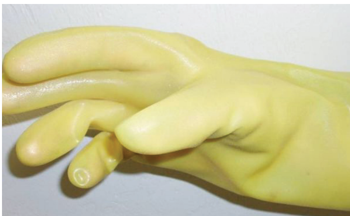
Figure 15. Polyvinyl chloride gloves.

Chemical-resistant gloves are fabricated in two forms. One is that of the hand silhouette. This glove is made by die-cutting a two-dimensional outline of a hand from a plastic film. Two of these flat hand forms are welded around the edges to form a glove. Most gloves made from polyethylene are constructed in this manner. The hand-silhouette gloves can be ineffective because of poor fit, loss of dexterity, and difficulty in keeping the gloves on the hands. The second and more common type of chemical-resistant glove is made by dip molding, that is, by dipping a hand mold into a polymer-containing liquid. Dipped gloves are right- and left-handed and are sized. These gloves provide both a better fit and improved dexterity. Some of the dipped gloves come with curved fingers, which provide additional comfort.