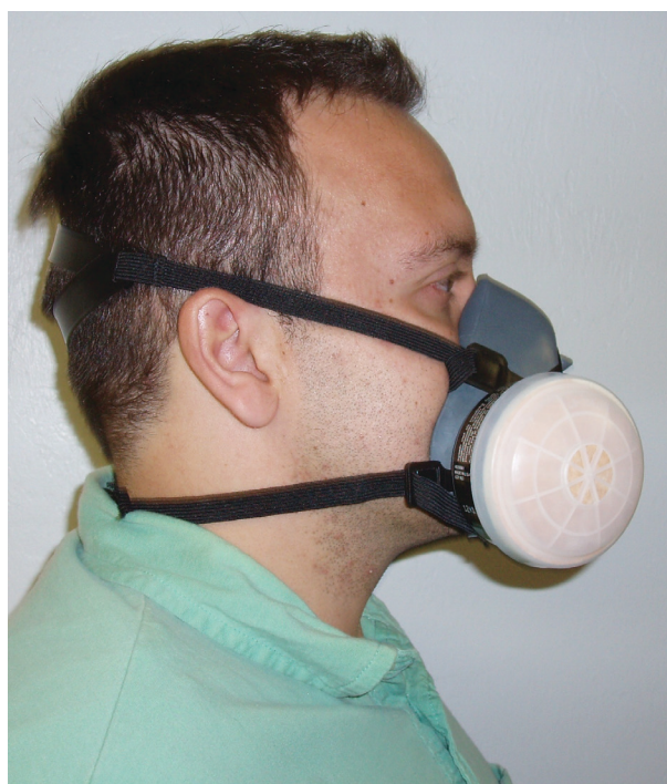
Figure 26. Air-purifying respirator.