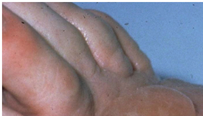
Figure 17. Skin blistered by fumigant exposure to the foot.

Chemical-resistant gloves and footwear should not be worn when handling certain fumigants. The gloves and footwear can trap the fumigant gas near the skin and cause burns (Figure 17). Like other pesticides, fumigant labels specify the appropriate PPE required to protect the applicator from exposure.