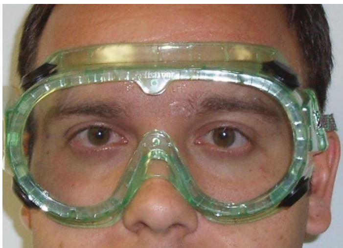
Figure 20. Goggles.

Eyes are very sensitive to the chemicals contained in some pesticide formulations, especially concentrates. Goggles, face shields, and safety glasses with shields at both the brow and sides are examples of protective eyewear (Figure 20–22).