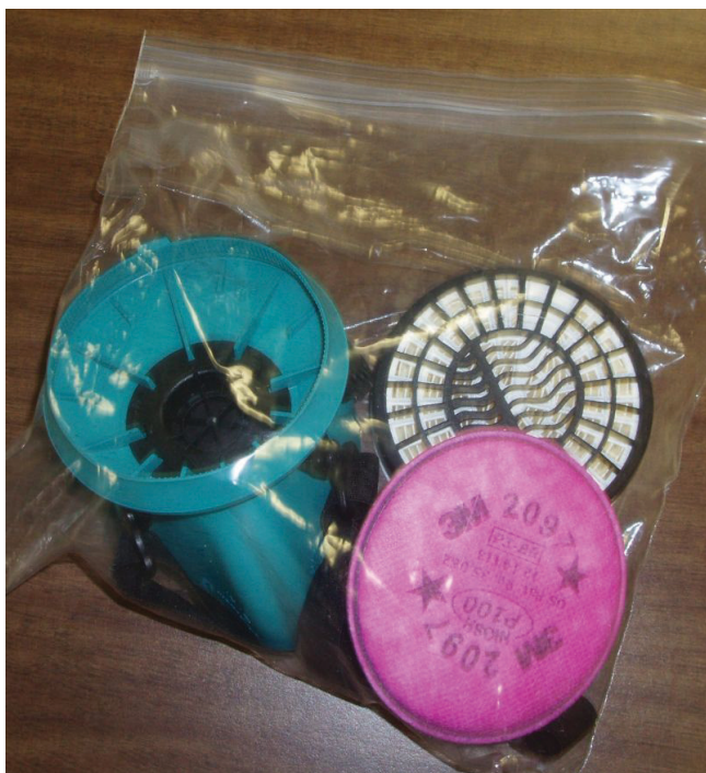
Figure 28. Store respirators and cartridges in an airtight bag, or they may lose their effectiveness.