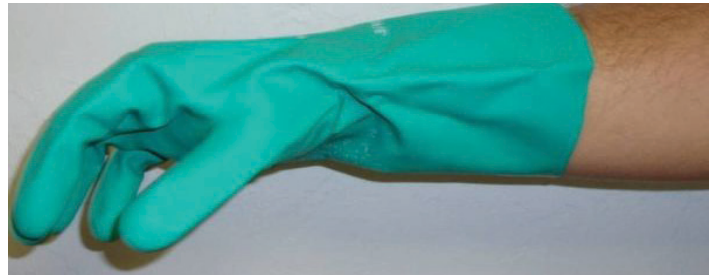
Figure 12. Nitrile rubber gloves.