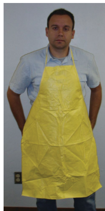
Figure 8. Some aprons are very lightweight and disposable.