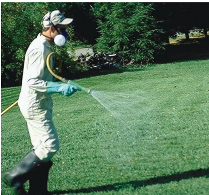
Figure 18. Pant legs should be outside of the boots, not inside as shown here, to prevent pesticide from running down into the boots.