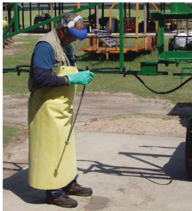
Figure 7. Some labels state that a chemical-resistant apron should be worn while cleaning application equipment.

An apron can pose a safety hazard when working around equipment with moving parts. In that situation, a chemical-resistant suit would be a better choice.