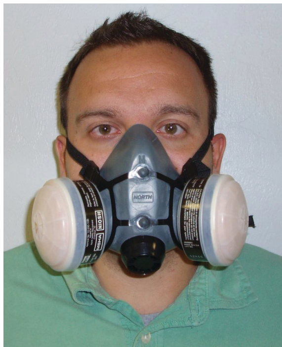
Figure 25. Air-purifying respirator.

Chemical cartridges should be replaced according to the manufacturer's recommendations or the pesticide label, or when the wearer notices odor or experiences irritation. Pre-filters will extend the life of chemical cartridges in dusty conditions. Mechanical filters should be replaced when breathing becomes difficult or the filter is damaged, or as specified by the manufacturer or the pesticide label. If no instructions are provided, replace cartridges and filters when the workday is over.