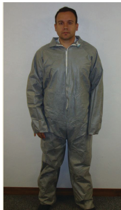
Figure 4. Synthetic blend coveralls.

The protection offered by chemical-resistant clothing depends on the fabric, and on design features such as flaps over zippers, elastic at the wrists and ankles, and seams that are bound and sealed. Coveralls should be made of sturdy material such as cotton, polyester, a cotton-synthetic blend, denim, or a non-woven fabric such as Tyvek® (Figures 4–6). When wearing a coverall, the opening should be closed securely so the entire body, except the feet, hands, neck, and head, is covered. With two-piece outfits, the shirt or coat should not be tucked in at the waist, but rather the shirt should extend well below the waist of the pants and fit loosely around the hips. Well-designed coveralls offering protection from pesticides are tightly constructed and have sealed seams and snug, overlapping closures that do not allow gaps and do not unfasten readily. For example, many coveralls have zippers that are covered by flaps for added protection. Some coveralls, such as those made of Tyvek®, are water resistant and disposable.