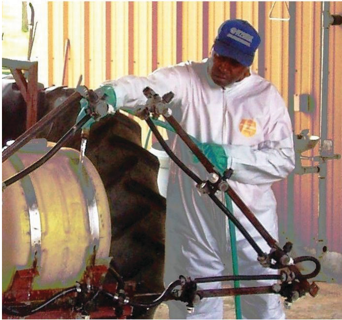
Figure 9. Gloves should be worn while washing contaminated application equipment.

The parts of the body that get the most exposure to pesticide are the hands and forearms. Research has shown that workers mixing pesticides received 85 percent of the total exposure to hands and 13 percent to the forearms. The same study showed wearing gloves reduced exposure by at least 98 percent to applicators who had spills while mixing or applying pesticides (Table 2). As a result, most product labels require use of waterproof or chemical-resistant gloves during handling and mixing. Gloves should be worn any time pesticides may contact hands, such as when working around contaminated equipment or surfaces (Figure 9).