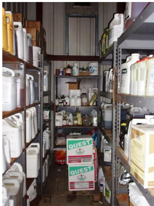
Figure 10. Store pesticides on metal shelving with the heaviest containers and liquids stored on the lower shelves.

For ease of cleanup, choose shelving and pallets made of non-absorbent materials, such as plastic or metal (Figure 10).