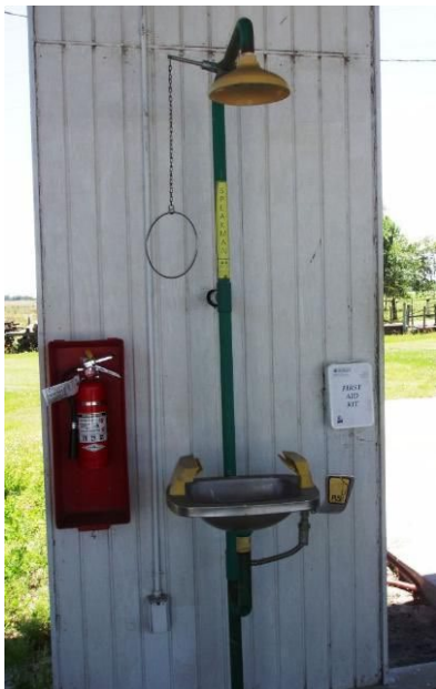
Figure 11. Permanent plumbing at a decontamination site outside of a pesticide storage facility.