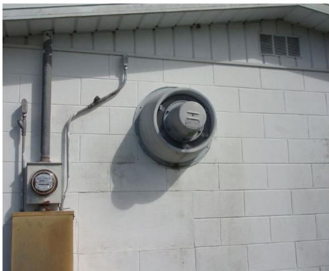
Figure 7. Exhaust fan at pesticide storage facility helps reduce temperatures and remove dust and vapors from the facility.