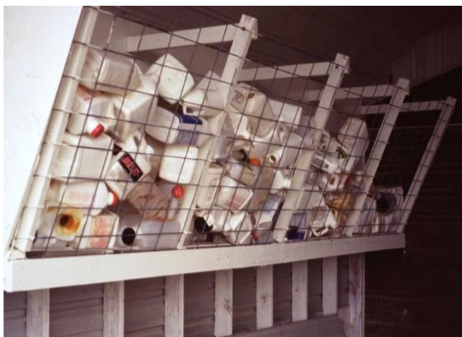
Figure 18. Empty pesticide containers stored prior to transporting to a recycling event.

If you are saving pesticides or pesticide containers for disposal or recycling, store them in a special section of the storage site (Figure 18). Make sure all empty containers are triple-rinsed or pressure-rinsed before storing for disposal or recycling. For more on this topic, see EDIS Publication PI-3, Pesticide Container Rinsing , https://edis.ifas.ufl.edu/pi003 .