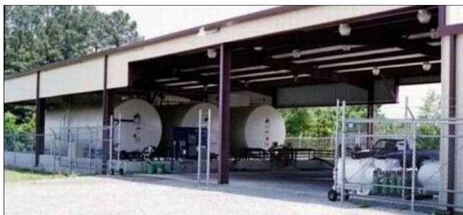
Figure 14. Large pesticide storage facility with bulk tanks within diking for containment and the area fenced for security.

plus at least an additional 10 percent. Keep valves and pumps within the diked area. Make sure all drains within the dike connect to a holding tank. Outside, use fencing to prevent tampering or unauthorized access to any bulk tanks (see Figure 14).