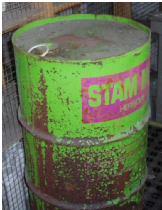
Figure 5. Moisture can cause pesticide storage containers made of metal to rust.