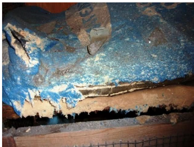
Figure 6. Moisture can cause pesticide storage containers made of paper to split.