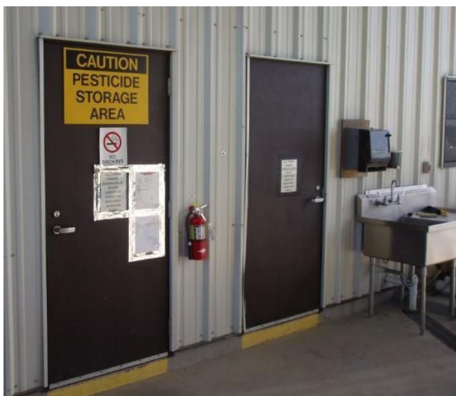
Figure 1. Designate a separate facility for storing pesticides. A well-designed and maintained pesticide storage site:

Although many pesticide handlers use existing buildings or areas within existing buildings for pesticide storage, it is always best to build a separate facility designated for storing pesticides (Figure 1).