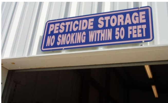
Figure 3. Post signs on storage facilities to alert people that pesticides are present.