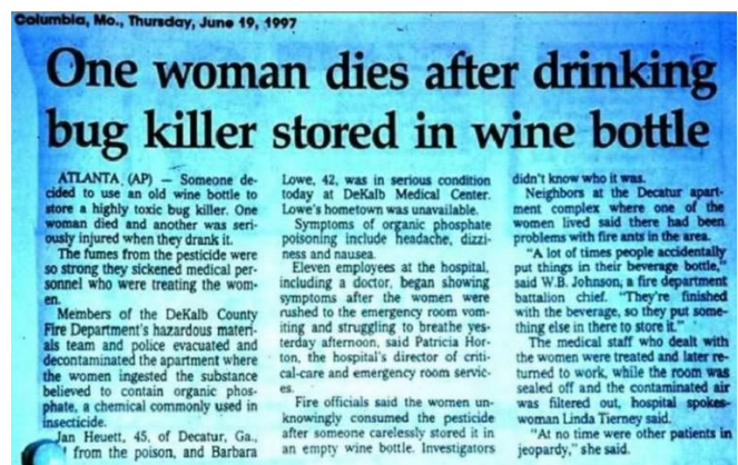
Figure 13. This news report provides an example of the hazard associated with use of an improper container for pesticide storage.

Store pesticides in their original containers or in different containers that originally held the same pesticide and still have intact labels. Never use milk jugs, soft drink bottles, fruit jars, medicine bottles, fuel cans, or other types of non-pesticide containers to store pesticides. Using the wrong containers for pesticide storage is illegal and has resulted in serious poisonings because children (Figure 12), as well as adults (Figure 13), associate the shape, size, and color of a container with its usual contents. Never lend or borrow any pesticide product in an unmarked or unlabeled container.