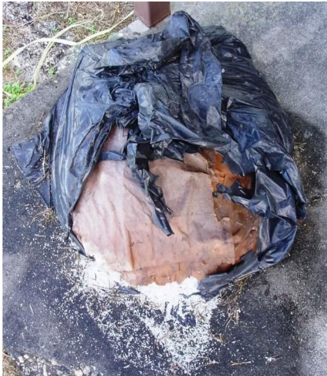
Figure 15. Dry pesticide spilled from torn bags.

Inspect pesticide containers regularly for tears, splits, breaks, leaks, rust, or corrosion (see Figure 15). If you find a damaged container, immediately put on appropriate personal protective equipment and take immediate action to prevent the pesticide from leaking or spreading into its surroundings. If a container is already leaking, take corrective action to prevent further leaking and immediately clean up any spilled pesticide. Be especially careful if the damaged container is an aerosol can or fumigant cylinder that contains pesticides under pressure.