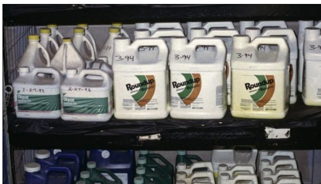
Figure 17. Containers clearly marked with dates of purchase. Be sure to note if the product has an effective shelf life listed on its label. If you have questions about the shelf life of a product, contact the dealer or manufacturer. Signs of pesticide deterioration from age or poor storage conditions may appear during mixing. Watch for excessive clumping, poor suspension, layering, or abnormal coloration during mixing. Other times, however, the first indication of pesticide deterioration from age or poor storage conditions may be poor pest control and/or damage to the treated crop or surface.