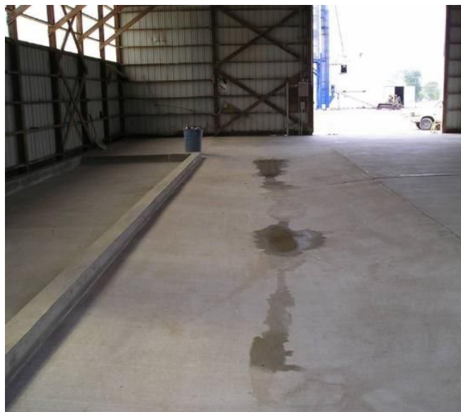
Figure 9. A recessed floor helps control spills or leaking pesticides.

Construct the floor of the pesticide storage area using sealed cement, glazed ceramic tile, no-wax sheet flooring, or other material that is free of cracks and easy to clean and decontaminate in the event of a spill or leak. Carpeting, wood, soil, and other absorbent floors are not suitable because they are difficult or impossible to decontaminate. A floor that slopes into a containment system or that is recessed below the level of the doors helps to keep spilled or leaking pesticides within a confined area (Figure 9).