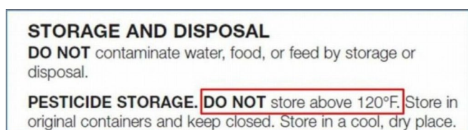
Figure 8. Labels often state storage temperature limitations. Temperature extremes can decrease the effectiveness of some pesticides. In addition, freezing temperatures can result in breakage of glass, metal, and plastic containers. Excessive heat can cause plastic containers to melt, some glass containers to explode, and a few pesticides to volatilize and drift from the storage site. Always store pesticide containers out of direct sunlight to prevent overheating.