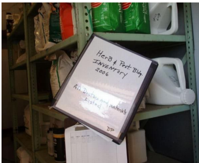
Figure 16. Inventory notebook detailing pesticides inside a storage facility.

Keep an inventory of all pesticides in storage and mark each container with its purchase date (Figures 16 and 17).