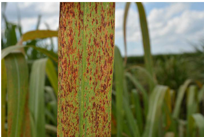
Figure 13. Brown rust symptoms on a sugarcane leaf.