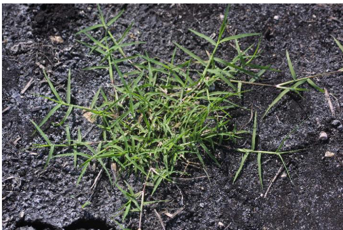
Figure 18. Prostrate bermudagrass.

Bermudagrass ( Cynodon dactylon ) is the most problematic perennial grass weed in Florida sugarcane. It is a wiry, low-growing or prostrate plant with stems arising from aboveground stolons and belowground rhizomes (Figure 18) and rooting at the nodes (Figure 19). Propagation occurs primarily through rhizomes and stolons and less commonly by seed. Bermudagrass is most competitive with sugarcane early in the season before canopy closure because it is not shade-tolerant (Horowitz 1972). It interferes with sugarcane by shading emerging shoots and reducing tiller formation and survival. Once established, it is difficult to manage. It is only sufficiently controlled during the sugarcane fallow period.