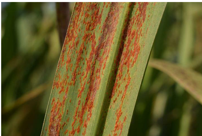
Figure 14. Orange rust pustules on the lower side of a sugarcane leaf.

reductions in sugar per acre of 43%–53% (Raid et al. 2011). CP80-1743, which occupied nearly 25% of the total area when the initial outbreak of orange rust occurred in 2007, was significantly affected. This cultivar has since been withdrawn from commercial production and replaced by less susceptible cultivars. However, several other cultivars, such as CP88-1762 and CP89-2143, which were initially classified as resistant to orange rust based on an absence of disease symptoms during 2007 and 2008 field surveys, rapidly showed disease symptoms following an increase in area planted. Similarly, CP89-2143 was rated resistant during the 2010 crop season, but was rated susceptible two years later (BASF and Glades Crop Care, unpublished data). These breakdowns of rust resistance were attributed to the appearance of new strains of the pathogen (Rott et al. 2016; Sanjel et al. 2016). Occurring over a longer period of time and later in the growing season than brown rust, orange rust may reduce stalk sucrose content as well as stalk populations and biomass.