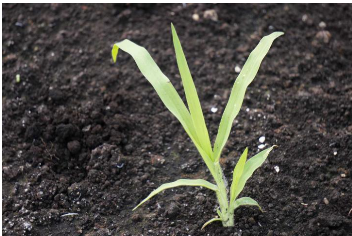
Figure 17. Fall panicum with hairs on the lower surface of the plant.