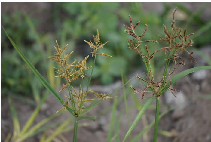
Figure 21. Yellow (left) and purple (right) nutsedge flowers.