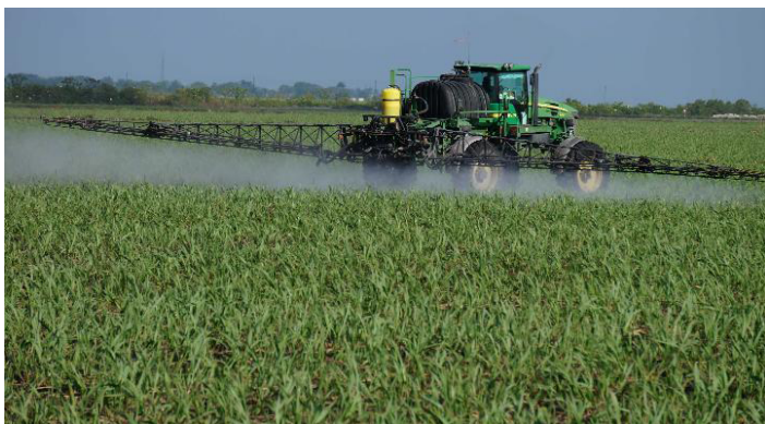
Figure 27. Chemical weed control in sugarcane near Belle Glade, FL.

over the entire field, or directed around the base of cane stalks away from leaves. Spot treatments of nonselective herbicides are sometimes used for management of isolated patches of perennial grasses (bermudagrass, napiergrass). Depending on the label instructions, postemergence herbicides can be applied with adjuvants (surfactants, crop oil concentrates, buffering agents, etc.) to improve herbicidal activity or application characteristics. Before you make a decision regarding herbicide use, you must perform proper weed identification and select the herbicide(s) that will provide maximum control of the target weed(s). Predominantly used herbicides in Florida sugarcane include atrazine, metribuzin, ametryn, 2,4-D amine, asulam, pendimethalin, and halosulfuron. Other commonly used herbicides include mesotrione, topramezone, trifloxysulfuron, dicamba, glyphosate, and the premix of S-metolachlor, atrazine, and mesotrione. Less commonly used herbicides include carfentrazone, diuron, diuron + hexazinone, flumioxazin, and paraquat. These herbicides are mainly used in combinations to broaden the weed-control spectrum. Label instructions must be followed by law.