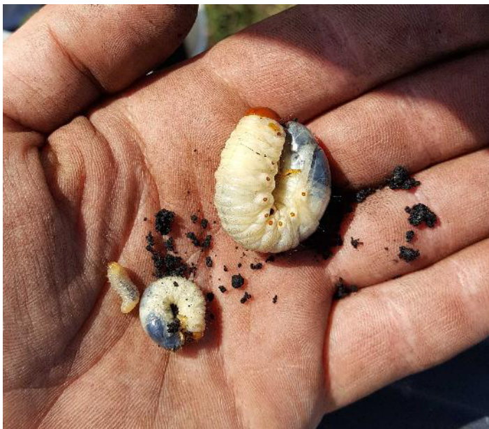
Figure 7. Beetle larvae infesting sugarcane, including a Diaprepes root weevil larva (left), a Cyclocephala sp. larva (center), and a Tomarus subtropicus larva (right).

White grubs are the larvae of several beetle species in the genera Tomarus , Cyclocephala , Phyllophaga , and Anomala (Figure 7). Among these pests, Tomarus subtropicus is considered the most damaging species. White grubs tend to infest sugarcane in organic soils, damaging sugarcane by feeding on roots and underground stems. The first symptom of an infestation is yellowing of the leaves (chlorosis), usually followed by stunted growth, dense browning, lodging, plant uprooting, and in heavily infested areas, plant death. White grub infestations are generally low in plant cane fields, but they increase in ratoon cane fields (Cherry 2012; Beuzelin et al. 2022).