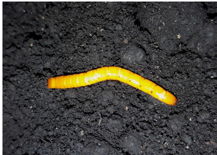
Figure 6. Larva of the corn wireworm, Melanotus communis .

Wireworms are the larvae of click beetles (Figure 6). At least 12 species of wireworms have been found in south Florida, but only the corn wireworm, Melanotus communis , is considered to cause significant economic damage to sugarcane. Wireworms feed on the buds and root primordia during germination of sugarcane seed pieces. After germination, wireworms feed on shoots and roots. Most of the injury to young shoots occurs where the shoots join the seed piece or ratoon stubble (Cherry and Karounos 2021; Beuzelin et al. 2022).