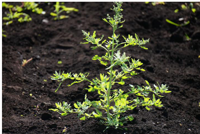
Figure 24. Mature common lambsquarters.