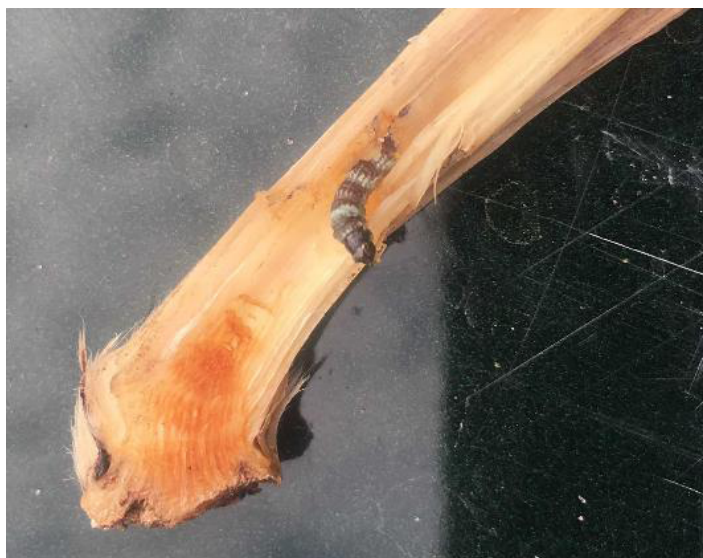
Figure 9. A lesser cornstalk borer larva feeding on a young sugarcane shoot.

The lesser cornstalk borer (LCB), Elasmopalpus lignosellus , is the larva of a moth. LCB larvae (Figure 9) bore into young sugarcane plants at or below the soil surface and usually cause a deadheart comparable to injury caused by the SCB or wireworms. However, LCB larvae construct a silken tube in the soil that extends outward from the plant. The presence of silken tubes and small, circular entrance holes distinguishes deadhearts caused by LCB from those caused by SCB and wireworms. LCB injury above the plant growing point appears as rows of holes in emerging leaves (Beuzelin et al. 2022).