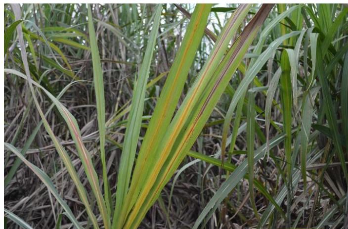
Figure 15. Symptoms of sugarcane yellow leaf: yellow coloration of the lower side of leaf midribs.

Yellow leaf (previously known as yellow leaf syndrome or YLS) was first recognized in Florida in 1993, but the disease had most likely been present in the state for several years (Comstock, Irvine, and Miller 1994; Rott et al. 2016). Symptoms included a bright-yellow coloration on the lower side of the leaf midrib and necrosis starting from the leaf tip and spreading outward from the leaf midrib (Figure 15). Symptoms were most evident on mature sugarcane stalks. In 1997, incidence of Sugarcane yellow leaf virus (SCYLV) exceeded 90% in a majority of Florida’s commercial sugarcane cultivars, and 43 of 46 parental clones used in the crossing program for Florida tested positive for the virus (Comstock et al. 1998). These high levels of sugarcane infection suggested that resistance to yellow leaf was rare in the Florida sugarcane germplasm.