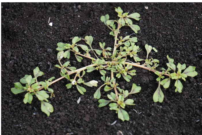
Figure 25. Prostrate livid amaranth.