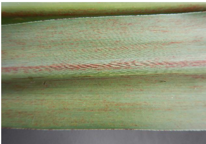
Figure 12. Sugarcane rust mite injury. Sugarcane rust mites are too small to be visible to the naked eye.

however, SRM injury does not cause pustules and tends to be more uniformly distributed on leaves. Injury interferes with photosynthesis and transpiration (Nuessly et al. 2019).