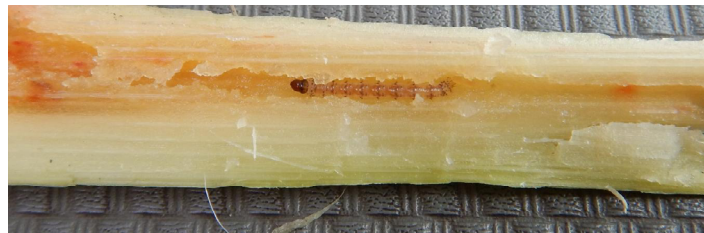
Figure 8. A sugarcane borer larva feeding inside a sugarcane stalk.

The sugarcane borer (SCB), Diatraea saccharalis , is the larva of a moth (Figure 8). Although sugarcane is this insect's principal host, many other grasses, including rice, have been reported as alternative hosts. SCB tunneling into sugarcane stalks causes loss of stalk weight (tonnage/acre) and sucrose yield. Weakened stalks are also subject to breaking and lodging. Additionally, SCB tunnels are points of entry for secondary invaders. SCB larvae feeding on young sugarcane plants and boring near the shoot meristem can also kill the shoot, resulting in a "deadheart" (Beuzelin et al. 2022). One study of five commercial cultivars showed that one bored internode per stalk reduced sugar yield by 5.6 pounds per ton of sugarcane. The range of sugar loss was 2.3 to 6.7 pounds per ton of sugarcane. Another study showed that bored internodes produce 45% less sugar than uninjured internodes (Hall, Nuessly, and Gilbert 2007).