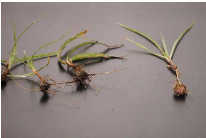
Figure 22. Irregularly shaped purple nutsedge tubers connected in a chain along the length of the rhizome (left) and a round yellow nutsedge tuber at the end of the rhizome (right).