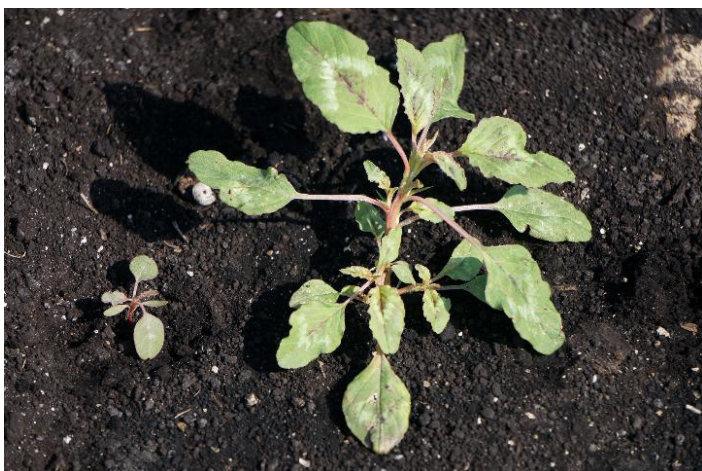
Figure 26. Spiny amaranth seedling (left) and mature plant (right) with spines at the base of leaves.