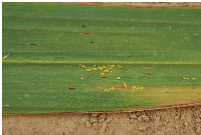
Figure 10. A yellow sugarcane aphid colony feeding on the underside of a sugarcane leaf.

young sugarcane plants or in reduced growth. SA feeding does not cause visible injury to sugarcane leaves; however, large amounts of honeydew excreted by the SA are associated with the development of sooty mold. Sooty mold is a black fungus that can interfere with photosynthesis. In addition, the SA can transmit the sugarcane yellow leaf virus, which is responsible for yellow leaf disease of sugarcane (see below). Aphids observed feeding on sugarcane are generally wingless, but winged forms are produced under conditions unfavorable to the aphids. Abundant rainfall generally reduces aphid infestations (Nuessly et al. 2019).