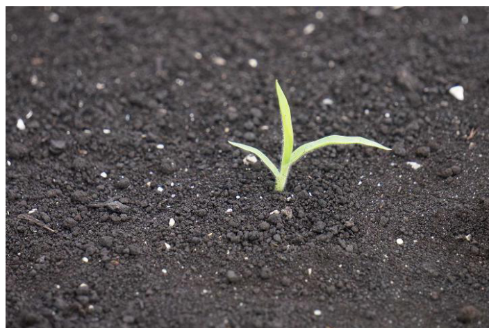
Figure 16. Fall panicum seedling with hairs on the lower surface of the leaf blade.

Fall panicum is a small-seeded grass. Seedlings have hairs on the lower surface of the leaf blades (Figure 16) that disappear with maturity. The growth habit of fall panicum can range from erect to sprawling with formation of large, loose tufts depending on competition (Odero and Sellers 2022). Fall panicum has a waxy-looking stem that is bent and without rooting at the nodes. It typically reaches a height of 1.5–4 feet, but it has also been reported to reach heights of more than 7 feet (Odero and Sellers 2022). The leaf sheath and blades are smooth; however, some hairy biotypes associated with Florida sugarcane exist (Figure 17). The species is sensitive to shading (Vengris and Damon, Jr. 1976) and is usually not found in sugarcane once canopy closure occurs.