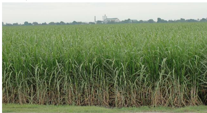
Figure 1. Sugarcane field in Belle Glade, Florida.

of sugarcane and over 2 million tons of sugar (USDA 2022).