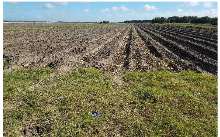
Figure 4. Sugarcane being planted in furrows.

Stalks of seed cane are dropped into furrows, two stalks beside each other, and then cut by hand into smaller pieces. These are covered with soil 3–8 inches deep (Figures 4 and 5). Less than 5% is planted mechanically. One acre of seed cane results in approximately 10 acres of plant cane when hand-planted. However, when mechanically planted, one acre of seed cane yields approximately four acres. In other words, it takes up to three times more seed to plant sugarcane mechanically than manually.