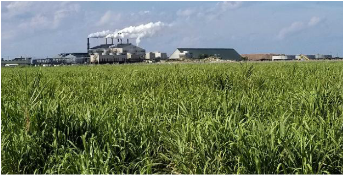
Figure 2. Sugarcane mill in Belle Glade, Florida.