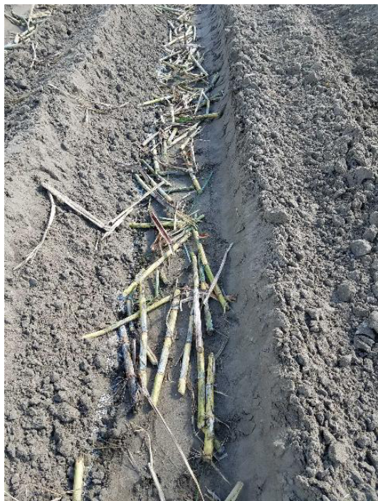
Figure 5. Sugarcane stalks in a furrow before being covered with soil.

is often planted to another crop, such as rice, sweet corn, or a cover crop (termed regular or fallow planting).