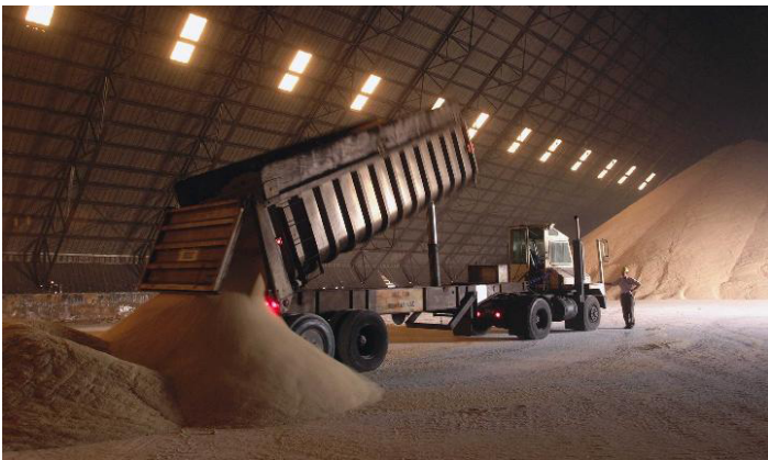
Figure 3. Raw sugar being stored before refining.