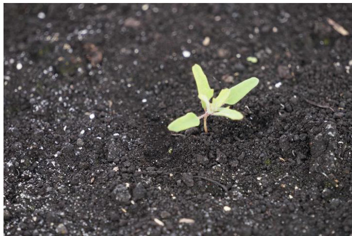
Figure 23. Common lambsquarters seedling.