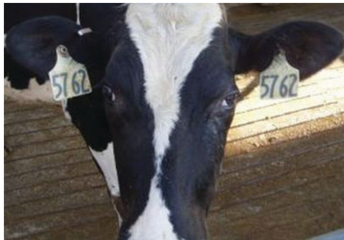
Figure 20. Cattle ear tag impregnated with insecticide. Credits: UF/IFAS Pesticide Information Office.

Manufacturers impregnate (saturate) pet collars, livestock ear tags, adhesive tapes, plastic pest strips, and other products with pesticides (Figure 20). These pesticides evaporate over time, and the vapors provide control of nearby pests. Some paints and wood finishes have pesticides incorporated into them to kill insects or retard fungal growth. Fertilizers also may be impregnated with pesticides.