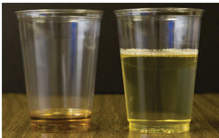
Figure 5. Undiluted and diluted solution formulation.

Some pesticide active ingredients dissolve readily in a liquid carrier, such as water or a petroleum-based solvent. When mixed with the carrier, they form a solution that does not settle out or separate (Figure 5). Formulations of these pesticides usually contain the active ingredient, the carrier, and one or more other ingredients.