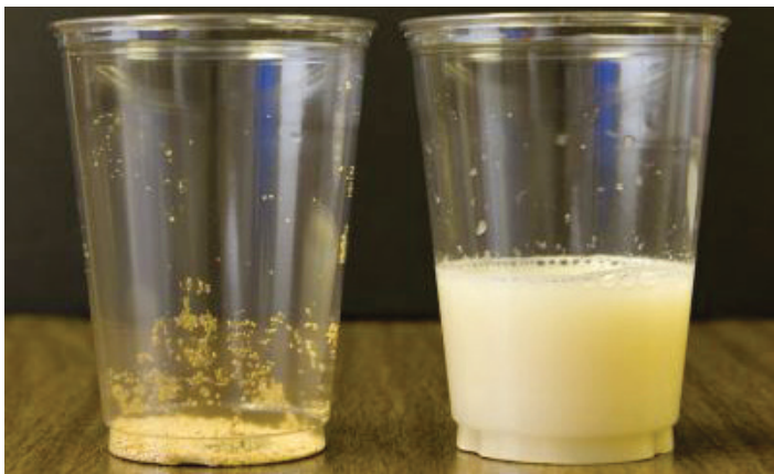
Figure 17. Undiluted and diluted dry flowable formulation.