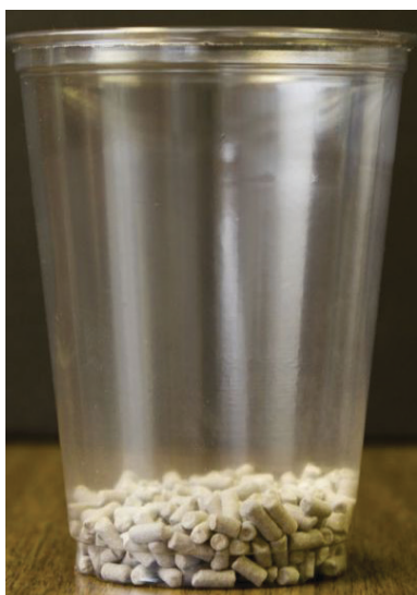
Figure 14. Pellet formulation.

Most pellet formulations are very similar to granular formulations; the terms often are used interchangeably. In a pellet formulation, however, all the particles are the same weight and shape (Figure 14). The uniformity of the particles allows use with precision application equipment. A few fumigants are formulated as pellets; some may be referred to as tablets (Figure 15). However, these are clearly labeled as fumigants. Do not confuse them with nonfumigant pellets.