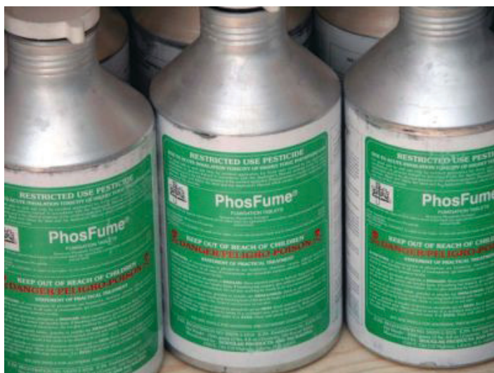
Figure 15. Fumigant formulated as tablets (pellets).