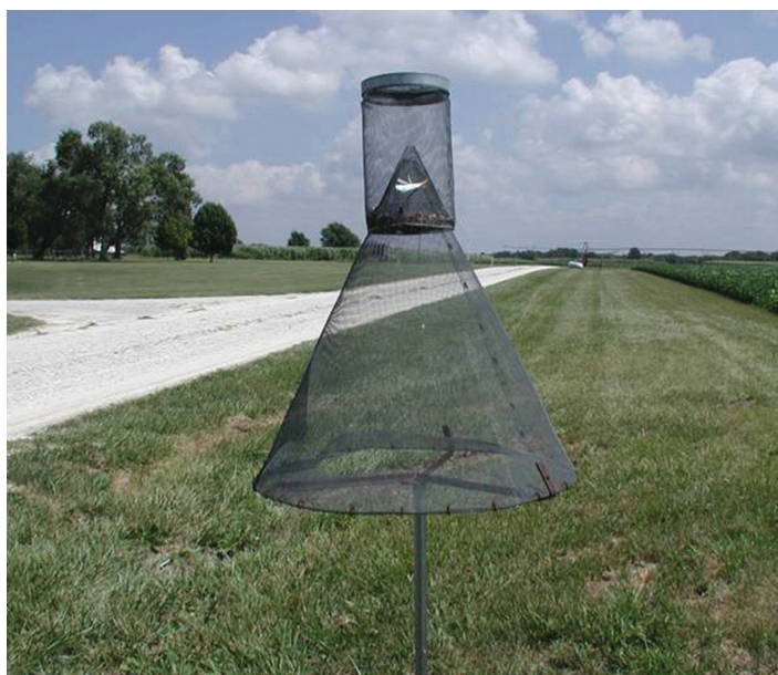
Figure 19. Insect cone trap containing pheromone.

Attractants include pheromones, sugar and protein syrups, yeasts, and rotting meat. Pest managers use these attractants in various types of traps (Figure 19). Attractants also can be combined with pesticides and sprayed onto foliage or other items in the treatment area.