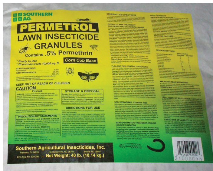
Figure 2. Granular, ready-to-use formulation.

8 pounds of a.i. and 2 pounds of inert ingredient. Liquid formulations indicate the amount of a.i. in pounds per gallon. For example, 1E means 1 pound, and 4E means 4 pounds of the a.i. per gallon in an emulsifiable concentrate formulation (Figure 3).