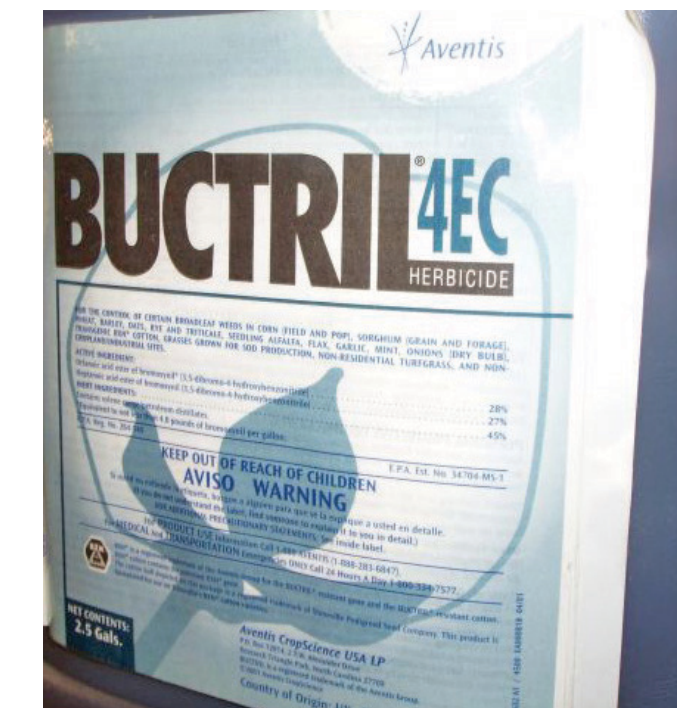
Figure 3. Emulsifiable concentrate formulation (4 pounds a.i. per gallon).

If you find that more than one formulation is available for your pest control situation, you should choose the best one for the job. Before you make the choice, ask several questions about each formulation. For example: