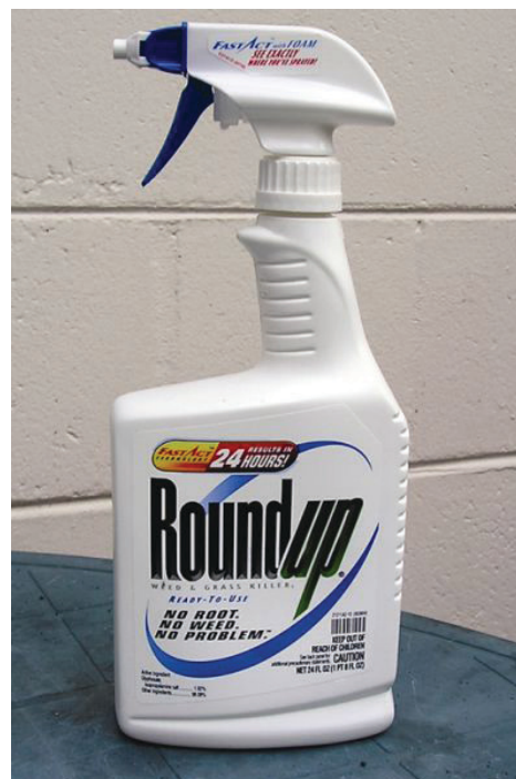
Figure 6. Ready-to-use diluted formulation.

Low-concentrate RTU formulations are ready to use and require no further dilution before application (Figure 6). They consist of a small amount of active ingredient (often 1% or less per unit volume) dissolved in an organic solvent. They usually do not stain fabrics nor have unpleasant odors. They are especially useful for structural and institutional pests and for household use. Major disadvantages of low-concentrate formulations include limited availability and high cost per unit of active ingredient.