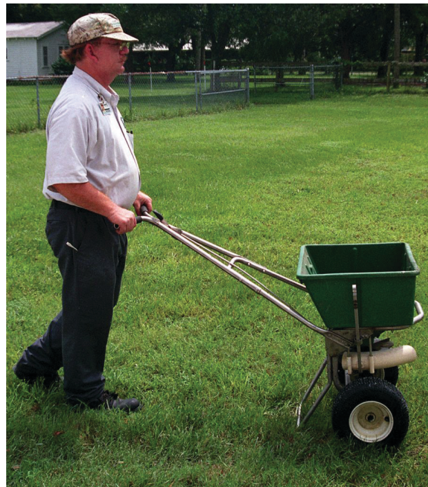
Figure 13. Granular formulations are often applied to the soil.

applied by airplane or helicopter to minimize drift or to penetrate dense vegetation. Once applied, granules release the active ingredient slowly. Some granules require soil moisture to release the active ingredient. Granular formulations also are used to control larval mosquitoes and other aquatic pests. Granules are used in agricultural, structural, ornamental, turf, aquatic, right-of-way, and public health (biting insect) pest control operations.