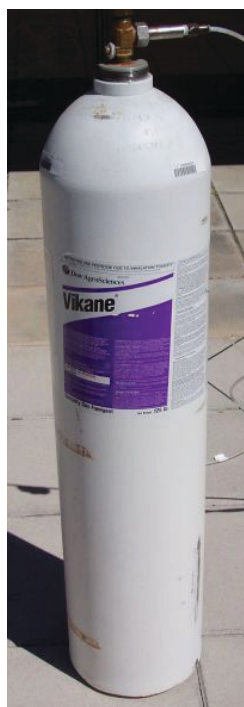
Figure 21. Gaseous fumigant stored under pressure.

Fumigants are pesticides that form gases or vapors toxic to plants, animals, and microorganisms. Some active ingredients are formulated, packaged, and released as gases (Figure 21); others are liquids when packaged under high pressure and change to gases when they are released. Other active ingredients are volatile liquids when enclosed in an ordinary container and, therefore, are not formulated under pressure. Others are solids that release gases when applied under conditions of high humidity or in the presence of water vapor. Fumigants are used for structural pest control, in food and grain storage facilities, and in regulatory pest control at ports of entry and at state and national borders (Figure 22). In agricultural pest control, fumigants are used in soil, greenhouses, granaries, and grain bins (Figure 23).