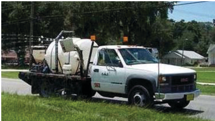
Figure 7. Invert emulsion formulations are useful for drift control along rights-of-way.

An invert emulsion contains a water-soluble pesticide dispersed in an oil carrier. Invert emulsions require a special kind of emulsifier that allows the pesticide to be mixed with a large volume of petroleum-based carrier, usually fuel oil. Invert emulsions aid in reducing drift. With other formulations, some spray drift results when water droplets begin to evaporate before reaching target surfaces; as a result, the droplets become very small and light. Because oil evaporates more slowly than water, invert emulsion droplets shrink less; therefore, more pesticide reaches the target. The oil helps to reduce runoff and improves rain resistance. It also serves as a sticker-spreader by improving surface coverage and absorption. Because droplets are relatively large and heavy, it is difficult to get thorough coverage on the undersides of foliage. Invert emulsions are most commonly used along rights-of-way where drift to susceptible nontarget plants or sensitive areas can be a problem (Figure 7).