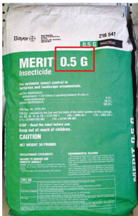
Figure 12. Granular formulations typically contain a low a.i. content.

Granular pesticides are most often used to apply chemicals to the soil to control weeds, fire ants, nematodes, and insects living in the soil or for absorption into plants through the roots (Figure 13). Granular formulations are sometimes