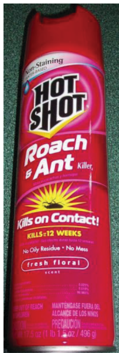
Figure 9. Ready-to-use aerosol insecticide.