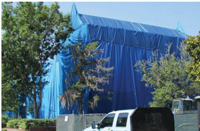
Figure 22. Structural fumigation of a dormitory on UF campus (June 2010).