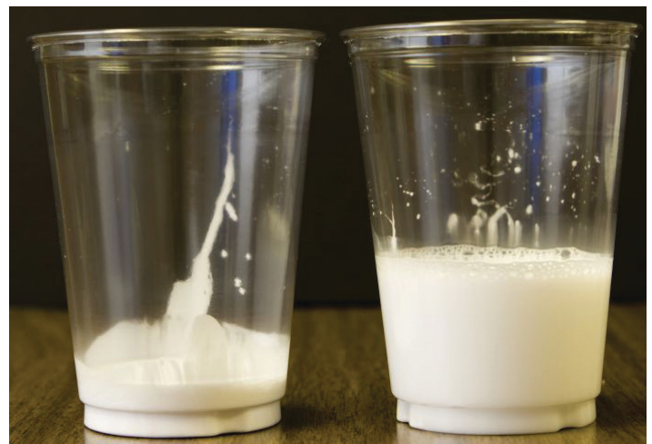
Figure 8. Undiluted and diluted liquid formulation.

substance such as clay, is ground to a very fine powder. The powder is then suspended in a small amount of liquid. The resulting liquid product is quite thick (Figure 8). Flowables and liquids share many of the features of emulsifiable concentrates, and they have similar disadvantages. They require moderate agitation to keep them in suspension and leave visible residues similar to those of wettable powders. Flowables/liquids are easy to handle and apply. Because they are liquids, they are subject to spilling and splashing. They contain solid particles, so they contribute to abrasive wear of nozzles and pumps. Flowable and liquid suspensions settle out in their containers. Always shake them thoroughly before pouring and mixing. Because flowable and liquid formulations tend to settle, manufacturers package them in containers of 5 gallons or less to make remixing easier.