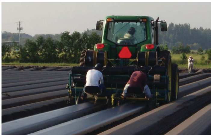
Figure 23. Soil fumigant application.