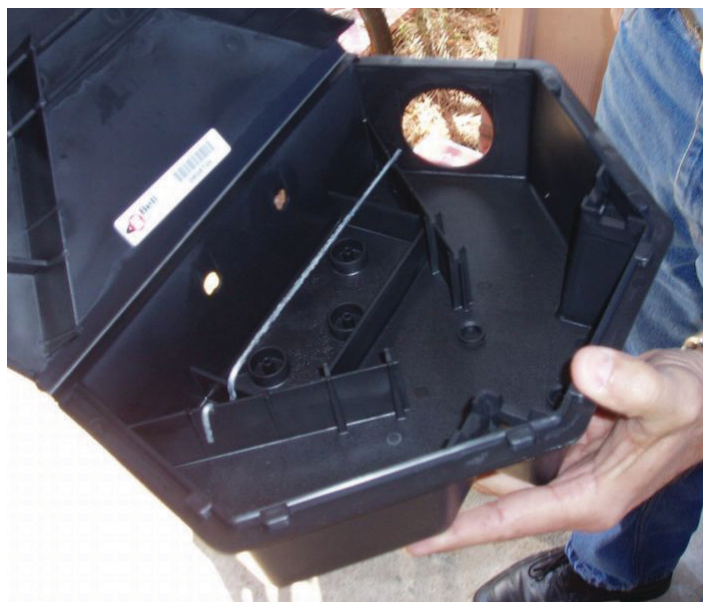
Figure 10. Tamper-resistant bait station.