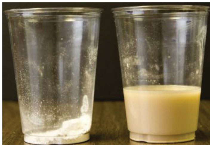
Figure 16. Undiluted and diluted wettable powder formulation.

Wettable powders are dry, finely ground formulations that look like dusts (Figure 16). They usually must be mixed with water for application as a spray. A few products, however, may be applied either as a dust or as a wettable powder; the choice is left to the applicator. Wettable powders contain 5%–95% active ingredient by weight, usually 50% or more. The particles do not dissolve in water. They settle out quickly unless constantly agitated to keep them suspended. Wettable powders are one of the most widely used pesticide formulations. They can be used for most pest problems and in most types of spray equipment where agitation is possible. Wettable powders have excellent residual activity. Because of their physical properties, most of the pesticide remains on the surface of treated porous materials such as concrete, plaster, and untreated wood. In such cases, only the water penetrates the material.