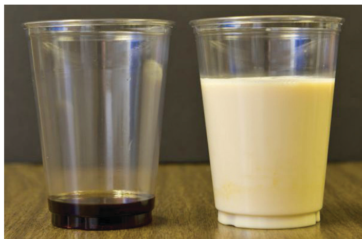
Figure 4. Undiluted and diluted emulsifiable concentrate formulation.

An emulsifiable concentrate formulation usually contains a liquid active ingredient, one or more petroleum-based solvents (which give EC formulations their strong odor), and an agent—known as an emulsifier—that allows the formulation to be mixed with water to form an emulsion. Upon mixing with water, they take on a “milky” appearance (Figure 4).