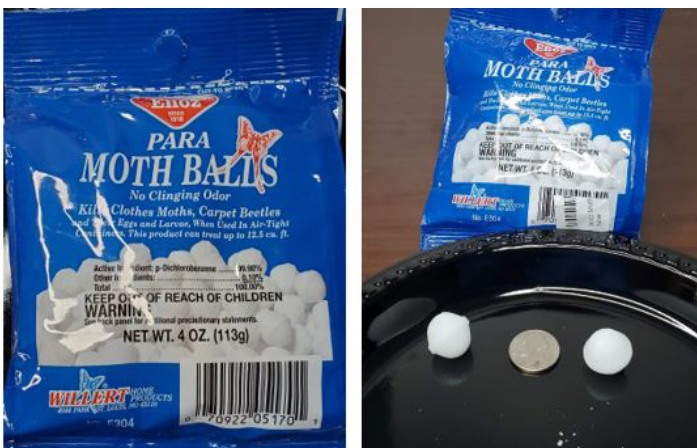
Figure 3. Solid ball formulation of moth control products.

As with any pesticide, the label is the law. The label language is not simply a set of directions. Rather, they are requirements that are legally enforceable. Therefore, the label for mothballs (Figure 4) specifies exactly where and how the product can be legally used. Using mothballs in a way not specified by the label is not only illegal but can harm people, pets, or the environment. The Florida Department of Agriculture and Consumer Services (FDACS) frequently receives complaints and investigates the misuse of mothballs. Most misuse involves outdoor placement of mothballs with the mistaken idea that this pesticide will repel snakes and other nuisance wildlife. Some snake and wildlife repellents available at retail stores do contain naphthalene; however, mothball products are not approved for such use, and this practice is illegal.