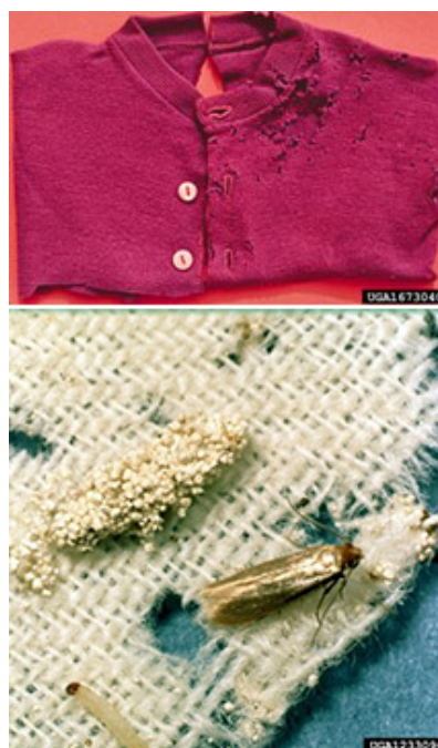
Figure 1. Example of the damage that can be caused by a clothes moth (top) and the egg, larval, and adult stages of Tineola bisselliella , which causes cloth damage (bottom).

to the label, are still an effective way to reduce the risk of severe damage to clothes when placed in storage. For more information about the life cycle and identification of the clothes moth, see ENY-223, Clothes Moths ( https://edis.ifas.ufl.edu/publication/ig090 ).