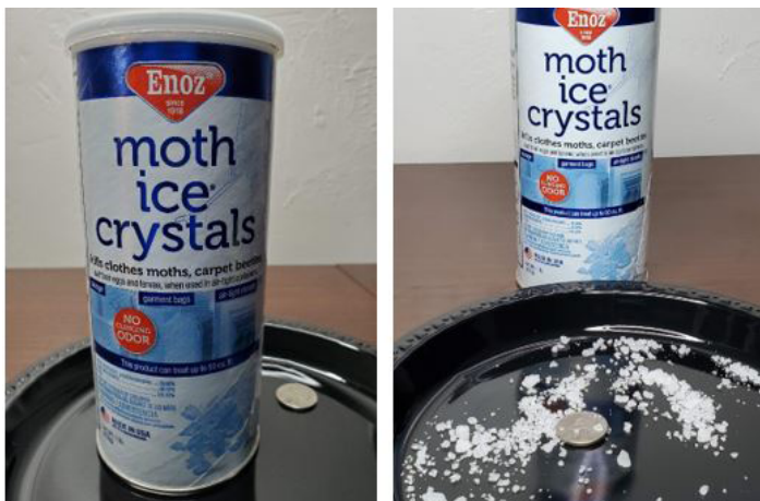
Figure 2. Crystal formulation of moth control products.

Mothballs, moth flakes, crystals, and bars are insecticides that are formulated as solids (Figure 2 and Figure 3). Mothballs are registered as pesticides because they contain high concentrations of one of two active ingredients—naphthalene or paradichlorobenzene (sometimes referred to as 1,4-dichlorobenzene). There are currently more than 30 products registered with the US EPA that contain paradichlorobenzene and more than a dozen products that contain naphthalene. Paradichlorobenzene is also found in deodorant blocks made for trash cans and toilets. Through a process called sublimation, mothballs slowly convert from a solid into a gas.