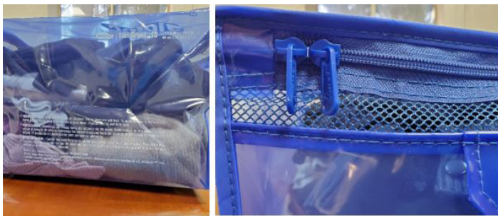
Figure 5. Sweaters stored in an airtight garment storage container with no holes (left) vs. a garment bag that has venting at the top and would be inappropriate to treat with mothballs (right).