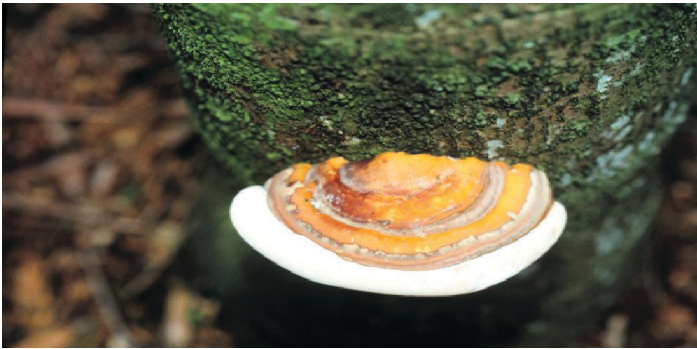
Figure 4. Basidiocarp (conk) of Ganoderma zonatum . Note glazed reddish-brown top surface and white undersurface. The “straight” side of the conk is directly attached to the trunk. There is no “stem” or “stalk” that attaches the conk to the trunk.