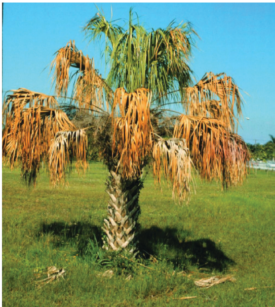
Figure 1. Sabal palmetto (sabal palm) with wilted and desiccated leaves due to Ganoderma zonatum infection.

Ganoderma zonatum is a white rot fungus that produces numerous enzymes that allow it to degrade (rot) woody tissue. The fungus first degrades lignin and then cellulose. As the fungus destroys the palm wood internally, the xylem (water-conducting tissue) will eventually be affected. Therefore, the primary symptom that may be observed is a wilting, mild to severe, of all leaves except the spear leaf (Figures 1 and 2). Other symptoms can best be described as a general decline—slower growth and off-color foliage—and more dead lower leaves than would be normal. However, these symptoms alone should not be used for diagnosis of Ganoderma butt rot, since other disorders or diseases may also cause these symptoms.