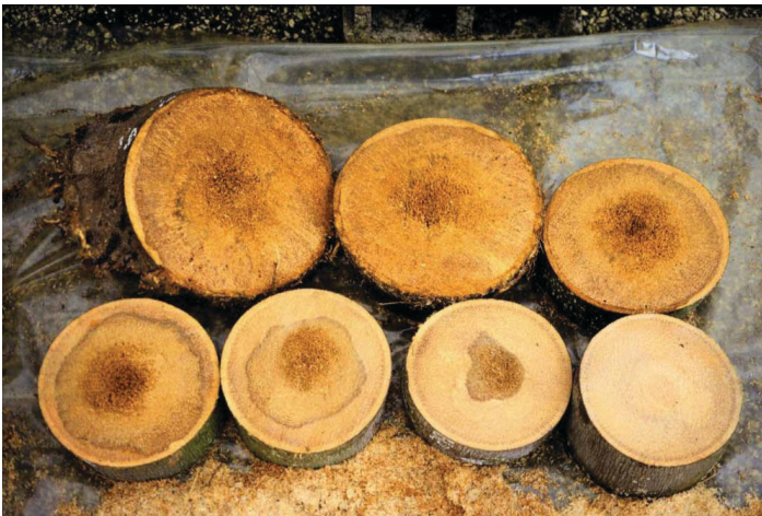
Figure 5. Cross-sections of lower trunk of Syagrus romanzoffiana infested with Ganoderma zonatum . Top-left section is bottom section (section 1) and remaining sections progress up the trunk. Note darkening of wood due to fungal degradation (rot).