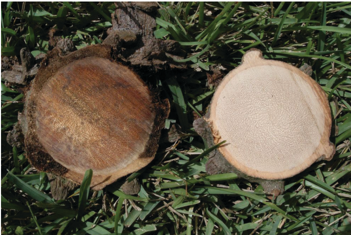
Figure 6. Comparison of pygmy date palm sections that are either healthy (right) or diseased (left) with Ganoderma zonatum .