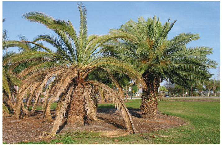
Figure 2. Phoenix canariensis (Canary Island date palm): Healthy palm (right) vs. beginning symptoms of Ganoderma butt rot (left), illustrating more dead lower leaves than would be normal (UF/IFAS 2015).

The basidiocarp or conk is the most easily identifiable structure associated with the fungus. The conk originates from fungal growth inside the palm trunk. Figure 3 illustrates different stages in the development of the conk. When the conk first starts to form on the side of a palm trunk or palm stump, it is a solid white mass that is relatively soft when touched. It will have an irregular to circular shape and is relatively flat on the trunk or stump.