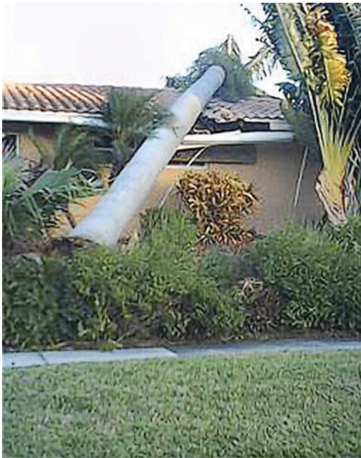
Figure 10. Roystonea regia (royal palm) fallen on house because the trunk was weakened from Ganoderma butt rot

Once a conk is observed on a palm, the palm should be removed—primarily for safety reasons (Figure 10). This is especially important during the hurricane season. As indicated before, if conks are being produced on a live palm, it means that a significant portion of the trunk is already decayed. These palms are likely to be the first blown down in heavy winds. When you remove the palm, remove as much of the stump and root system as possible. Alternatively, if you cannot remove the stump, then grind-up the stump. This will allow the infected stump material to degrade more quickly. By removing the stump or grinding the stump into smaller pieces, this will help to limit conk formation on any palm trunk material left behind. You should still monitor the site for conk formation, as described in the previous paragraph.