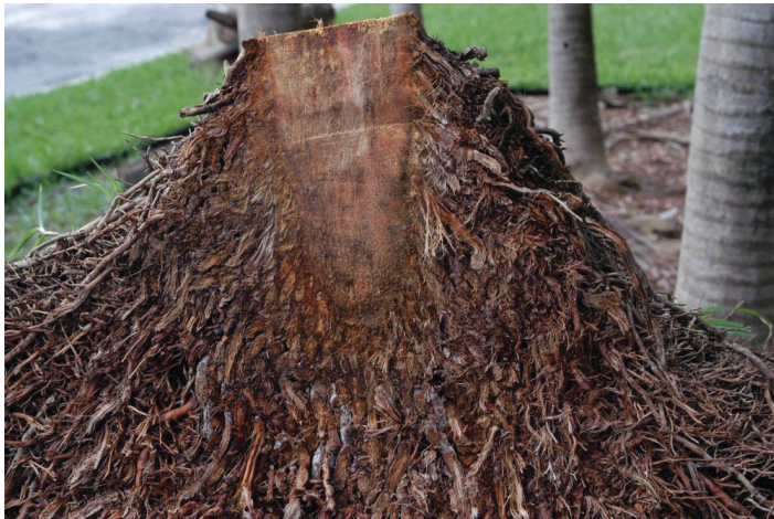
Figure 9. Longitudinal section through Phoenix roebelenii trunk and root system. The trunk is darkened due to infection with Ganoderma zonatum . The fungus is not rotting the roots but was isolated from the roots.

The fungus is spread primarily by the spores produced in the basidiocarp (conk). The spores become incorporated into the soil, germinate, and the hyphae (fungal threads) then grow over the palm roots. The fungus does not rot the palm roots, it simply uses the roots as a means of moving to the woody trunk tissue (Figure 9). Once a palm is infected with G. zonatum , the fungus will move with that palm to the location in which it is transplanted. It is also possible that soil associated with transplanted palms is infested with the fungus.