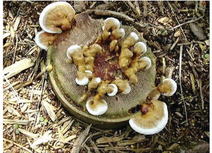
Figure 7. Cut palm stump with numerous basidiocarps (conks) of Ganoderma zonatum forming on it. The conks in the palm stump’s center are crowding each other and thus are forming into shapes different from those on the outer edges of the stump.

Conks of G. zonatum can be up to 8 inches at their widest point and 2 inches thick. However, conks will take on the shape and size of the area in which they are growing (Figure 7). Microscopic basidiospores are produced in the “pores” present on the underside of the conk. When basidiospores are dropped en masse on a white surface, they will appear brownish-red in color (Figure 8). Objects immediately around a conk that has dropped its spores may appear to be covered with a rusty colored dust. One conk can produce 3 cups of spores.