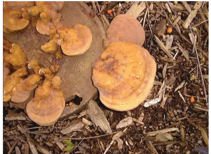
Figure 8. Spore release from mature conks (same stump as Figure 7) has resulted in reddish-brown appearance of conks and surrounding area.