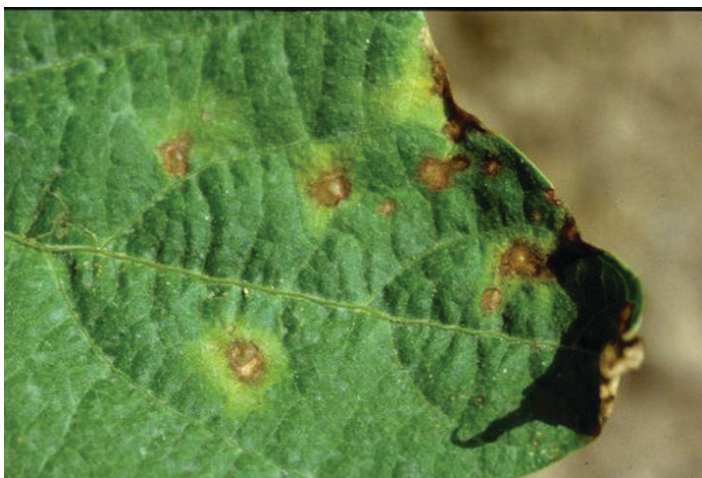
Figure 2. More advanced lesion of common bacterial blight on top surface of bean leaf showing beginning of chlorotic (yellow) halo around lesion.