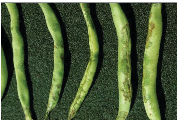
Figure 4. Striking water-soaking symptoms of common bacterial blight on bean pods.

Contaminated seed is probably the major source of bacteria introduced into new fields of bean crops. Water-soaked lesions in young bean plants may be caused by cells of X. c. pv. phaseoli from seed as these cells invade emerging seedlings. The bacterial cells may colonize the surface of