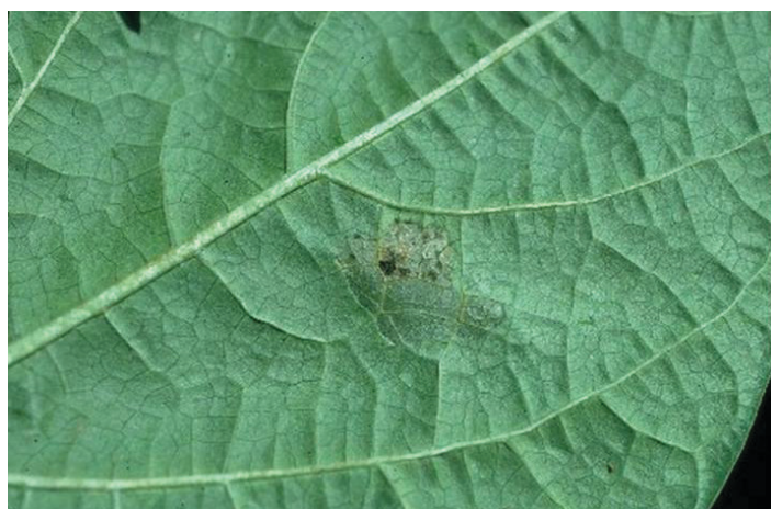
Figure 1. Initial symptoms associated with common bacterial blight on underside of bean leaves consist of water-soaked lesions.

conditions, pod lesions become covered with a yellowish bacterial ooze that can dry to a yellowish, crusty mass. Interestingly, in south Florida, significant pod symptoms can appear with little foliar damage.