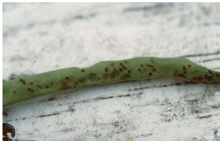
Figure 5. Advanced symptoms on bean pods, with appearance of characteristic brick-red areas in center of lesions.

shoot tissues, inciting more disease later, when favorable conditions are present.