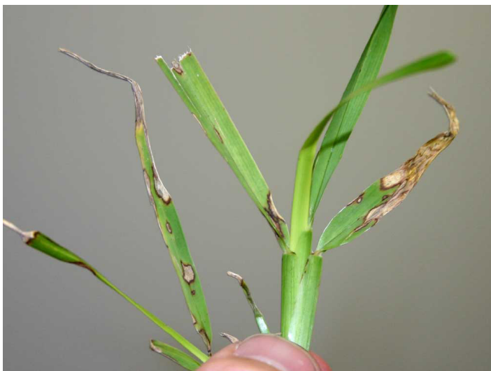
Figure 2. Gray leaf spot caused by Pyricularia grisea on a shoot of St. Augustinegrass. Lesion centers are straw-colored and surrounded by a dark necrotic border. Lesions may appear on the leaf blades, leaf sheaths, and stolons.