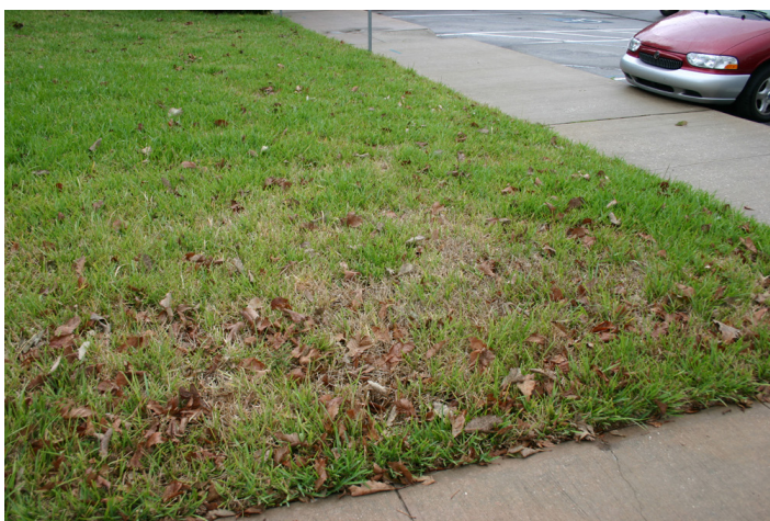
Figure 3. Established stands of St. Augustinegrass that are stressed may turn chlorotic, thin, and take on a generally unthrifty appearance when affected by gray leaf spot. Closer inspection will reveal many leaf spots on individual shoots.