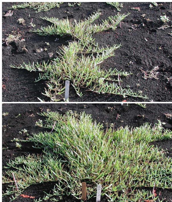
Figure 4. Gray leaf spot can substantially reduce vigor and can prolong the grow-in phase of St. Augustinegrass sprigged for sod production. Both sprigs in the figure were planted at the same time, but only the plot on the bottom was treated with a QoI fungicide product to prevent gray leaf spot.

Cultivars of St. Augustinegrass differ in their susceptibilities to gray leaf spot. The disease develops more rapidly and more severely on lush leaf tissue. Lush leaf tissue is associated with rapid growth of newly-sprigged and establishing turf than on well-established stands of turfgrass. However, excessive applications of nitrogen fertilizer can result in rapid flushes of quite susceptible lush growth in mature stands. St. Augustinegrass under stress is more susceptible to infection and disease development than healthy vigorous turfgrass. Stress generally results from improper management practices that could include summer applications of the herbicide atrazine, soil compaction, nutrient imbalances or deficiencies, improper irrigation practices, other pathogens or pests, and other factors.