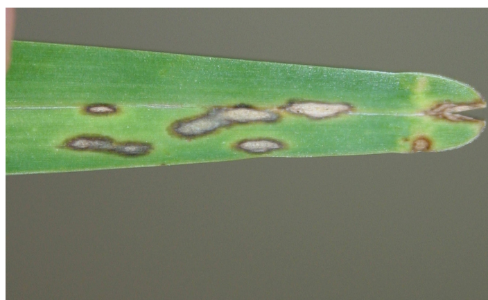
Figure 1. Leaf spot symptoms of gray leaf spot are shown on a St. Augustinegrass leaf blade. The gray coloration in the center of the lesions is a flush of spores produced after incubation at 100% relative humidity for 24 hr. Rapidly expanding lesions will sometimes have an olive green water-soaked border.

Warm rainy spells from May through September commonly produce extended periods (i.e., 12 hours and greater) of leaf wetness and relative humidity greater than 95%. During these periods, turfgrass leaf blades can remain wet and air temperatures often hover between 80 and 90 degrees Fahrenheit. Environmental conditions such as these are ideal for the pathogen growth, infection, and colonization of St. Augustinegrass. If these favorable conditions persist, leaf spots can expand to blight above-ground plant tissue.