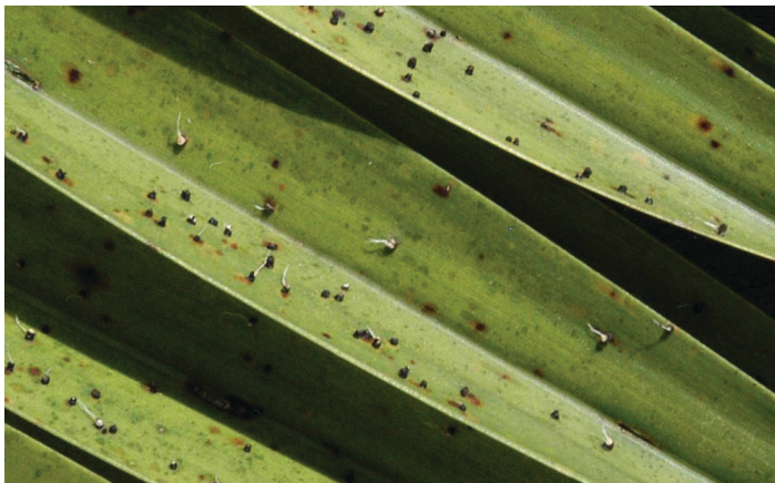
Figure 1. The small black bodies are sori (fruiting bodies) of Graphiola phoenicis that have erupted through the leaflet epidermis. The black spots are symptoms of potassium deficiency, and not Graphiola leaf spot.

The initial symptoms of the disease are very tiny ( \frac{1}{32} inch or less) yellow or brown or black spots on both sides of the leaf blade. They are easily missed without close observation. The fungus will emerge from these spots, rupturing the leaf epidermis (leaf surface) (Figure 1). It is the resulting fungal reproductive structures (sori) that are most commonly observed and which obscure any true symptoms.