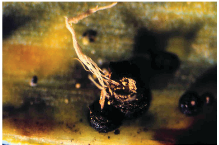
Figure 2. Close-up of sori of Graphiola phoenicis with filaments protruding.

The sorus (sori is the plural form) is a black fruiting body that is less than \frac{1}{16} inch in diameter (Figure 2). As the sorus matures and yellow spores are produced, short, light-colored filaments (thread-like structures) will emerge from the black body (Figure 2). These filaments aide in spore dispersal. Once the spores are dispersed, the sori deflate and appear like a black, cup-shaped body or black crater. You can easily see the sori, but you can also feel the sori with your finger as they are raised above the leaf epidermis. The number of sori indicates the level of infection (Figure 3).