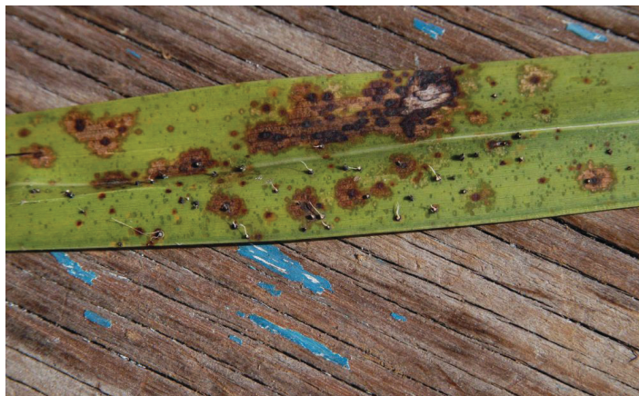
Figure 4. Mixed infection of Graphiola phoenicis and Stigmata palmivora (large brown spots). Note that some Stigmata leaf spots have a sorus of Graphiola phoenicis within the leaf spot.

It is also possible to have another leaf spot disease occurring on the same leaf as the Graphiola leaf spot, with the other leaf spot being the more serious disease (Figure 4).