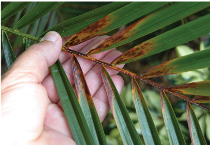
Figure 2. Spots have expanded to affect both leaflets and rachis of Phoenix roebelenii .

If the pathogen is restricted to only causing leaf spots, the disease may not be very damaging to the palm, especially a mature palm in the landscape. However, with juvenile palms that have no trunk and only a few leaves, the palm could be severely affected by the leaf spots.