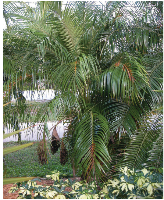
Figure 3. Note that multiple leaves of this Phoenix roebelenii have expanding lesions due to Pestalotiopsis .

If the pathogen is restricted to only causing leaf spots, the disease may not be very damaging to the palm, especially a mature palm in the landscape. However, with juvenile palms that have no trunk and only a few leaves, the palm could be severely affected by the leaf spots.