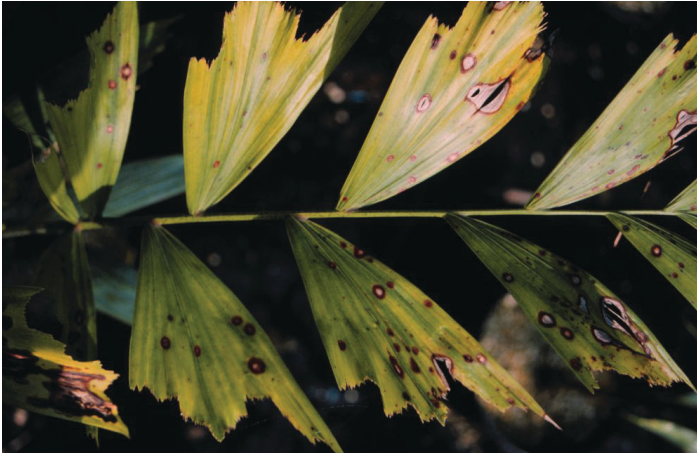
Figure 5. These leaf spots on Wodyetia bifurcata are necrotic tissue surrounded by a brown halo. They are often observed when iron deficiency is also a problem, as shown in this photo.

nutrient deficiencies is the first step in managing leaf spots and leaf blights.