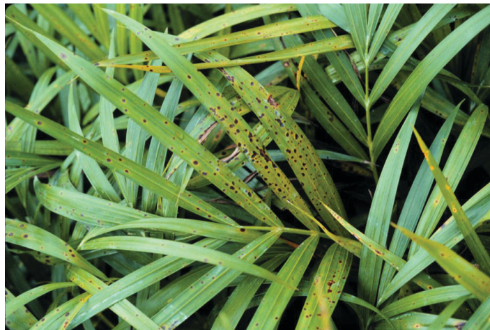
Figure 2. Leaf spots on palm leaflets. These are brown with a chlorotic (yellow) halo. Note that as spots increase in number and size that there is a merging of dead tissue (blight).

a feather palm blade are diseased. If severe enough, entire leaflets or leaves may desiccate and die as lesions expand and coalesce, causing leaf blights.