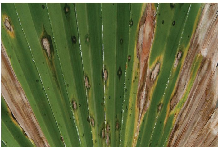
Figure 1. Multiple stages of leaf spots on palm leaf blade – small lesions surrounded by water soaking to large areas of blighted, necrotic tissue.

In general, the initial symptom for leaf spots is a small, water-soaked lesion (Figure 1). Within days, this lesion turns to varying shades of yellow, gray, reddish-brown, brown, or black. The colored lesions may be surrounded by a halo or ring of tissue that is a different color (Figure 1). For example: black spots surrounded by chlorotic (yellow) halos; yellow spots surrounded by reddish-brown rings or black rings; gray spots surrounded by a black ring, which is surrounded by a chlorotic halo. The common theme is that there is a disruption in the normal, uniform color of the leaf blade and that disruption is round or oblong in shape (Figure 2, Figure 3, and Figure 4). The size of the spots varies with each pathogen. Eventually, this diseased tissue will die.