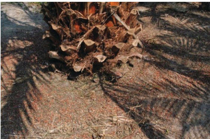
Figure 1. Premature fruit drop is an early symptom of LB.

The first symptoms of LB are variable. However, if fruit is present, the first symptom is generally premature fruit drop (Figure 1). If fruit has not set but inflorescences are present, they will become necrotic (Figure 2). Note that if the palm is not old enough to produce fruit, if it is not putting out an inflorescence at the time of infection, or if the inflorescences are trimmed, then these will not be reliable indicators for infection status. Inflorescence necrosis/fruit drop progresses to discoloration of the oldest leaves (closest to the ground) that gradually advances to younger leaves (Figure 3). The final stage of the disease is the collapse of the spear leaf, indicating that the heart or bud of the palm (apical meristem) has died and the palm has completely declined with no chance of saving it. The length of time between infection and symptom development (latent period) appears to be about four to five months. From symptom development to collapse of spear leaf is about two to three months, but this is highly variable. In some cases, no leaf discoloration is observed, but the spear leaf will collapse and the palm will test positive. Symptom progression occurs at different rates in different palm species.