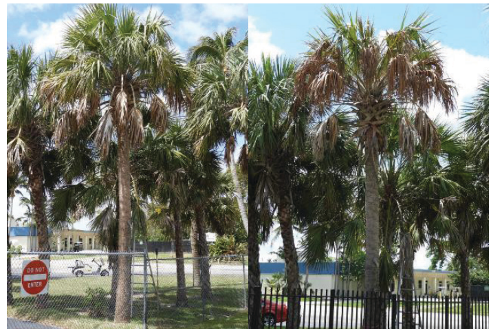
Figure 3. Symptom progression of LB in a Sabal palmetto demonstrating discoloration of older leaves first, March 2018 (left); then three months later where more, younger leaves are affected and spear leaf has collapsed (right).