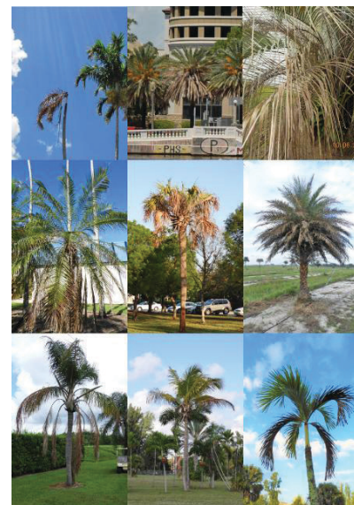
Figure 4. Various ornamental palms displaying symptoms of LB.