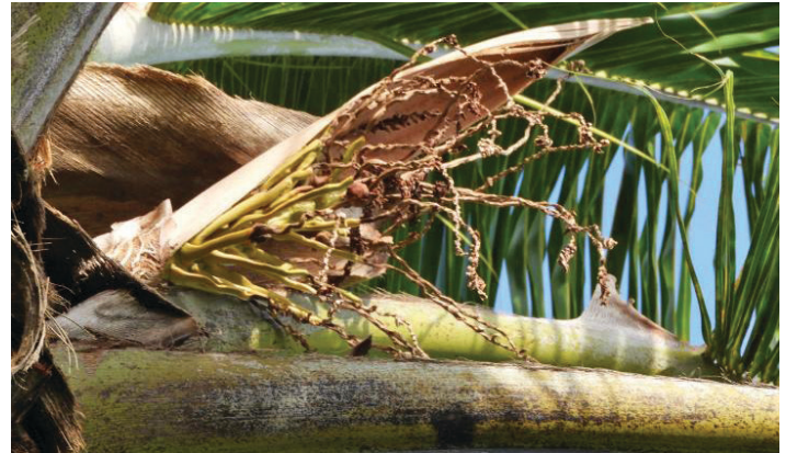
Figure 2. Necrotic inflorescence on a Coconut palm infected with LB.

the northernmost limit and the Florida Keys being the southernmost record. The disease has also been reported in Louisiana.