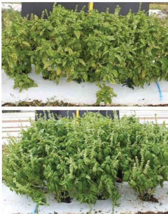
Figure 1. Symptoms of downy mildew on field-grown basil (top) compared with healthy basil plants (bottom).

leaf surface and chlorosis of the adaxial (upper) leaf surface make basil leaves unacceptable for the marketplace.