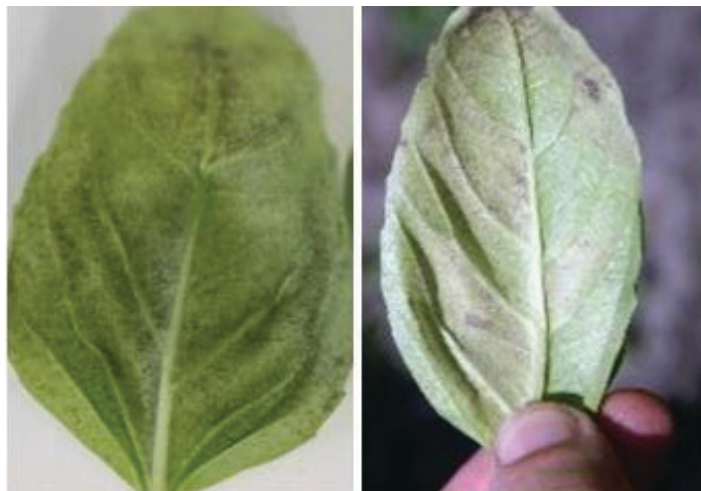
Figure 3. Sporulation evident on underside of the basil leaf.