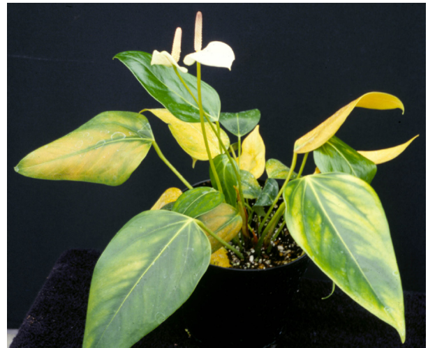
Figure 7. Ralstonia bacterial wilt causes yellowing (chlorosis) of Anthurium leaves.

Symptoms: Leaf yellowing (chlorosis) is usually the first symptom observed. The disease spreads rapidly throughout the vascular system of the plant, turning veins in the leaves and stems a brown, bronze color (Figure 8). Bacterial ooze (brown slime) will be present if cuts are made into the stems of highly infected plants. Plants will exhibit wilt symptoms even though adequate soil moisture is available.