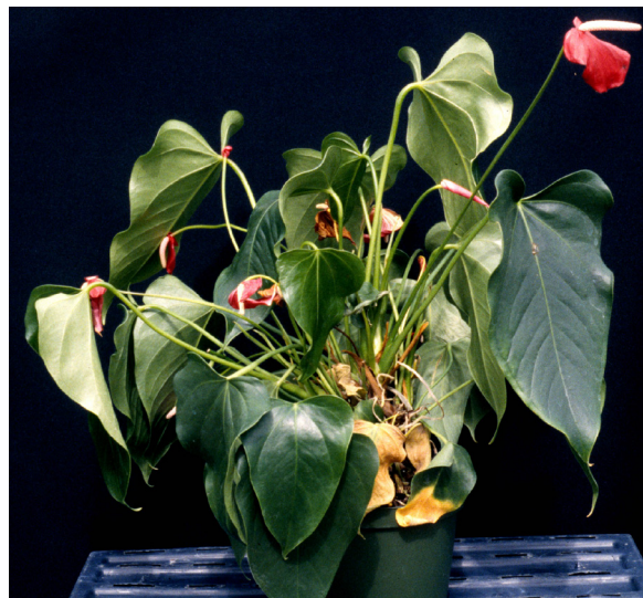
Figure 9. Anthurium wilt caused by Rhizoctonia root rot.

Rhizoctonia can survive within soil for years without a host plant. The fungus produces small mats of tightly woven mycelia called sclerotia. Sclerotia are irregular in shape, brown in color, and resemble particles of soil. Sclerotia