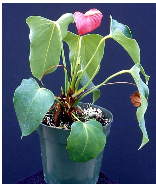
Figure 11. Anthurium wilt caused by Phytophthora .

Both Phytophthora and Pythium are called “oomycetes,” commonly known as water molds. The control, spread, and management recommendations for Phytophthora and Pythium infestations are the same. Plants infected with either of these pathogens exhibit wilting, leaf yellowing (chlorosis), and root dieback (Figure 11).