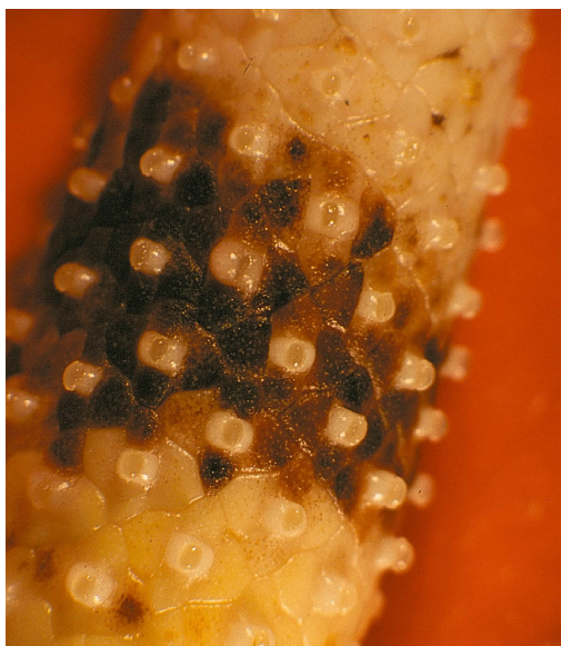
Figure 13b.

The first symptoms observed are small, brown to black flecks on the floral spadix (nose) (Figure 13). These spots rapidly enlarge, become watery, turn brown to black, and may totally encompass the spadix. The spadix may eventually fall off. Growers may also observe black, spore-containing structures (acervuli) on dead leaves and stems.