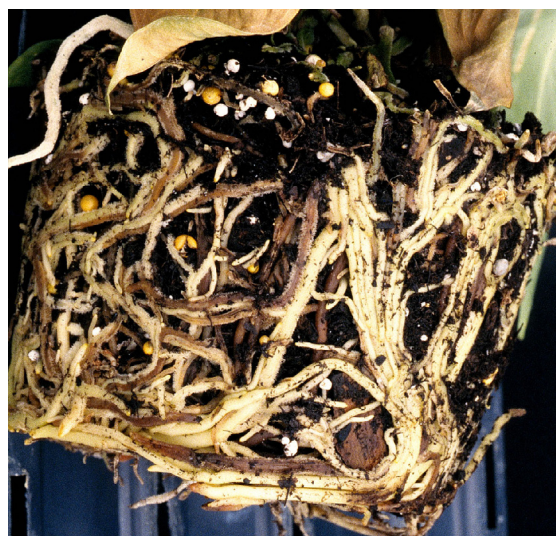
Figure 10. Discolored brown roots are one of the symptoms observed with Rhizoctonia infections.