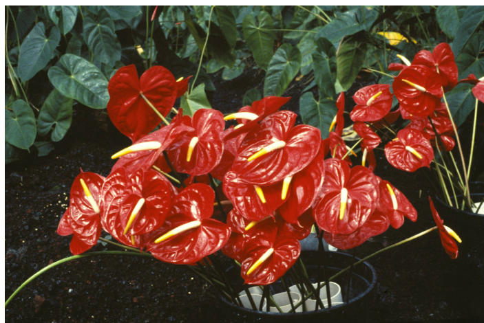
Figure 1. Anthurium 'Kozohara' used in cut-flower production.

Most cut-flower Anthurium cultivars are selections of Anthurium andraeanum , an epiphytic-growing plant native to Columbia and Ecuador. The large red flowers produced by Anthurium andraeanum cultivars are very recognizable to consumers (Figure 1). Breeding has introduced such