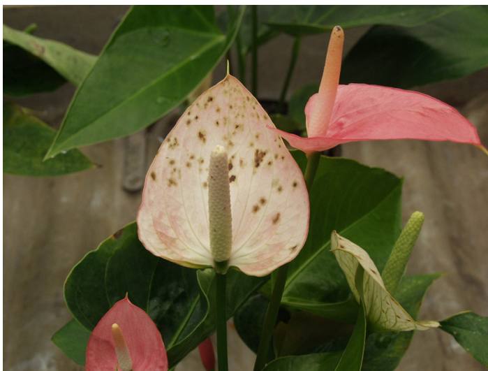
Figure 6. Xanthomonas bacterial blight lesions can also appear on the flowers.

Factors Favoring the Disease: Bacteria can swim across wet surfaces; therefore, it is very important to keep the foliage dry. The most effective way of accomplishing this is through drip irrigation.