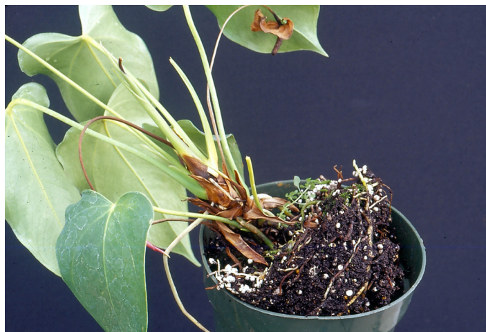
Figure 12. Pythium and Phytophthora cause root sloughing.

Factors Favoring the Disease: Water-saturated soils are conducive to disease development. These diseases can usually be avoided by using light, well-drained soil mixes.