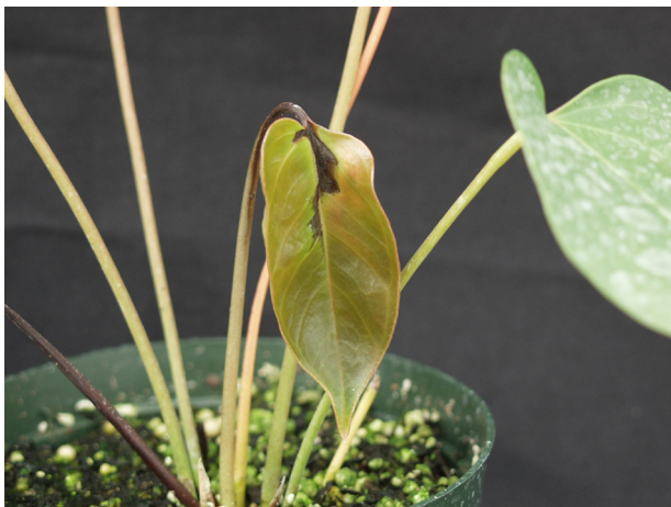
Figure 8. Wilt symptoms are the byproduct of Ralstonia bacteria clogging the vascular system of the plant.