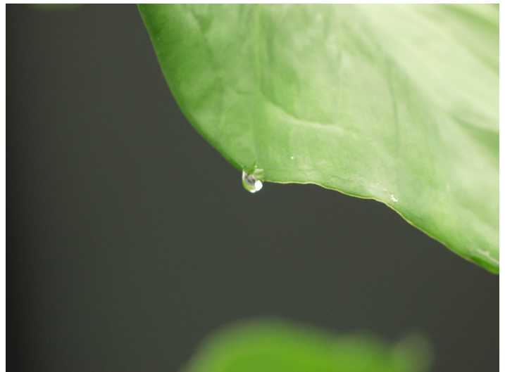
Figure 4. Xanthomonas bacteria enter the leaf margins via pores (hydathodes) where guttation droplets form.