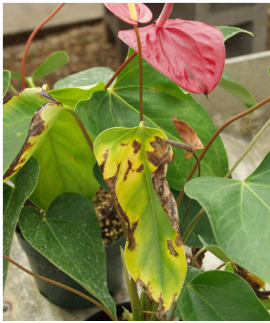
Figure 5. Extensive necrosis develops on Anthurium plants that are systemically infected with Xanthomonas bacterial blight.