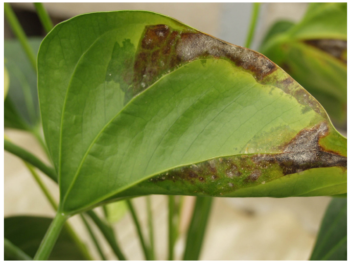
Figure 3. Xanthomonas bacterial blight exhibits characteristic V-shaped, water-soaked lesions forming along the edges on Anthurium leaves.

Guttation droplets form at night when humidity is high and potting soil is warm and wet. Amino acids found in this guttation fluid are a source of food for the invading bacteria. Some infected plants are asymptomatic (do not show any disease symptoms) for months as the bacteria multiply. Bacteria in the guttation fluid from these asymptomatic infected plants can infect adjacent plants.