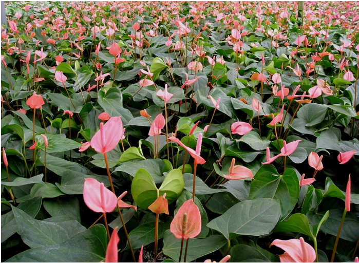
Figure 2. Anthurium ‘Orange Hot’ used in flowering potted plant production.

‘Red Hot’ (Henny, Chen, and Mellich 2008a), ‘Orange Hot’ (Figure 2) (Henny, Chen, and Mellich 2008b), and ‘Southern Blush’ (Henny, Poole, and Conover 1988).