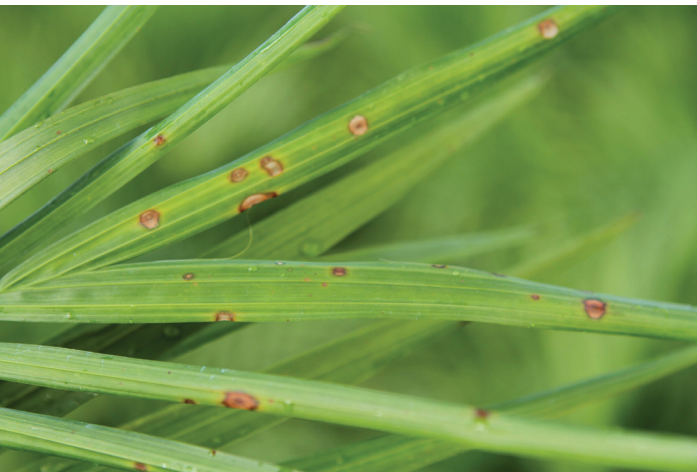
Figure 2. Ravenia rivularis leaves exhibiting leaf spots in early stages of development.