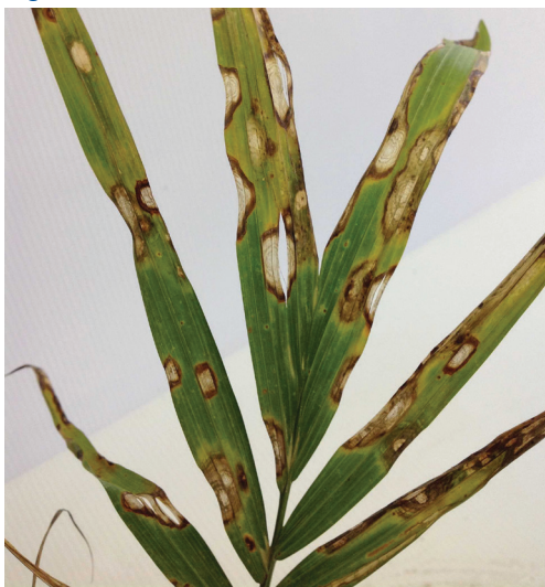
Figure 3. Chamaedorea cataractarum leaf with expansive necrotic lesions.