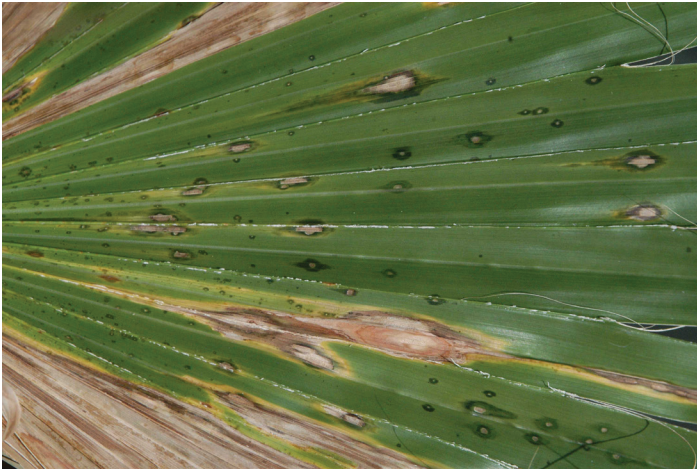
Figure 1. Washingtonia filifera leaf exhibiting multiple stages of leaf spot development, from beginning pinpoint water-soaked lesions to expansive necrotic areas.

leaves desiccate because of lesion expansion (Figures 4 and 5).