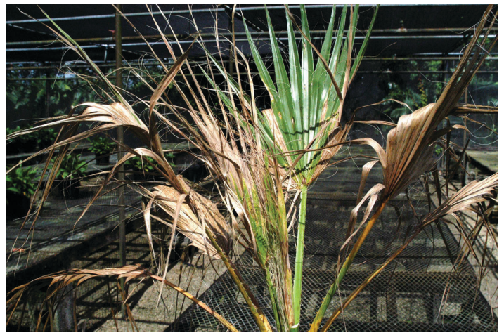
Figure 4. All the older leaves of this Washingtonia filifera have died because of Calonectria leaf spot. The youngest, fully expanded leaf is declining, and even the spear leaf is being affected as it emerges. Credits: M. L. Elliott