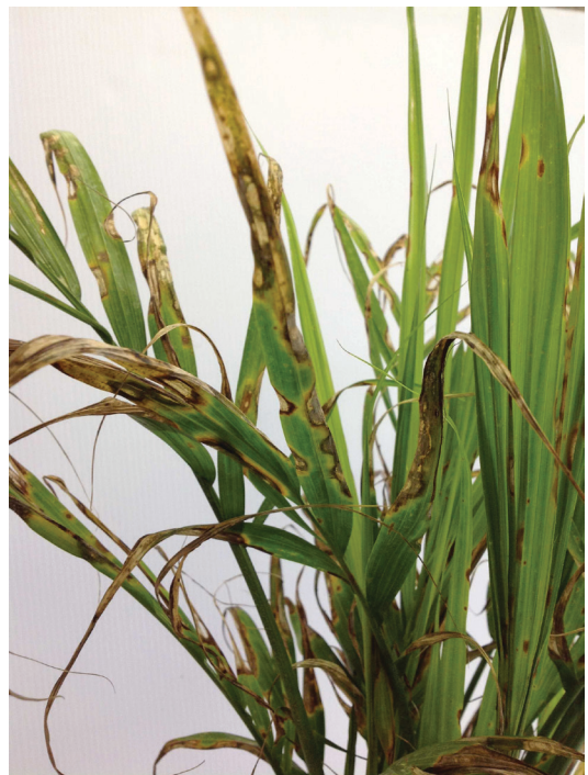
Figure 5. Chamaedorea cataractarum severely affected by Calonectria leaf spot as lesions merge together to kill leaflets and eventually entire leaves.

Leaf spots usually appear on leaves of all ages, although fully expanded, mature leaves seem to be most susceptible. When the spots are discretely separated from each other by green tissue, the disease is called a leaf spot. In contrast, when these spots expand and merge together, it is referred to as leaf blight.