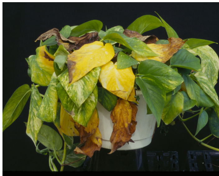
Figure 3. Ethylene damage of pothos. Note the light brown leaves.

Ethylene causes pothos foliage to turn yellow, then tan to light brown (Figure 3). Plants may appear wilted even though soil moisture is adequate.