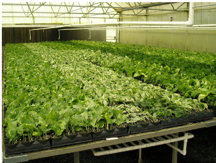
Figure 1. Commercial production of pothos.

The tropical ornamental vine Epipremnum aureum (plant family Araceae), commonly known as pothos, has been grown commercially in the United States for almost 100 years. Pothos consistently ranks among the top wholesale production foliage plants in Florida (Figure 1). It is usually produced in hanging baskets for the patio, as climbing totem poles for commercial offices, or in small pots for dish gardens. Pothos is commonly used as an interiorscape plant due to its ease of growing, hardiness, and visual appeal.