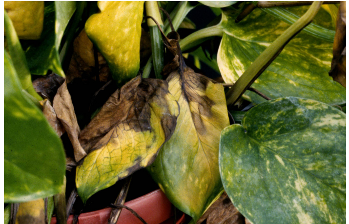
Figure 5. Bacterial wilt of pothos. Note the discolored veins.

Bacterial wilt causes pothos leaves to wilt. Veins in the leaves and stems turn black (Figure 5). If infected stems are cut and placed in water, one can observe millions of bacteria being released. It is common to observe bacterial ooze on recently cut stems (Figure 6).