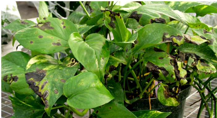
Figure 7. Rhizoctonia blight on pothos leaves.

Rhizoctonia causes irregular, dark, necrotic spots on pothos leaves (Figure 7). Leaves mat together and strands of the fungus may be visible. If Rhizoctonia infects roots during propagation, cuttings will wilt, turn dark brown, and die.