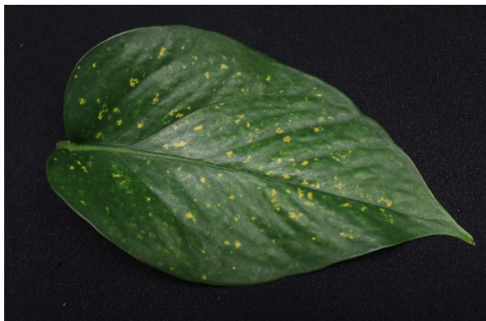
Figure 9. Manganese toxicity of pothos. Note the yellow flecking.

Older pothos leaves show yellow flecking or spotting (Figure 9). Veins may darken. Leaves may drop prematurely. This condition is usually seen in stock plants.