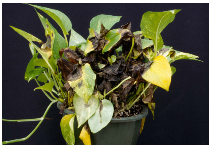
Figure 2. Phytophthora root rot of pothos. Note the dark brown leaves.

Infection usually starts in the roots, eventually spreading to leaves and throughout the whole plant. Phytophthora root rot causes pothos leaves to turn dark brown to black (Figure 2). The veins in the leaves and stems do not blacken with infection.