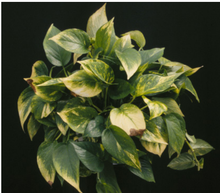
Figure 4. Fungicide damage (mefenoxam) of pothos. Note marginal bleaching of leaves.

White bleaching and tip burn of pothos leaves are caused by applications of fungicides containing mefenoxam (Figure 4).