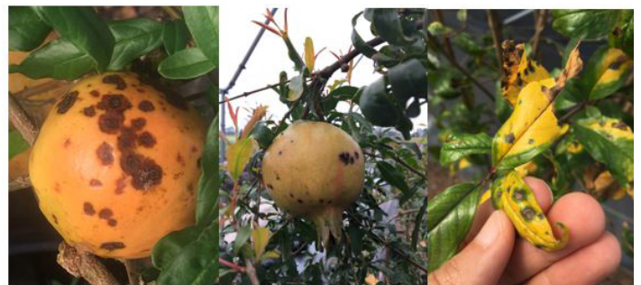
Figure 5. Fruit and leaf spot caused by P. punicae .