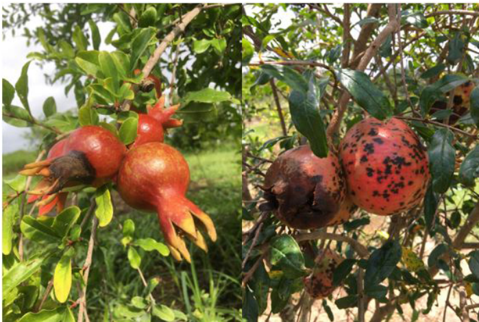
Figure 2. Fruit rot of pomegranate caused by Colletotrichum spp.

Pseudocercospora punicae causes another very common disease on pomegranate in Florida, which has also been associated with leaf or fruit spots. On the leaves, the symptoms start as small (0.1–0.3 cm), irregularly shaped dark brown lesions. These lesions can expand (0.5–1.2 cm) and develop a distinct, dark brown margin with gray coloration. Sometimes the lesions are large enough to observe concentric rings of alternating dark and light gray in the lesion center (Figure 5). A greenish halo often forms around the lesions and becomes very pronounced as the leaves yellow from chlorosis. Eventually leaves senesce, leading to severe defoliation, which can reduce yields. Symptoms on the fruit are small irregular black lesions that can later coalesce into bigger blotches (Figure 5). Lesions caused by P. punicae on the fruits are superficial only, contrary to Colletotrichum and other fungal pathogens, which affect the rind and arils. The symptoms on leaves and fruits can vary among the different pomegranate varieties.