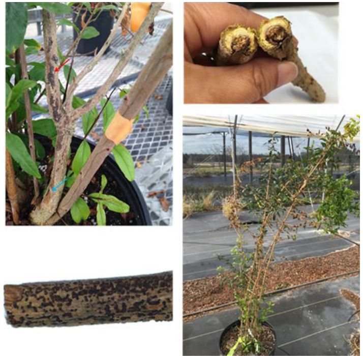
Figure 8. Botryosphaeria stem canker and shoot blight of pomegranate caused by Neofusicoccum parvum and Lasiodiplodia theobromae .

with deep cracks and numerous fruiting bodies a year after infection (Figure 8). Stems are slowly girdled and the tree dies after one to two years. Numerous fruiting bodies become visible on the surface of infected stems (Figure 8, bottom and upper left).