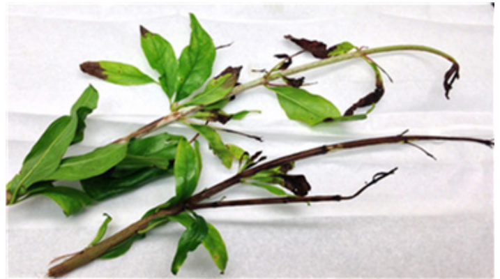
Figure 4. Stem tip dieback of pomegranate caused by Colletotrichum spp.