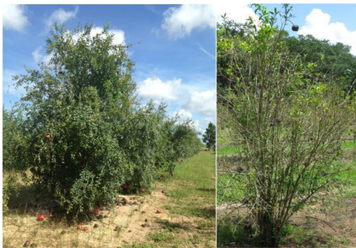
Figure 10. Fruit drop, fruit mummification, and defoliation of pomegranate in Florida orchards caused by combination of different pathogen species.