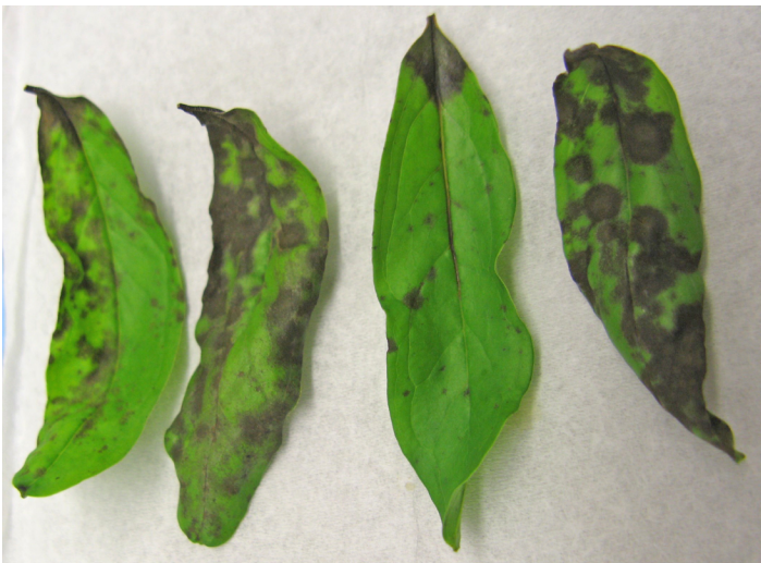
Figure 3. Anthracnose leaf spot of pomegranate caused by Colletotrichum spp.