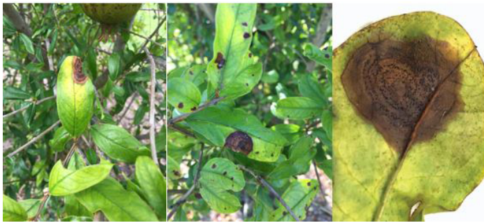
Figure 6. Leaf spots caused by Dwiroopa punicae with a close up on the lesion showing pycnidia as black dots on its center.

Dwiroopa punicae , a novel fungal species belonging to the order Diaporthales, is also associated with leaf spot and fruit rot on pomegranate (Xavier et al. 2019b). Leaf spots associated with this fungus are oval and brown, vary from 0.1 to 1.5 cm in diameter, and appear scattered on the leaf surface (Figure 6). Abundant black pycnidia (resembling little black dots) become visible on the lesion center (Figure 6, last on the right). The symptoms caused by D. punicae on the fruit start as small brown lesions on the fruit calyx at different stages (Figure 7).