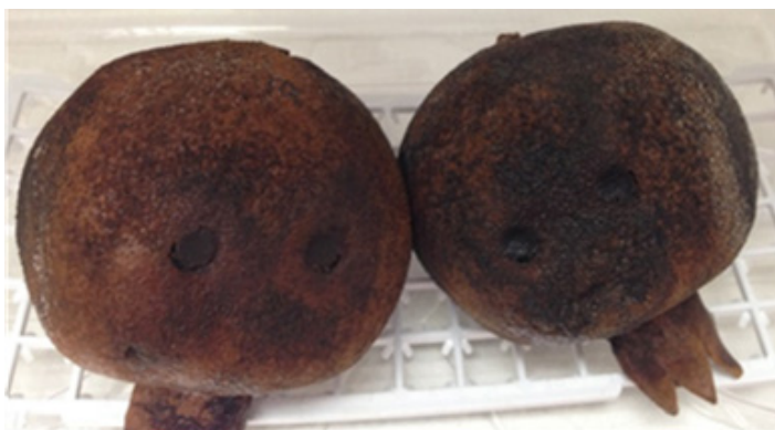
Figure 9. Fruit rot caused by Pilidiella granati . Black dots are the pycnidia on fruit surface.