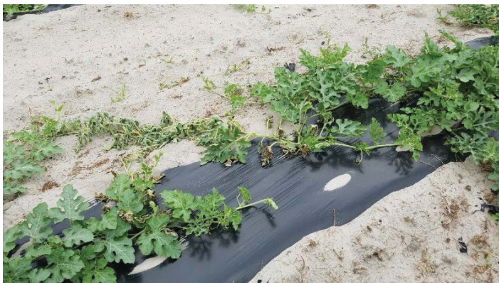
Figure 2. Watermelon plant exhibiting typical symptoms of Fusarium wilt known as "sectoring," where one vine is wilted while another remains asymptomatic on the same plant.