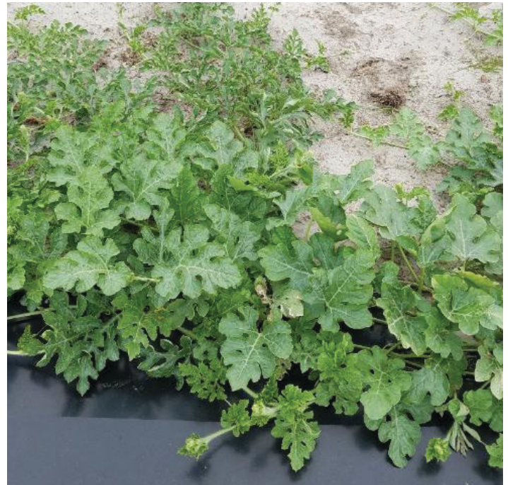
Figure 3. Watermelon field with reduced plant stand due to Fusarium wilt.

Conditions that favor Fusarium wilt are moderate soil temperatures (77°F–80°F) and wet weather. Light and sandy soils and acidic soils (pH 5.5 to 6.5) contribute to disease severity.