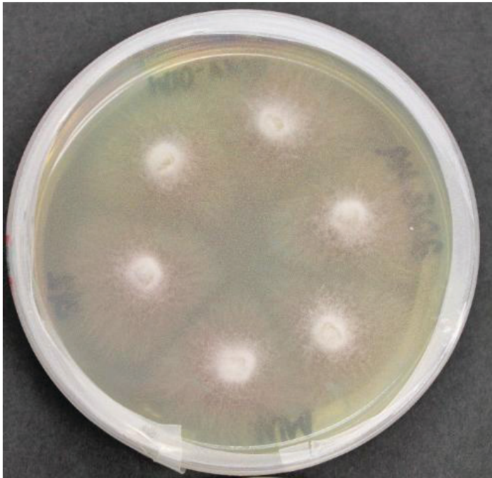
Figure 1. Growth of the fungus Fusarium oxysporum f. sp. niveum on artificial media in lab petri plate.

may appear white and healthy early in the infection (Figure 4). However, in later stages of the disease, the entire root may become dark brown, and a soft rot may develop near the crown. Infected seedlings in transplant houses may rapidly wilt and die without exhibiting the typical vascular discoloration (Figure 5).