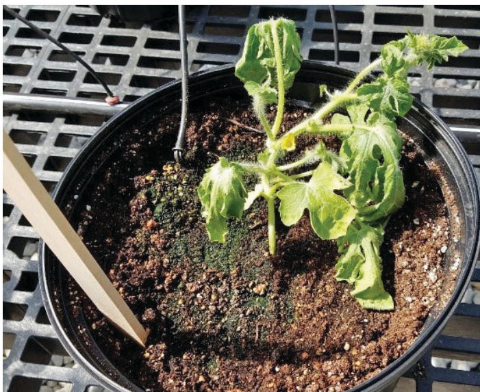
Figure 5. Transplanted seedling in the greenhouse exhibiting wilting and yellowing due to infection with the Fusarium wilt fungus.