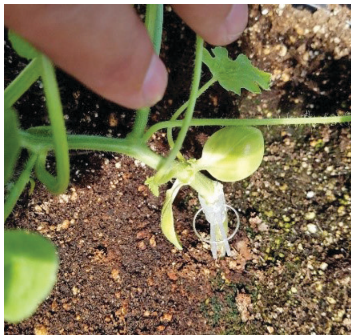
Figure 6. Watermelon scion grafted onto Fusarium wilt-resistant rootstock.

Delaying planting by 1 to 4 weeks can reduce Fusarium wilt disease incidence. This management method does delay harvest by 5 to 7 days for a 4-week delay in planting, but this delay is highly dependent on growing degree-days (a heat index that can be used to predict when a crop will reach maturity) after transplanting and the variety.