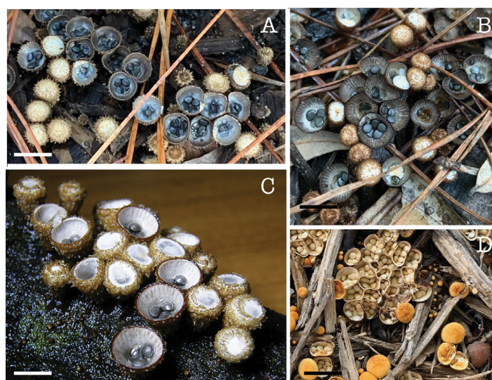
Figure 1. Images of common bird’s nest fungi in the United States. A: Cyathus pallidus showing both mature and immature fruiting bodies (MES-3576). Gainesville, Florida. B: Cyathus poeppigii showing both mature and immature fruiting bodies. Gainesville, Florida. C: Cyathus annulatus (NK-50) showing both mature and immature fruiting bodies. Walton, Georgia. D: Crucibulum parvulum (NK-117) showing both mature and immature fruiting bodies. Minneapolis, Minnesota. All scales = 0.5 centimeters.

same order of fungi, called Agaricales, which includes many species of gilled mushrooms.