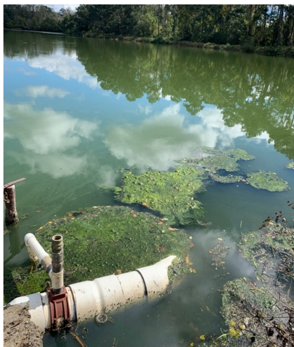
Figure 2. A cyanobacteria bloom in a lake in Havana, FL.

Primary production in coastal and estuarine systems is thought to be nitrogen limited, which means that additional inputs of nitrogen, not phosphorous, would cause eutrophication (Howarth and Marino 2006). To better understand the role of nitrogen on algal growth in coastal systems, oceanographers conducted a study similar to the work in Canadian lakes. This time they added nitrogen and phosphorus to coastal waters. Unlike the freshwater lake study, the addition of phosphorus had no effect on algal growth; rather, the nitrogen was the nutrient that had the biggest effect on algal growth (Oviatt et al. 1995). Researchers have identified several factors that cause nitrogen to be more important for algal growth and eutrophication in coastal systems than in lakes. For example, while nitrogen fixation does occur in coastal areas, there are fewer nitrogen fixers, and rates of nitrogen fixation are low. Further, coastal areas not only receive nutrient inputs from the land but also from the ocean. Nutrient inputs from the ocean can be large, particularly for phosphorous, because phosphorous is highly abundant in the ocean compared to nitrogen.