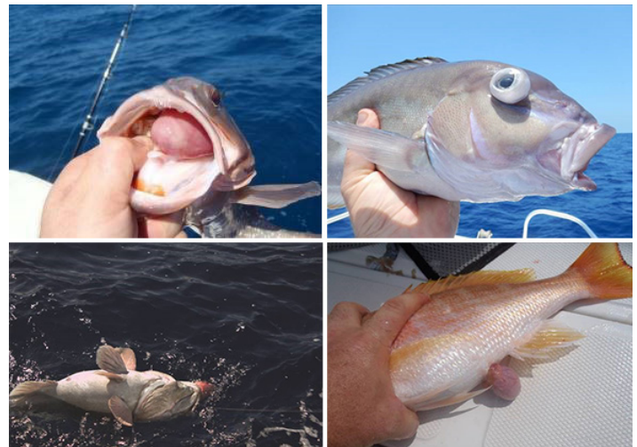
Figure 1. Signs of barotrauma include: everted or protruding stomach coming out of the mouth (top left); bulging eyes (top right); bloated belly (bottom left); distended intestines (bottom right).

Barotrauma severity and likelihood increases with depth; most cases occur deeper than 30 feet. Certain species are more susceptible than others, and high temperatures may increase the severity of barotrauma.