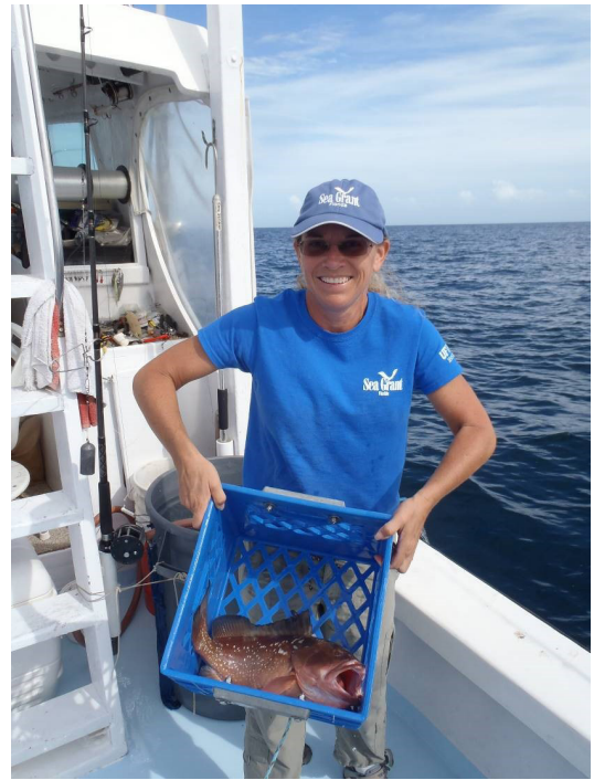
Figure 6. A weighted milk crate placed upside down in the water is one tool used for weighted descent.