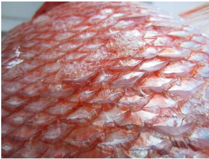
Figure 2. Signs of barotrauma also include bubbling scales, and inability to return to depth.

No one likes the sight of floaters. Fishery regulations that require fish to be released will only be effective if fish survive. Reducing discard mortality could lead to more fishing opportunities in the future.