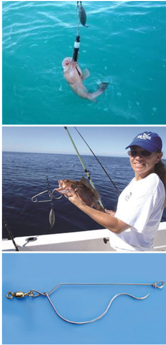
Figure 7. Common weighted descent tools include: pressurized-release tools (top); weighted spring-release tools (middle); and S-shaped wire hook clips (bottom).

A third option is the fish “elevator,” which involves an inverted container such as a milk crate with a rope attached to the top and weights on the bottom. This creates a bottomless cage that brings fish back down to depth. When the fish recompresses, it is able to swim out of the bottom of the container on its own.