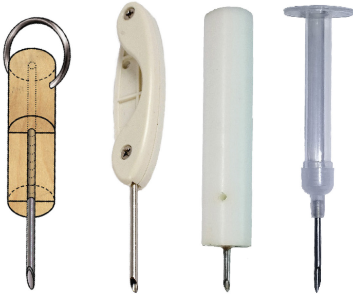
Figure 5. Common venting tools. (Pictured images do not imply commercial endorsement.)

To properly vent, lay the fish on its side (on a cool, wet surface). Venting tools should be inserted at a 45-degree angle, under a scale at the trailing edge of the pectoral fin, just deep enough to release trapped gas from the swim bladder. Never insert venting tools into a fish's belly or back or into its stomach if it is protruding from its mouth.