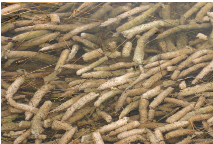
Figure 2. Periphyton in the Everglades.