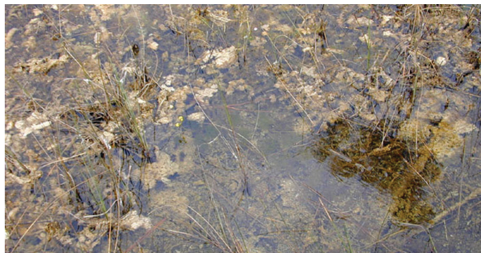
Figure 1. Periphyton in the Everglades.

underlying the Everglades and from surface water inputs containing high cation concentrations. Periphyton is crucial and a fundamental part of the food web as the primary food source for small consumers, including fish and invertebrates (Gaiser 2008 and Lakewatch 2000). The South Florida Water Management District generated a model demonstrating the significance of periphyton for water quality and its interaction with other ecosystem components (Figure 3). Through physiochemical interactions with the surrounding environment and biota, periphyton affects many biological communities and ecosystem features including nutrient concentrations, soil quality, and dissolved gases (Gaiser 2008). For example, periphyton provides dissolved oxygen through photosynthesis to sustain much of the aquatic life in its surroundings (Lakewatch 2000). Furthermore, because periphyton responds rapidly to changes in the environment, it is an indicator of changing conditions (Gaiser 2008 and Lakewatch 2000).