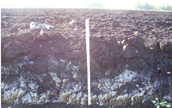
Figure 3. Presence of calcium carbonate in the form of limestone gets higher as the soils become shallow, raising the pH.