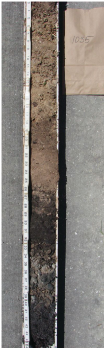
Figure 2. Removing a soil core or vertical slice from the disturbed soil to compare with the description of the native soil indicated on the site soil survey can provide information about the extent of soil disturbance during construction activities.

and size of air-filled pores, which are critical in providing the plant roots with oxygen (Figure 3). Compaction can also increase resistance to root penetration, which can cause poor/shallow rooting and thus poor plant growth. There is often an increased need for irrigation and fertilization in compacted soils because of the limitations to plant growth encountered under compacted conditions. Poor plant growth in compacted soils can also require replacement of dead or declining plant material, often at additional cost to the homeowner or landscape professional.