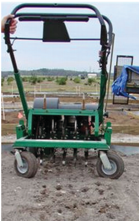
Figure 4. Plug aeration can be used to improve drainage in compacted soils with minimal effect on established plant roots or turfgrass.

wet or dry areas into account by choosing plant species tolerant of these conditions. Actions, such as tillage and adding organic amendments, may alleviate drainage issues if compaction is the cause. Additionally, aeration with a soil core aerator (Figure 4) can help to moderately increase drainage in some situations.