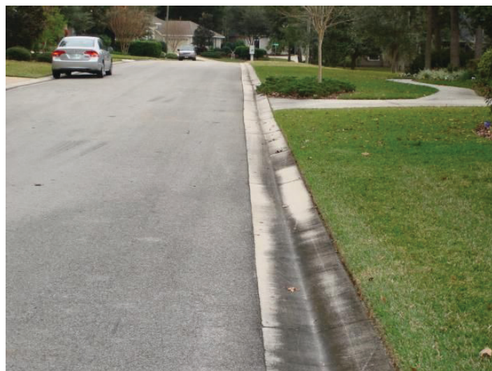
Figure 2. A discoloration of the roadway gutter is a sign of continual wetting from lawn runoff.