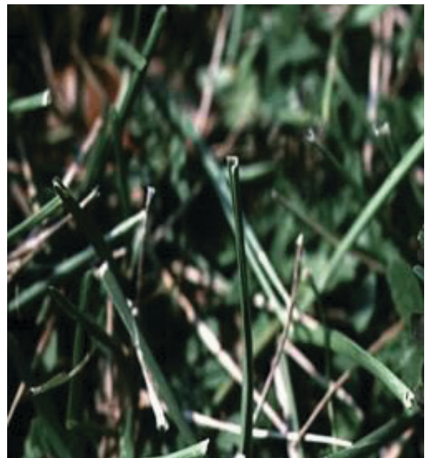
Figure 3. Leaf blades folded in half lengthwise illustrate drought stress.