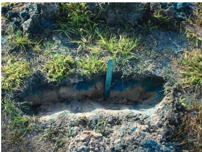
Figure 4. Digging the dyed areas allows you to see how the dye moves in sandy soils.