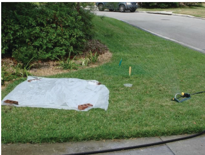
Figure 3. More irrigation is applied to the second treatment area so that it receives a higher amount of irrigation, while the first area is covered with the tarp so that it receives a lower amount of irrigation.