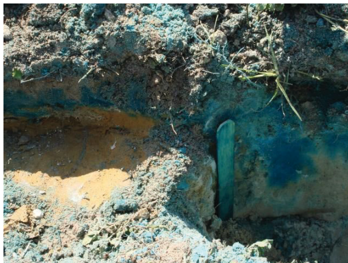
Figure 5. This photo shows a comparison of the depth that the dye moves in clay soils (left) versus sandy soil (right).

When water moves through the soil, nitrogen and other nutrients move with it. The sandy soils of Florida are especially prone to nitrate-N leaching. Extension agents can teach this concept using a blue dye demonstration. During the dye demonstration, you can apply varying amounts of irrigation to show how excessive irrigation causes the water and dye to move below the root zone. This test illustrates how water and nitrogen move in the soil. Excessive irrigation leads to fertilizer loss, resulting in economic loss and leaching that pollutes water bodies.