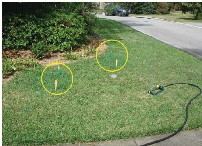
Figure 2. Irrigation is applied to the turf after dye was applied to two areas (each 3 sq ft) marked by the stakes. Notice that a container is catching the irrigation water to measure the amount of irrigation applied.

The following photos illustrate the main steps in conducting a dye test (Figure 2–Figure 5). These photos are from a dye demonstration conducted in Gainesville, Florida.