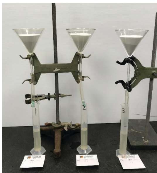
Figure 3. Laboratory experimental setup for measuring maximum water holding capacity.

Results indicated that there was a steady increase in WHC with every 1% increase in OM content for both sandy soils and limerock (Figure 4). Based on our study, every 1% increase of OM equates to a 2.3% and a 1.3% increase in soil WHC for sand and limerock, respectively. This would equate to an average of 10 gallons of water stored per acre-foot on sandy soils and 9.1 gallons of water stored per acre-foot of limerock if OM content were to be increased by 1%.