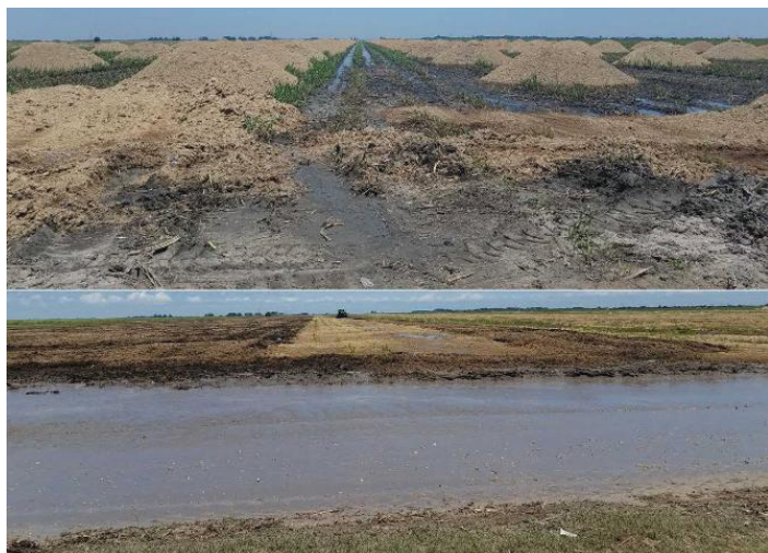
Figure 2. Bagasse being applied as organic soil amendment on sandy soils in south Florida.

converted into biofuels and other products. Utilizing locally derived crop residues such as bagasse (Figure 2), rice hulls, and palm fronds as soil amendments on sandy soils can potentially increase soil OM. Leaving this residue on the soil to naturally break down provides additional carbon to feed the soil. Gould (2015) showed that the application of compost increased water holding capacity of droughty soils.