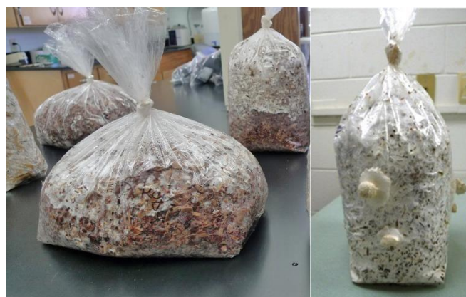
Figure 6. Around 3 weeks after incubating the bags in the dark, the fruiting stage starts.

Step 8. Fruiting—Mushroom Production. Initiation of the fruiting phase of many oyster mushrooms requires a lower temperature of 20°C (68°F) and light. The completely colonized straw bags can be triggered into fruiting by transfer to a fruiting chamber. This chamber has ambient environment of about 20°C (68°F), controlled (if possible) by an air-conditioning system, 90% humidity controlled by humidifiers or foggers, and a cold source of illumination such as inflorescence or energy-saving light for periods similar to day and night interval (or it could be continuous for the whole fruiting period). In cases where the biomass buildup chamber is going to be used as fruit phase, then the ambient environment condition can be adjusted for that chamber keeping the colonized bag logs in place. Also, there should be good air exchange to avoid carbon dioxide buildup, yet it should not adversely affect or prevent maintaining high humidity (90%) around the bags. An example of a fruiting chamber made using a laundry hamper is shown in Figure 7. Mushroom primordial