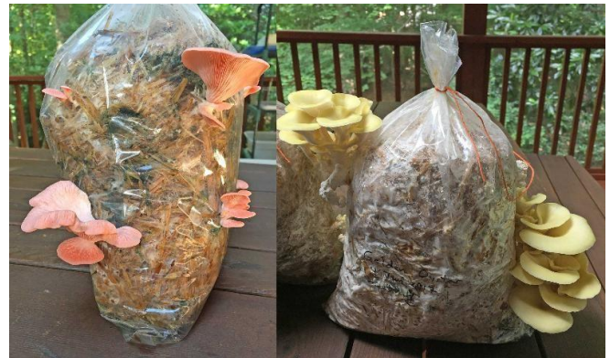
Figure 1. Two colorful oyster mushroom species, Pleurotus djamor and P. cornucopiae .