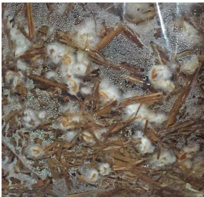
Figure 4. Oyster mushroom mycelium growing out from the spawn and colonizing the straw.

Step 7. Spawn Run, continued. Observe the fungal growth (spawn run) colonizing the straw substrate for the next two to three weeks until the whole bag becomes white indicating good fungal biomass production. The bags are then ready for fruiting, which is triggered by light and lower temperatures (Figures 5 and 6).