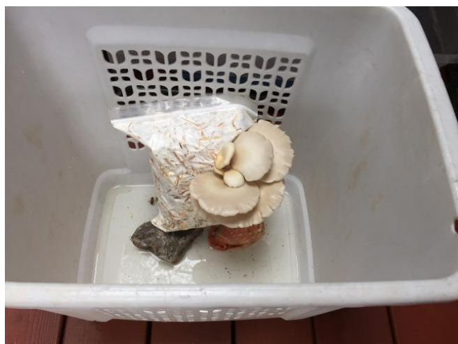
Figure 7. A fruiting chamber set up using a laundry hamper.

appear at the holes made in the plastic bags and develop into the "pinhead" stage. The pinheads expand into the first flush of oyster mushrooms if proper air exchange and humidity are maintained (Figure 8). Clusters of the developed mushroom are harvested by twisting and gently pulling or by cutting flush with the substrate with a knife. After this first flush of mushrooms, there should be 2–4 more flushes depending on the fungal strain and the ambient environment.