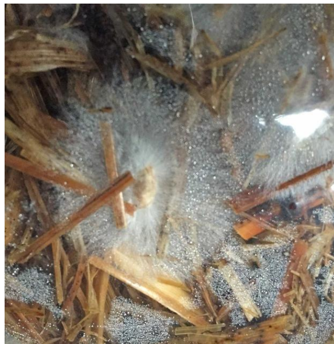
Figure 5. 18 days after incubating the bags in the dark.

Step 7. Spawn Run, continued. Observe the fungal growth (spawn run) colonizing the straw substrate for the next two to three weeks until the whole bag becomes white indicating good fungal biomass production. The bags are then ready for fruiting, which is triggered by light and lower temperatures (Figures 5 and 6).