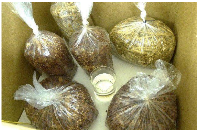
Figure 3. Incubate the filled bags in a clean, dark place (e.g. a cardboard box) at 24–25°C and high humidity (80–90%).