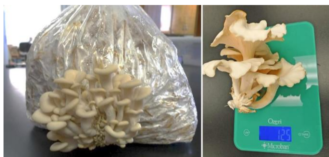
Figure 8. 25 days after incubating the logs. Oyster mushrooms grow on the bag in shelf-like clusters. The caps are rolled into a convex shape when young (left) and will flatten out as the mushroom ages (right).