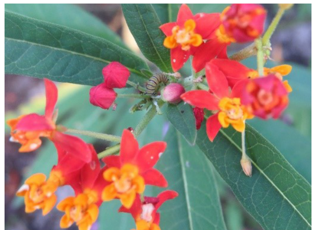
Figure 3. Milkweed.

If turf cannot be planted or is not desirable, herbaceous plants, such as fountain grass, iris, Agapanthus, milkweed (Figure 3), aster, plumbago, and pink Muhly grass, are great options to plant on or around the drain field. Planting the right plant in the right place is critical to not only the function of a septic system but also the longevity of the plant itself. Do not plant sun-loving plants in shady spots and vice versa. A wet drain field can be a sign of septic system failure, so plants suffering symptoms caused by having too much water may signal that a septic system inspection is due.