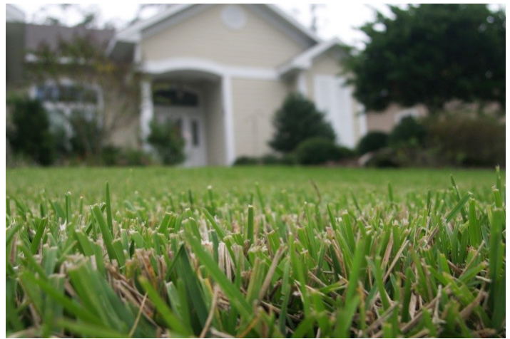
Figure 2. St. Augustinegrass Lawn.

Turfgrasses are the most common and easiest to establish and maintain around septic systems. They have relatively shallow and fibrous roots. In comparison to other types of plants, turfgrasses tend to be less expensive and can require lower maintenance as long as the right type of grass is chosen for the location. Turfgrass growing over the drainfield should not be fertilized. Wildflower mixes (those native to the state, suited for the site conditions, and produced within the same climate) used in conjunction with turfgrasses can provide a beautiful area with little to no maintenance, but stay away from planting any sort of large or tall grass species, because these can have expansive root systems. Bamboo species, pampas grass, and similar should not be planted due to their deep, expansive roots. St. Augustinegrass (Figure 2), bahia, zoysia and bermudagrass are all acceptable over drain fields.