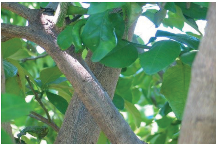
Figure 10. A poorly positioned branch “crossing over” or growing back into the canopy and over the center of the tree instead of radiating outwards. Such branches must be removed by cutting at the branch collar at their base.