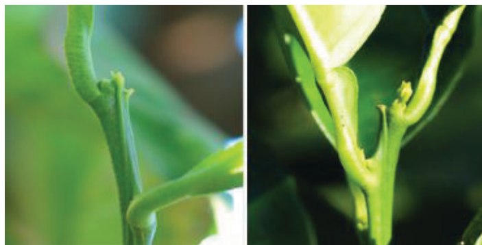
Figure 6. Ideal stage for pruning of bearing citrus trees: at or just after budbreak. This is not always possible in late-harvested varieties and where late freezes may be expected. The rule is: Prune as soon after harvest as possible.

2. Tree containment: Keep canopies within their allocated space by reducing tree height and spread and by skirting. Height reduction is particularly important in CUPS, where tree canopies should never contact the screen house roof. This is to protect the roof, and because pest management on branches close to the roof becomes more difficult. These practices are usually done annually, as soon after harvest as possible, and make it easier for pruners to access tree canopies and concentrate on optimizing tree canopy form and function by using selective pruning.