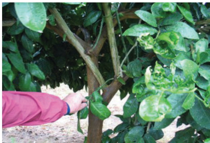
Figure 9. Two poorly positioned branches with green bark being pointed out. The one on the left is growing back toward the center of the tree and rubbing against other, better-positioned scaffold branches in the canopy above. The right-hand branch is growing up the center of the canopy and is shading and dominating the canopy beneath. It is the tallest branch on the tree shown. Both of these branches are also excessively vigorous. Both should be removed by cutting at their bases to intersect the so-called “branch collar.” This speeds wound healing.