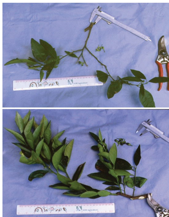
Figure 11. Top: Weak bearing branch units (WBBU) arising from the underside of a branch from a ‘Bellamy’ navel orange tree. These should be removed by cuts made to the undersides of their supporting branches. The supporting branch is indicated by the jaws of the Vernier caliper. Bottom: An example of strong bearing branch units (SBBU) arising from the top of the supporting branch in ‘Bellamy’ navel orange. Note the relatively large fruitlet diameter compared with those from WBBU in Figure 11, top. The supporting branch, trimmed for clarity, is indicated by the pruning shear blades.

operations transform and maintain favorable tree structure and productivity and lay the foundation for sustained heavy crops of high-quality fruit. Practical experiences suggest pruners should spend no more than 5 to 6 minutes per tree, per year, and that repeated light and selective pruning significantly improves tree productivity.