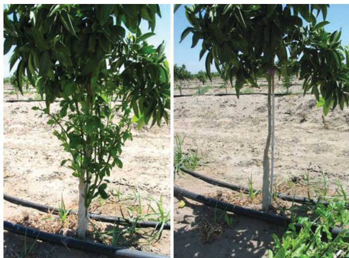
Figure 1. Removal of sucker shoots from rootstock, bud union, and tree trunk, before (left) and after (right). These suckers compete with the tree canopy above for water and nutrients. Remove these as soon as they arise in both nonbearing and bearing trees through the life of the grove.

Decide on the standard height above soil level of the lowest limb that will be allowed to develop on the trees. This is usually 45 to 65 cm (ca. 18 to 26 inches) above soil level. Keep the rootstock, bud union, and trunk clear of all growth below this point by carefully rubbing off new shoots by hand or using pruning shears (secateurs) to cut older branches (Figure 1). Failure to do so usually results in dominant, out-of-place branches (Figure 2) that shade more favorably placed branches and compete with them for sap flow and nutrients, or branches so low that they or their fruit touch the soil surface.