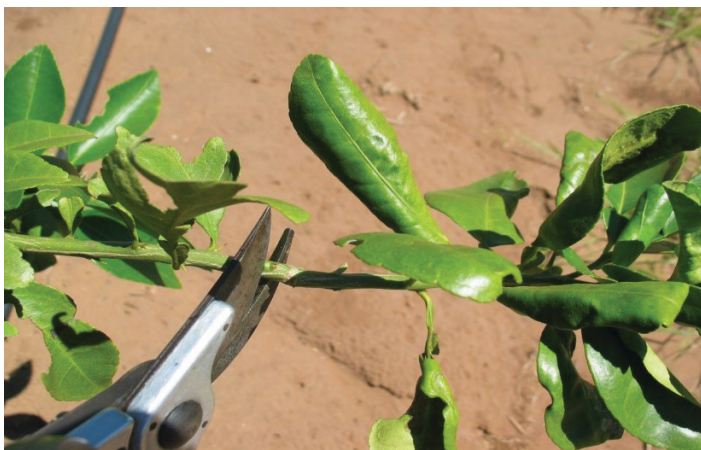
Figure 8. Shortening a long horizontal branch by cutting below the junction or intercalation between successive growth flushes, here located a centimeter or so to the right of the blades. This results in spaced lateral regrowth shoots on a shorter branch that does not touch the ground.