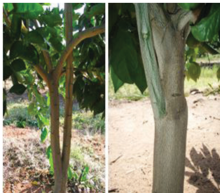
Figure 2. Poorly positioned main branches arising at the bud union and below the level of the tree's main branches allowed to develop on a low-budded tree (left) and high-budded tree (right). Both cases result in mechanically weak branches that are prone to breakage when laden or during storms. They also shade, dominate, and compete with well-placed branches in the canopy and should already have been removed long before they reached this size.