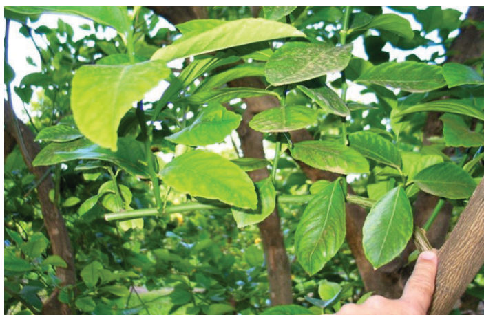
Figure 13. The bent watershoot may later be shortened with secateurs (usually in early fall) to leave behind a strong, short branch, bearing well-spaced lateral shoots that mature to form SBBU, which usually produce large, high-quality, easily harvested fruit.

General considerations: Canopy management is one of a number of cultural practices forming the basis of best management practices in groves; fertigation, pest and disease management, fruit size management or thinning, grove sanitation, and harvest are others. Citrus growers are best able to assess the performance of their trees and to plan and implement their canopy management activities accordingly. Consider the following: