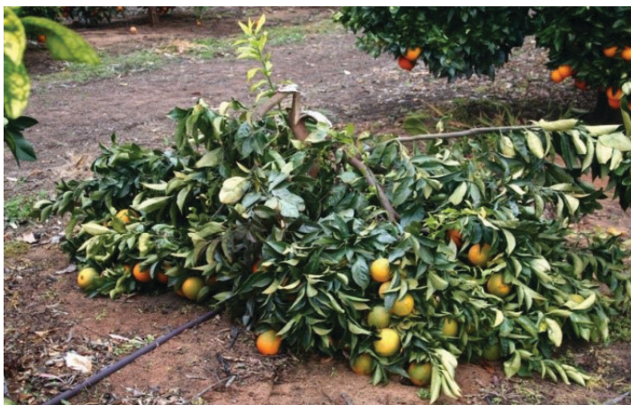
Figure 3. Branch breakage under fruit load: the result of leaving young trees untrained, leading to poor scaffold branch placement and mechanically weak trees.

infestations can weaken branches, and already stressed branches may be more susceptible to heavy infestations.