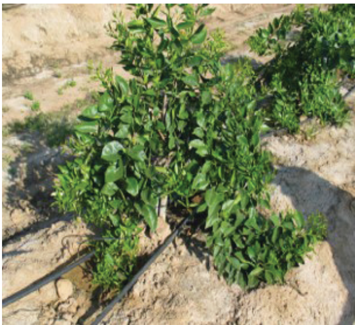
Figure 7. Trees should be skirted at a suitable height above ground level (for example, 45 cm above soil level) to keep foliage and fruit off the ground and above the level of soil “splash,” and to facilitate under-tree operations such as fertigation, grove sanitation, and weed management.

a convenient side-branch to redirect the growth. A skirting height of 45 to 65 cm (18 to 26 inches) is suggested, carried out to keep branches and fruit clear of the soil, perhaps every second year.