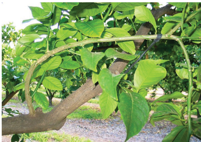
Figure 12. Bending a vigorous watershoot to induce lateral branching. A previously upright, vigorous lemon branch has been drawn down with a degradable natural rubber tree-training band, which within months weathers and breaks down in place, does not damage the branch it encircles, and leaves the branch permanently bent over.

leaving in place a new, strong scaffold branch that bears large fruit (Figure 13).