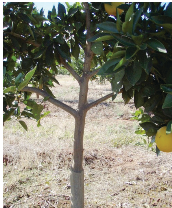
Figure 5. Aim to maintain tree structural “balance,” comprising those well-spaced, mechanically strong, correctly oriented scaffold branches that were chosen when nonbearing trees were trained. This permanent structure, or something similar, is the foundation for a productive lifespan of the grove.