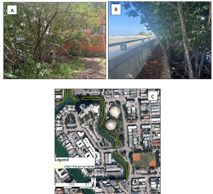
Figure 2. Images of urban mangroves in Miami-Dade County, FL: (A) mixed red, black, and white mangrove stand next to a housing complex, (B) red mangroves next to a major road, and (C) an aerial image of urban mangroves located near Normandy Isles in Miami Beach, FL.

In addition to urban stormwater, surrounding urban features, such as population density and percent urban infrastructure (e.g., roads and buildings), may affect the size (i.e., hectares) of a mangrove patch. Mangroves have historically been removed in Florida to make way for coastal urban development, which fragments, or minimizes, mangrove forest area (US Fish and Wildlife Service 1999). There is also limited space for mangroves to expand along the coasts of cities because of concrete structures. On the seaward side, sea level continues to rise, which forces mangroves to migrate landward. However, urban development serves as a barrier that prevents mangroves from moving inland. The combination of urban development on one side and sea-level rise on the other results in a “coastal squeeze,” further minimizing space for mangrove growth. For these reasons, most urban mangroves may be small patches, as opposed to the large forests that are typically found in conserved areas, such as the Everglades National Park.