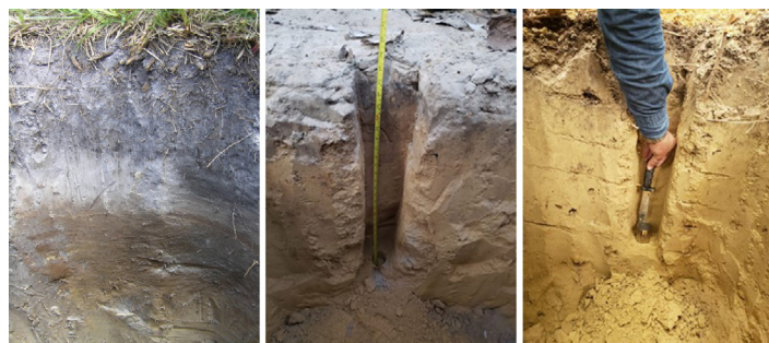
Figure 2. Deep soil carbon evaluation.

zone (Figure 2), which often extends beyond the minimum of 12 inches recommended by the Intergovernmental Panel on Climate Change (IPCC) or the typical 6 inches for soil fertility purposes. The extensive labor requirement for sampling and analysis cost should be considered in the design of carbon credit programs if measured verification is required.