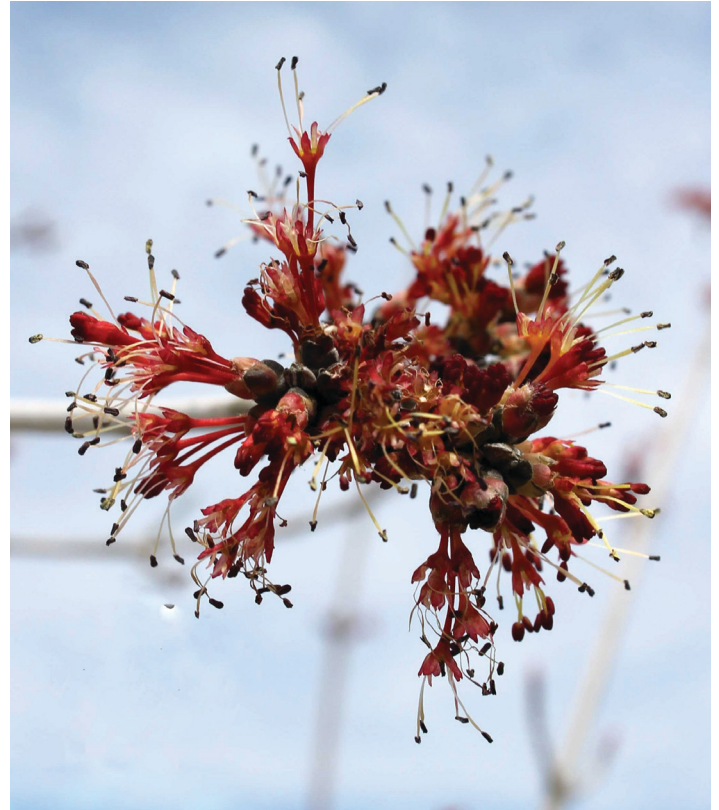
Figure 4. Flower - Acer rubrum : red maple

Flowering: late winter to early spring, before new leaves emerge