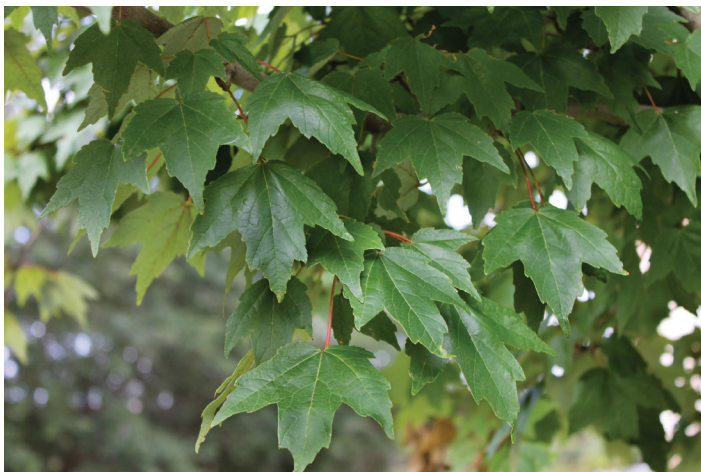
Figure 3. Leaf - Acer rubrum : red maple