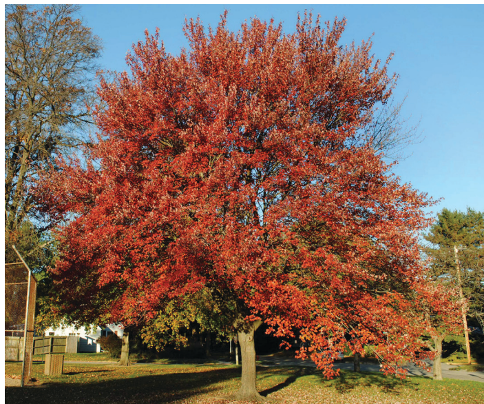
Figure 1. Full Form - Acer rubrum : red maple

UF/IFAS Invasive Assessment Status: native