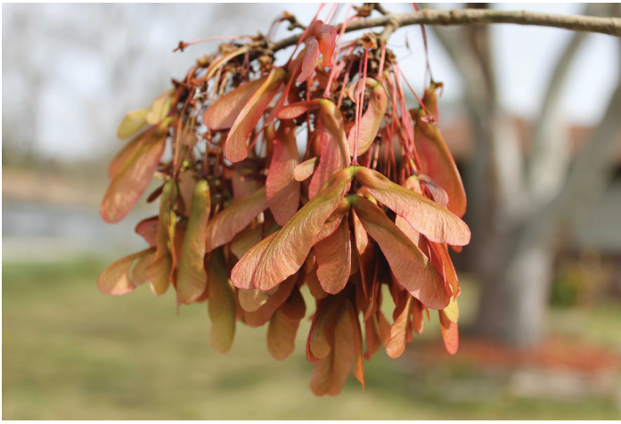
Figure 5. Fruit - Acer rubrum : red maple