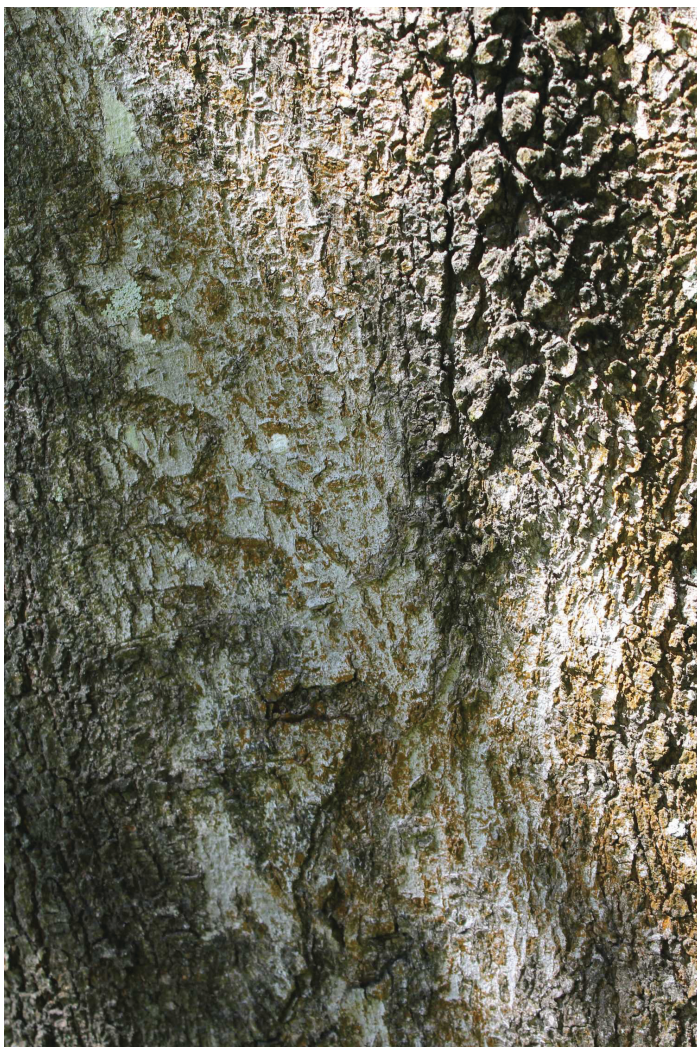
Figure 6. Bark - Acer rubrum : red maple

Red maple is easily transplanted and usually develops surface roots in soil ranging from well-drained sand to clay. It is not especially drought-tolerant, particularly in the southern part of the range, but selected individual trees can be found growing on dry sites. This trait shows the wide range of genetic diversity in the species. Branches often grow upright through the crown, forming poor attachments to the trunk. These should be removed in the nursery or after planting in the landscape to help prevent branch failure in older trees during storms. Select branches with a wide angle from the trunk and prevent branches from growing larger than half the diameter of the trunk.