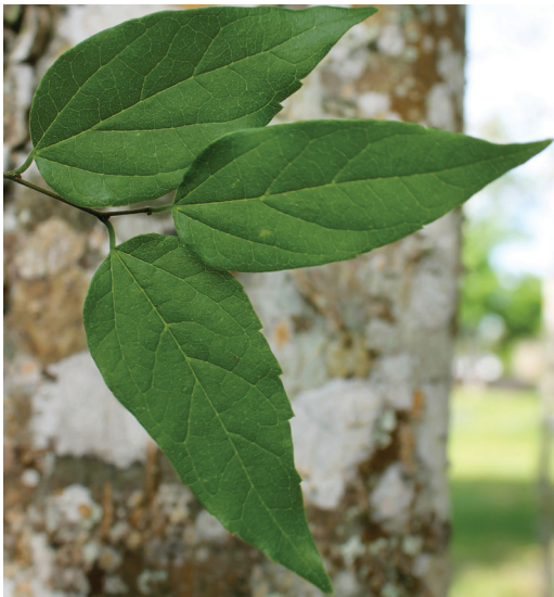
Figure 3. Leaf— Celtis laevigata : Sugarberry