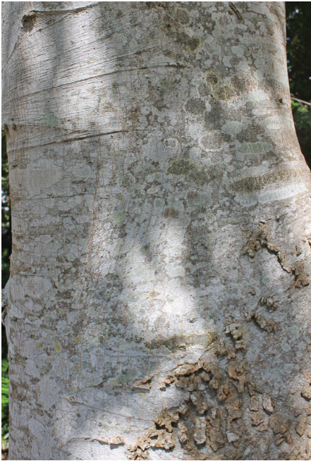
Figure 5. Bark— Celtis laevigata : Sugarberry