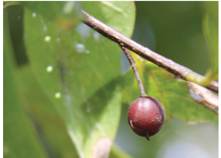
Figure 4. Fruit— Celtis laevigata : Sugarberry