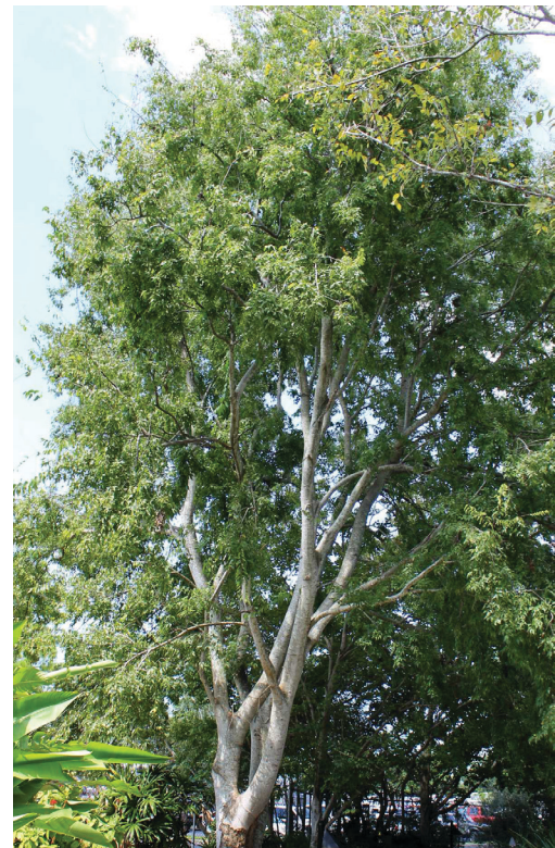
Figure 1. Full Form— Celtis laevigata : Sugarberry

Uses: parking lot island > 200 sq ft; tree lawn > 6 ft wide; shade; street without sidewalk; reclamation; highway median; Bonsai