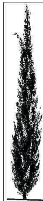
Figure 1. Middle-aged Cupressus sempervirens 'Glauca': 'Glauca' Italian cypress.