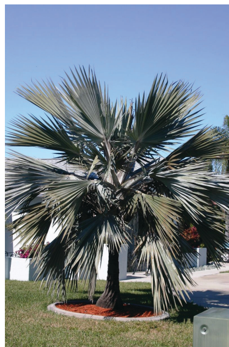
Figure 1. Young Latania loddigesii : Blue latan palm.

Uses: deck or patio; specimen; container or planter; highway median