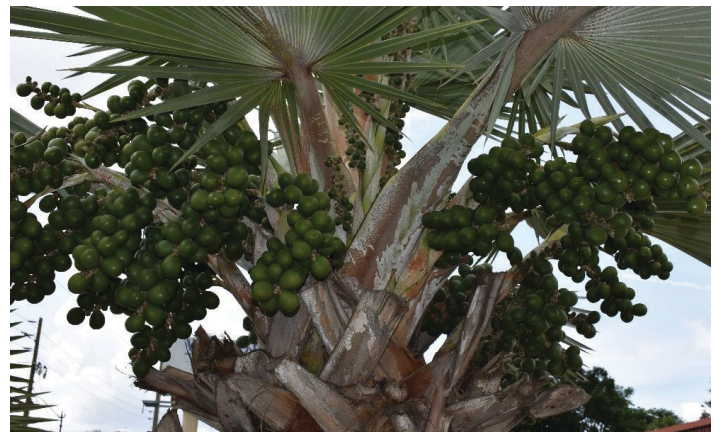
Figure 5. Fruit of Latania loddigesii : Blue Latan Palm