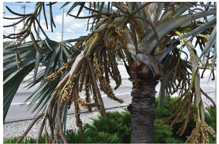
Figure 4. Female flower of Latania loddigesii : Blue Latan Palm

Flower color: yellow, white/cream/gray (Figure 4)