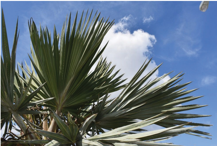
Figure 3. Foliage of Latania loddigesii : Blue Latan Palm