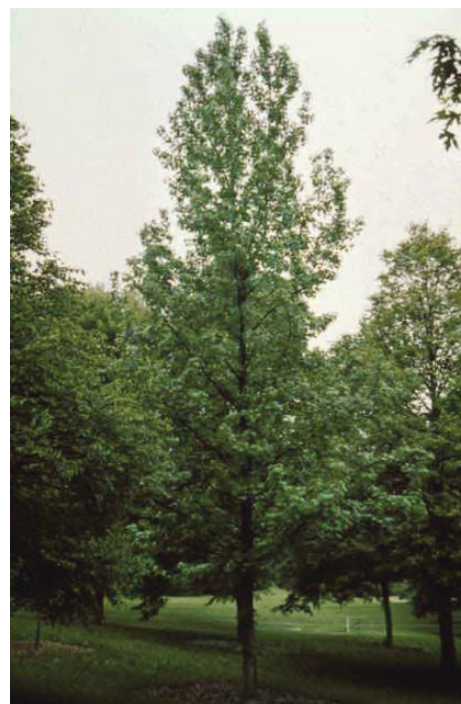
Figure 1. Young Liquidambar styraciflua 'Moraine': 'Moraine' sweetgum.

USDA hardiness zones: 5A through 8B (Figure 2)