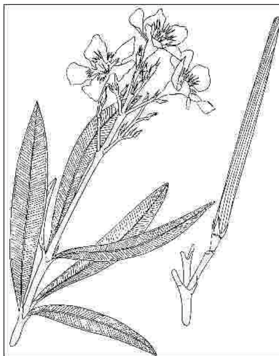
Figure 3. Flower