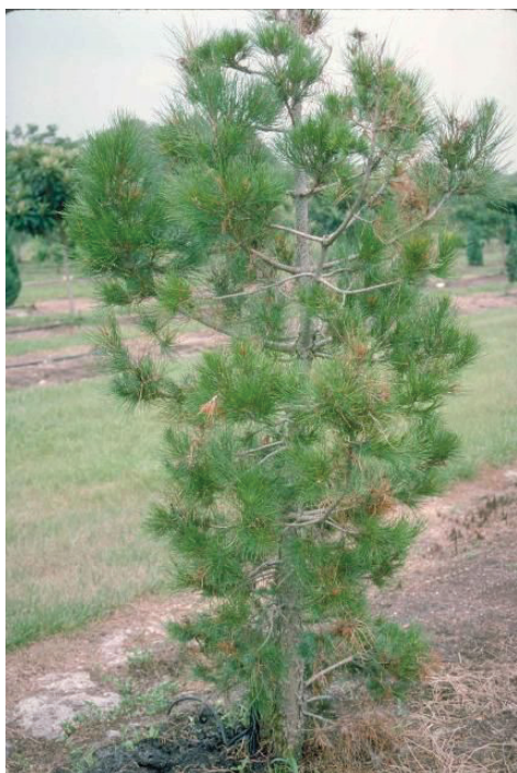
Figure 1. Young Pinus brutia var. eldarica : Mondell pine.

Growing rapidly when young, Mondell pine reaches heights of 30 to 40 feet and is quite dense. This tree stands out among the pines due to the upright growth habit that stays with the tree throughout its life. The paired, medium green needles are five- to 6.5-inches long and joined by three-inch-long cones. The tree is most often grown in parts of Texas.