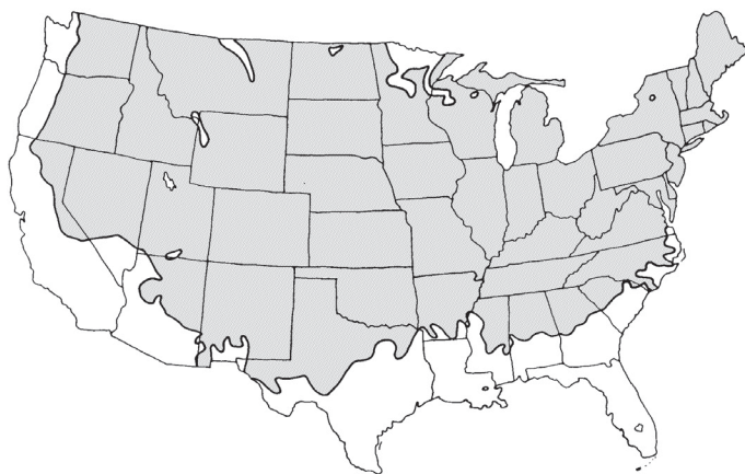
Figure 2. Range