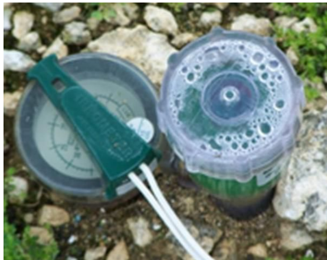
Figure 4. Tensiometer installed in very gravelly loam soil.

Different plants have different responses to ranges of soil water tension. However, the following guidelines can be used to interpret tensiometer readings for irrigation scheduling in gravelly or sandy soils.