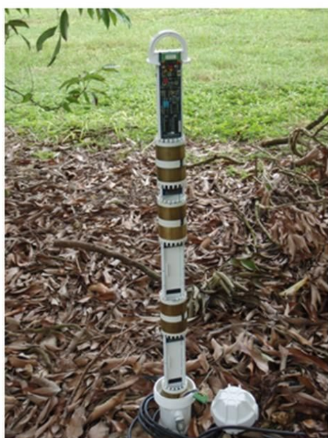
Figure 5. Multi-sensor capacitance probe being inserted into a field.

these probes for site-specific applications. Extension specialists can help with the selection of an appropriate capacitance probe. These instruments take advantage of the fact that the dielectric constant of pure water is 80, the dielectric constant of air is 1, and the dielectric constant of dry soil is in the range of 4–6. The dielectric constant describes the ability of a substance to hold an electrical charge. Therefore, soils that contain greater volumetric water contents will have a greater dielectric constant, which can be measured electronically using capacitance probes. The probe measures the electrical capacitance of the surrounding soil-air-water mixture and converts this reading into the percentage of water in the soil. Capacitance probes may consist of one sensor or multiple sensors. Figures 5 and 6 show an example of a multi-sensor (i.e., at different depths along the soil profile) capacitance probe.