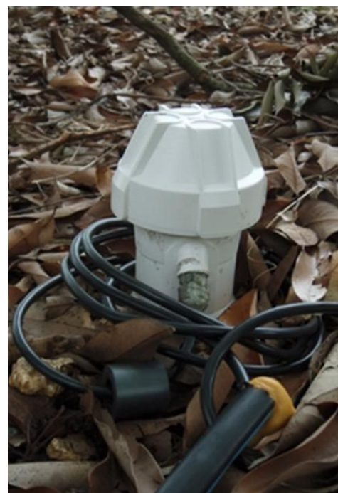
Figure 6. Multi-sensor capacitance probe installed in a south Florida grove.