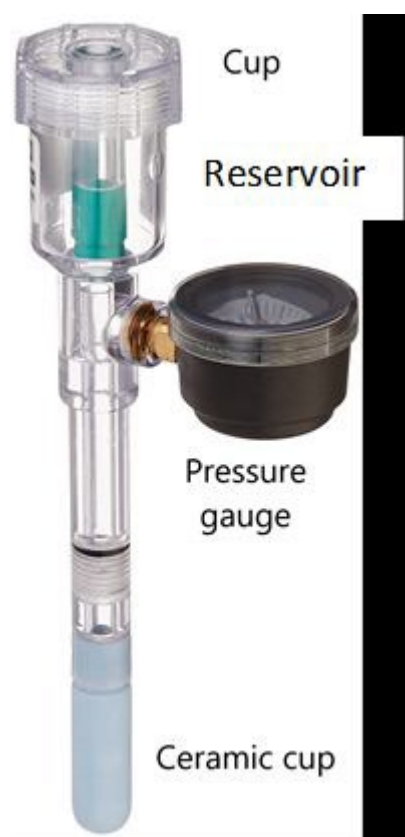
Figure 3. Tensiometer before installation in the field.

This device directly measures soil water potential or tension (Figure 3). Tensiometers must be properly installed within the root zone and require continuous maintenance to be effective (Figure 4). Readings from tensiometers are displayed in pressure units (tension) such as cbars (1 cbar = 0.01 bar; 1 bar = 14.5 psi). The tension at which water is held in the soil indicates the amount of energy plants need to overcome to access the water.