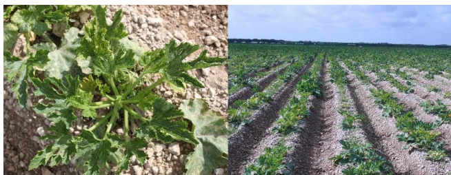
Figure 5. Symptoms of Tobacco streak virus (TSV), on zucchini squash (left), and a severely infected field of squash in Homestead, FL (right).