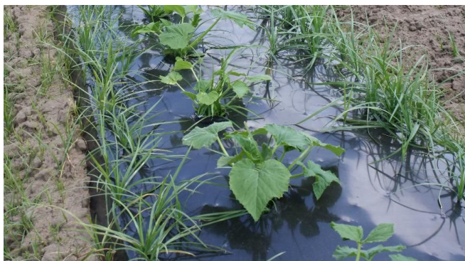
Figure 11. Purple nutsedge emergence through plastic mulch in squash.