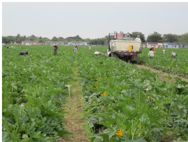
Figure 12. Overview of a zucchini production in calcareous soils in Miami-Dade County.

The harvest season extends from October into April. Squash is hand-picked.