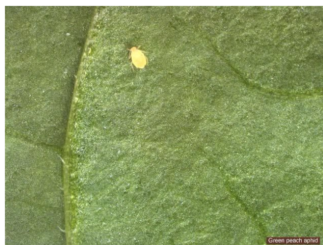
Figure 9. Green peach aphid.

Green peach aphid and melon aphid are polyphagous pests feeding on 40 plant families over a wide geographical range. They occur all over North America, attacking plants grown in the field and in greenhouses. In field studies, maximum aphid populations can be observed at peak plant canopy. They occur more often on the lower leaves of a mature plant than on the top leaves. Viviparous or live young production predominates in south Florida; oviparous or egg production is rare. Aphids at a high population level smother young foliage, resulting in wilting and reduced growth rate. These and other aphid species transmit viruses such as Papaya ringspot virus type W and Zucchini yellow mosaic virus, which are discussed above in the disease management section. Aphid species that do not actually colonize squash can bring the virus into the field (primary spread) or spread it within the field (secondary spread) simply by probing the plant. The incidence of virus infection may be low at the beginning but spread rapidly due to handling during harvest, which disturbs the aphids causing them to move. In a severe case, up to 90% of squash plants can be infected with the virus.