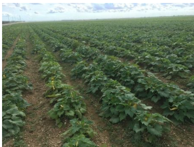
Figure 1. Overview of a yellow squash field in calcareous gravelly soils of Miami-Dade County.

Summer squash is an important vegetable crop in Miami-Dade County (Figure 1). Summer squash is grown annually on about 6,000 acres and sold nationwide during the winter in the fresh market. Production costs range from $14.51 to $11.47 per bushel or $4,353 to $5,162/acre for an acceptable yield of 300 to 450 ($9.67 to 17.20/bushel), 42-pound bushels/acre, respectively.