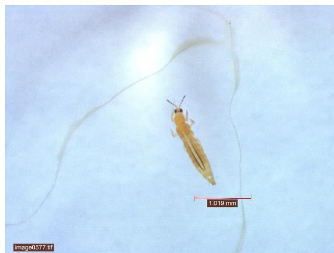
Figure 8. Melon thrips adult.

Melon thrips arrived in Miami-Dade County in 1990 and caused defoliation of squash, cucumber, beans, pepper, eggplants, and okra. Later, it spread to Broward, Palm Beach, and Collier Counties. Melon thrips occur in all seasons when a proper host crop is available. However, peak abundance of melon thrips is usually observed from December to May. Larvae and adults on the undersurface of the leaves feed on the epidermal layer. Adults of melon thrips and other species can also be found in blooms. Melon thrips developed resistance to various groups of chemical insecticides. Management of melon thrips is based on cultural practices meant to increase predatory bugs (minute pirate bugs, lady beetles, lace wing bugs) and proper use of effective chemicals, such as spinetoram (Radiant), cyazypyr (Exirel), and abamectin (Agrimek).