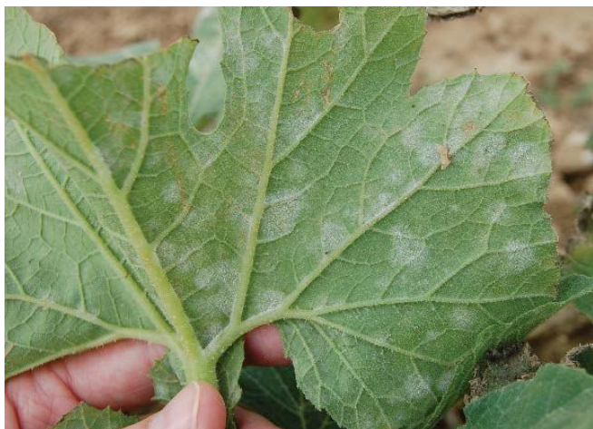
Figure 4. Powdery mildew on the lower surface of squash leaves.