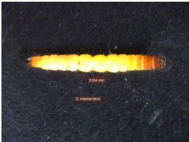
Figure 10. Conoderus scissus wireworm larva.

Wireworms are the larvae of click beetles. They are soil pests that feed on plant roots and other underground parts of a plant. Wireworms attack squash seeds at germination phase to feed on seed contents. Sweet potato and Irish potatoes are preferred hosts of wireworm. Conoderus amplicollis (Gulf wireworm) prefer sweet corn fields. C. scissus prefers peanuts. C. rudis prefers germinated seeds of all vegetable crops. Melanotus communis Gyllenhal (corn wireworm) prefers corn and sugarcane. They can cause significant economic loss to the host crops in the absence of proper cultural control.