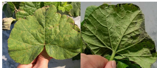
Figure 3. Symptoms of downy mildew on upper side (left) and underside (right) of butternut squash leaves. Note the gray-brown to purplish-black 'down' on the underside of the infected leaves.

Downy mildew favors wet conditions. Optimal conditions for disease development include temperatures of 55°F to 75°F at night and relative humidity greater than 90%. In south Florida, the presence of downy mildew is lower for winter plantings than fall and spring plantings, due to the dry winter season.