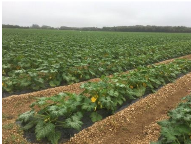
Figure 2. Yellow squash grown on plastic mulch in Miami-Dade County.

Irrigation is applied to squash using sprinkler systems such as lateral move/center pivot or big guns. Some growers are using plastic mulch to save irrigation water and suppress weeds (Figure 2). Principles and practices of irrigation management are discussed in Chapter 3 of the Vegetable Production Handbook for Florida https://edis.ifas.ufl.edu/collections/vph .