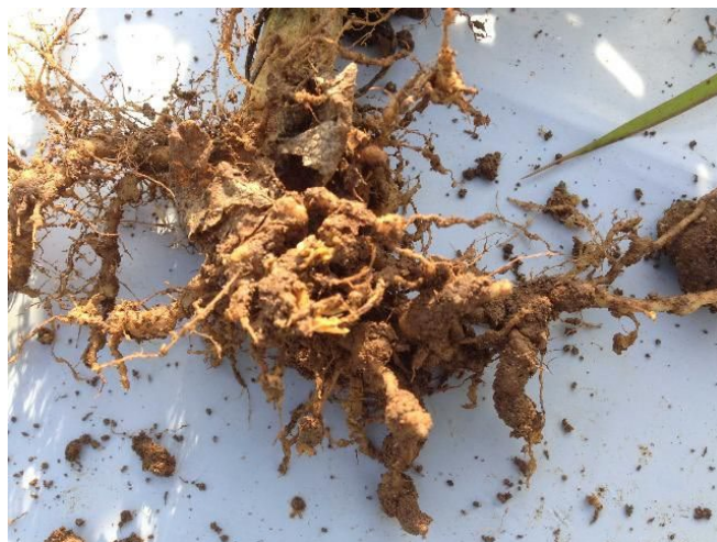
Figure 6. Squash roots showing galls of root-knot nematodes.

It is difficult to control root-knot nematodes by crop rotation of their wide host range of more than 2000 plant species. The use of soil fumigants to increase quality and yield of squash is always warranted because cucurbits are high cash value crops. Wherever available, resistant varieties should be planted because plant resistance is the most economical and environmentally safe measure for management of root-knot nematodes.