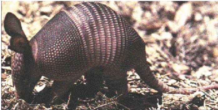
Figure 1. The nine-banded armadillo.

Armadillos are prehistoric-looking animals that belong to a family of mammals found primarily in Central and South America. The earliest fossil ancestor of our North American armadillo occurred about 60 million years ago; it was as large as a rhinoceros. Our present-day nine-banded or long-nosed armadillo, Dasypos novemcinctus , is much smaller; adults normally weigh from 8–17 pounds (3.5–8 kilograms) (Figure 1). This species occurs in Texas and east, throughout the South. It occasionally is found in Missouri and South Carolina. However, cold weather limits the northern boundary of the armadillo’s range.