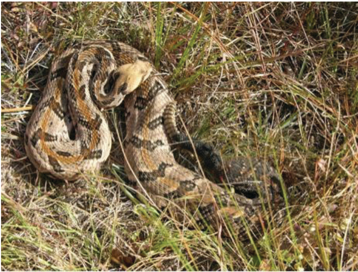
Figure 10. Timber rattlesnake.