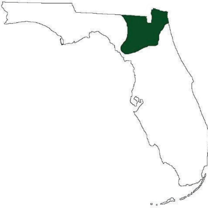
Figure 9. Florida distribution of the timber rattlesnake: only northern Florida.

Credits: Esther Langan, University of Florida