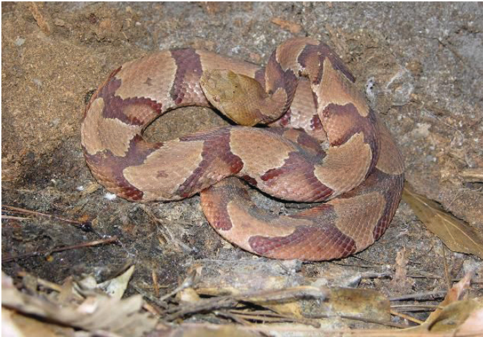
Figure 6. Copperhead.

Copperheads prefer to remain near streams and wet areas but may be found away from such places. A full-grown copperhead is usually less than three feet long. Copperheads are relatively thick-bodied with bold markings (Figure 6). The general body color of these snakes is light brown to gray, and there are large bands of darker brown along their backs. Because of constrictions in the darker bands along the center of the back of this species, the darker bands have an hourglass shape. The alternating pattern of lighter and darker bands provides copperheads with exceptional camouflage in the forested areas where they live. Young copperheads look very similar to adults except the tips of their tails are yellowish in color.