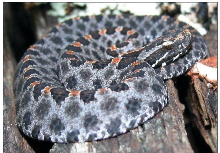
Figure 12. Pygmy rattlesnake.

This is one of the most commonly encountered venomous snakes that occasionally is found in residential neighborhoods. Pygmy rattlesnakes have a dark facial band that runs from each eye to the rear of the jaw (Figure 12). Their bodies are covered with numerous dark blotches with a row of darker blotches running down the middle of the snake's back. Usually a series of reddish-brown marks can be seen between the blotches on the back.