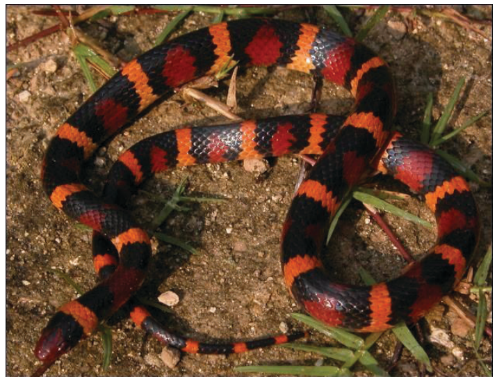
Figure 15. Scarlet kingsnake (non-venomous).