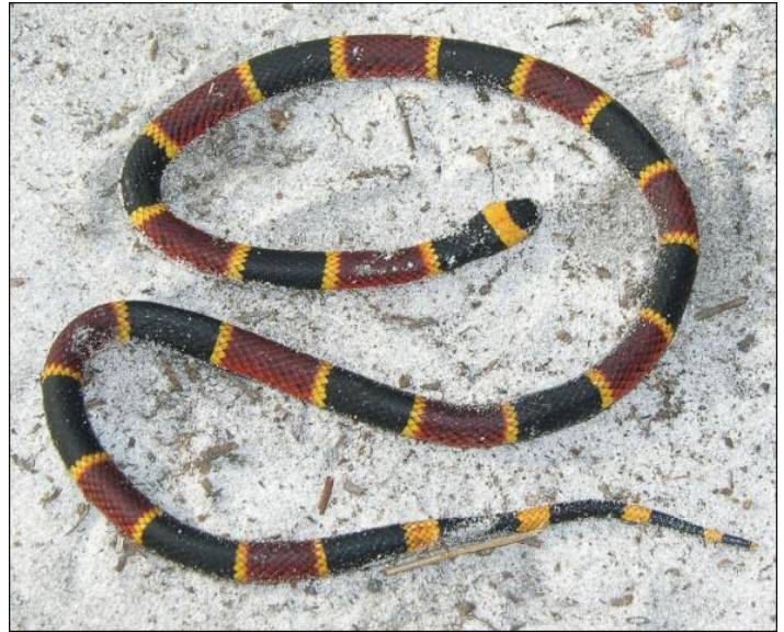
Figure 14. Coral snake (venomous).

black snout, which is followed by a band of yellow on the head. Neither the scarlet kingsnake nor the scarlet snake have black snouts, their snouts are more pointed and red.