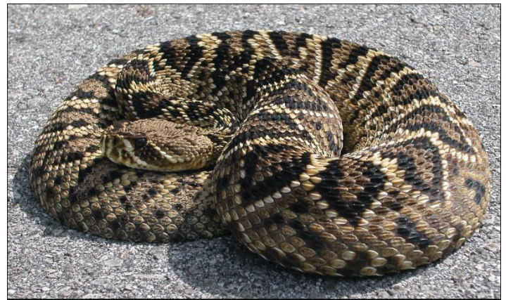
Figure 8. Eastern diamondback rattlesnake.