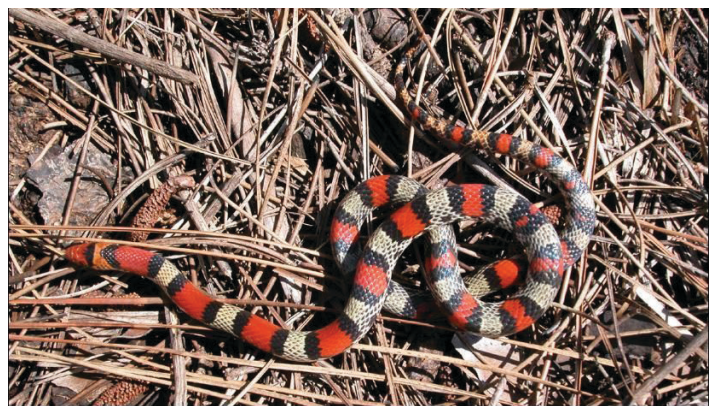
Figure 16. Scarlet snake (non-venomous).