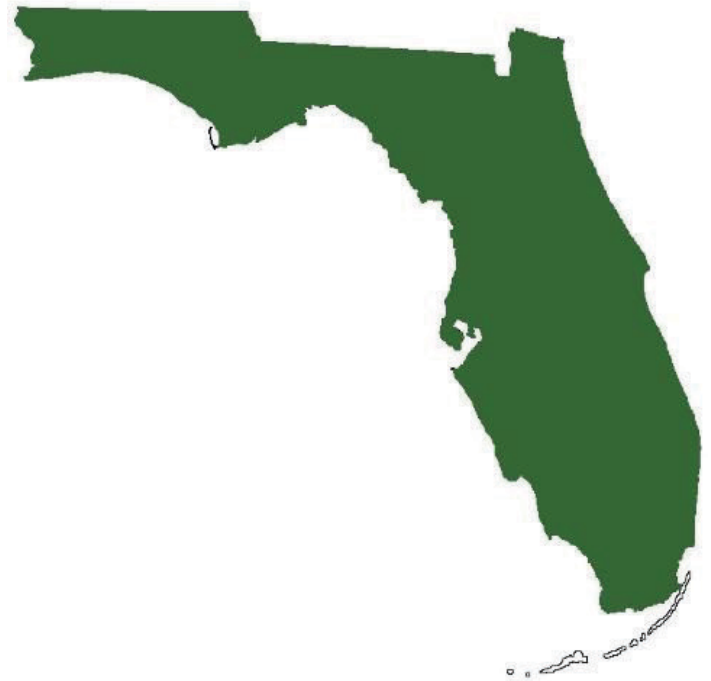
Figure 11. Florida distribution of the pygmy rattlesnake: entire state except for the Keys.

in many different habitats that include pine flatwoods, oak scrub, open pinelands, and palm hammocks (Figure 11).