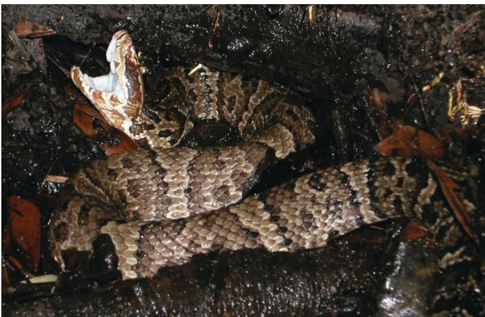
Figure 3. Adult cottonmouth exhibiting mouth-gaping behavior.

As a defensive response when threatened, cottonmouths often open their mouths wide, revealing the cotton-white interior (Figure 3). Young cottonmouths (Figure 4) are brightly colored with reddish-brown crossbands and a yellow-colored tail. When young they look very similar to the copperhead and are sometimes confused as such. Be sure to check range maps!