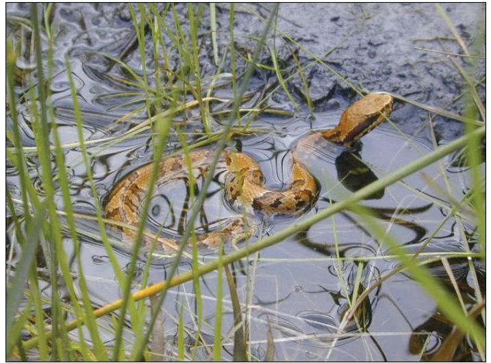
Figure 4. Juvenile cottonmouth.

Several species of harmless water snakes are often mistaken as cottonmouths. Water snakes are not venomous, but they tend to be aggressive and quick to bite. To avoid confusion and the potential for being bitten, it is best to leave all water snakes alone.