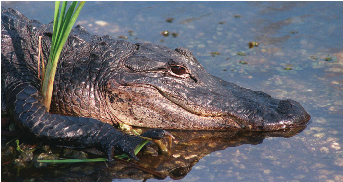
Figure 1. An American Alligator

Living in Florida, we have to share our space with a very large reptile, the American alligator ( Alligator mississippiensis ). Because of Florida's booming population growth, people and alligators are constantly forced to cross paths, increasing the chances of conflict. Knowing where alligators live, how they behave and what you can do to avoid conflict with alligators is key to sharing space safely (Figure 1).