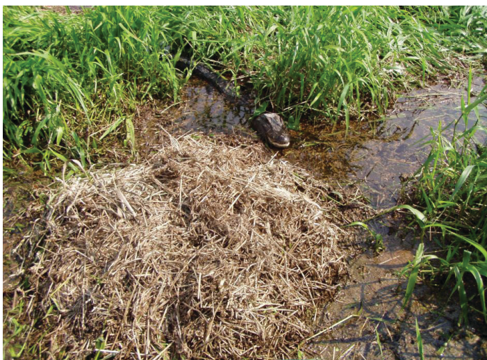
Figure 3. An American alligator nest (the mound of dried grass). See the mother alligator guarding the nest? (She's at the upper right side of the nest.)

Once incubation is complete and the hatchlings are ready (Figure 4) to emerge from their eggs, they emit a “yerp” sound. A few hatchlings yerp stimulates the other hatchlings in the clutch to yerp. This signals the female that the eggs are about to hatch, and she carefully opens the nest. The hatchlings tear through their leathery egg with an egg tooth on the tip of their snout, which falls off after a few days. The mother alligator can also help the hatchlings emerge by rolling eggs between her tongue and palate. This helps to assure that all the eggs hatch at the same time.