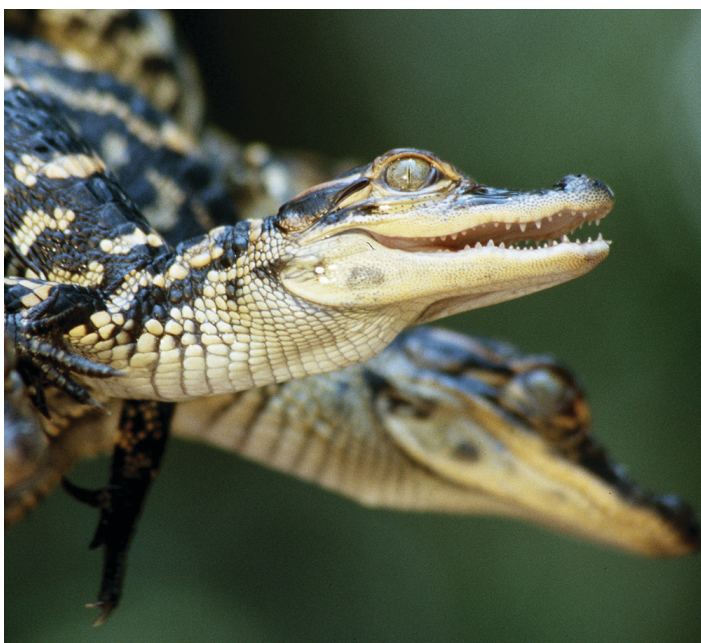
Figure 4. American alligator hatchlings (babies). The yellow striping is temporary camouflage for blending in with marsh grasses and rays of sunlight slanting through the grasses. Hatchlings emerge from their eggs in August and September in Florida and often stay near the nest site for a couple of years. Hatchlings are usually 6-8 inches long.

Once incubation is complete and the hatchlings are ready (Figure 4) to emerge from their eggs, they emit a “yerp” sound. A few hatchlings yerp stimulates the other hatchlings in the clutch to yerp. This signals the female that the eggs are about to hatch, and she carefully opens the nest. The hatchlings tear through their leathery egg with an egg tooth on the tip of their snout, which falls off after a few days. The mother alligator can also help the hatchlings emerge by rolling eggs between her tongue and palate. This helps to assure that all the eggs hatch at the same time.