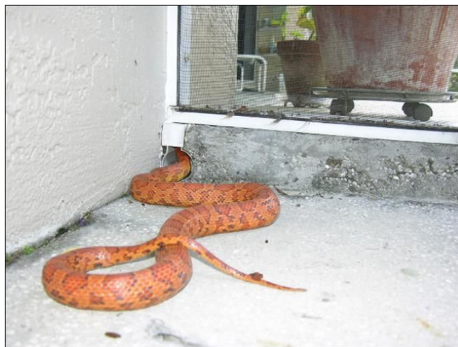
Figure 2. Uncovered holes, such as this patio pool drain are inviting hiding spots for snakes in search of a cool place to rest and can allow a snake access to your home.

porch, or open drain pipes from enclosed pools? Snakes may enter garages, basements, or attics in search of prey if rodents are present or may simply slip in through a drain pipe or crack under a door in search of a cool hiding spot (Figure 2).