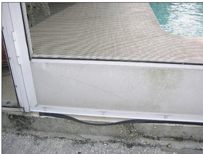
Figure 3. Door sweeps can prevent snakes from inadvertently slipping into the home under a door, butdoor butchecked periodically. This rubber door strip is in disrepair, leaving large gaps beneath the door.