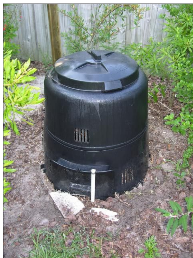
Figure 6. Mulch piles and compost bins can be inviting to rodents, which may attract snakes. Sturdy, sealed containers such as this can help to "rodent-proof" your yard. Note the PVC pipe used to hold the door securely in place.

Finally, you should attempt to "rodent proof" your home, so that rodents do not attract snakes into your home, garage, or shed. Ratsnakes, in particular, are often found in attics, garages, or sheds when rodents are present, but leave when rodents are exterminated. Outside the home, be sure to keep bird feeders some distance from the house and do not feed in late spring and summer, when birds have plenty of food sources, as you may be feeding rodents as well. Mulch bins, where people compost food scraps, may attract rodents, so be sure they are secure and that their contents are not accessible to mice and rats (Figure 6).