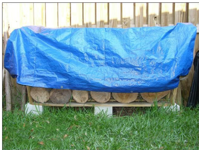
Figure 1. Firewood should be stacked neatly on a rack. Wood piles on the ground provide many hiding spots for snakes.

First, you should address your yard—do you have tall grass, overgrown shrubs or piles of brush, debris, or wood? If so, these may provide hiding spots for snakes, and tall grass can make it difficult to watch your step. Keep your grass mowed, and keep shrubs and tree branches trimmed away from the house. Do not mow to the edge of lakes or ponds, as this will destroy important habitat for frogs, turtles, and birds—rather, warn children to stay away from the water unless accompanied by an adult and keep pets away from these areas. Installing chain-link or privacy fence is an effective solution to keep pets and children away from wetland and lake edges. You should not completely remove brush piles and vegetation from your yard because these can provide habitat for wildlife, but should keep brush piles well away from buildings and areas where children play. Piles of firewood should also be moved away from these areas, and firewood should be stored neatly on a rack, rather than on the ground (Figure 1).