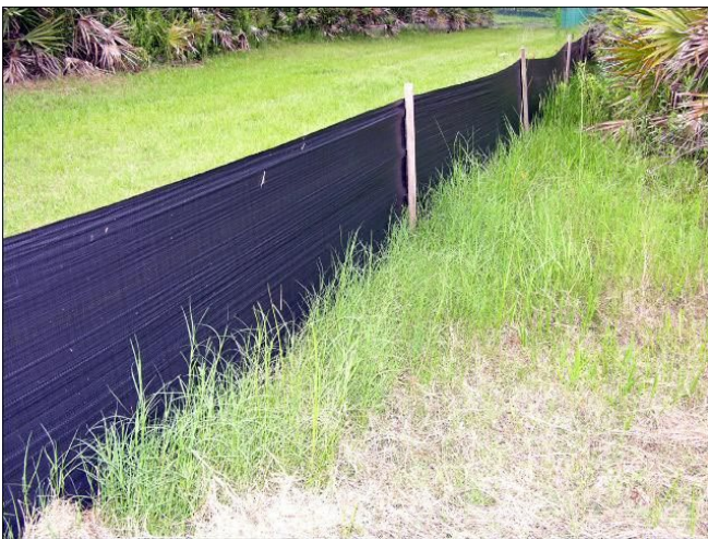
Figure 7. Snake fences, such as this one made of silt fencing, can prevent some snakes from entering your yard when used correctly, but can be costly and time consuming to install and do not prevent all species of snakes from entering. Such measures should only be used as a last resort.

If you frequently encounter venomous snakes and find that the measures described above do not deter them, you may consider using fencing in some areas (e.g., along edges of wooded areas or margins of lakes and wetlands) to prevent snakes from entering your yard. Fencing of aluminum flashing, hardware cloth (1/4"), or silt fencing 2–3 feet high buried 6 inches in the ground should deter most snakes from gaining access to certain areas of your yard (Figure 7).