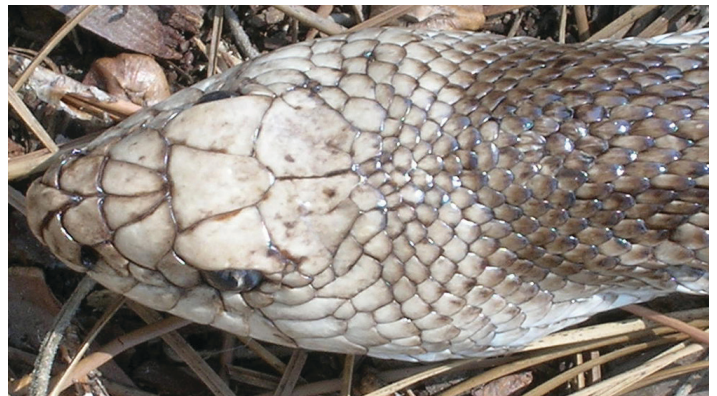
Figure 5b. Pinesnakes have a spade-shaped head that helps them burrow into the soil.