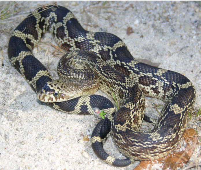
Figure 2. The markings of young Florida pinesnakes are much more distinct than those of adults.