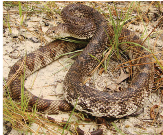
Figure 1. The markings of adult Florida pinesnakes are indistinct toward the head, but become more obvious toward the tail. Coloration of Florida pinesnakes varies regionally—some individuals may be much paler or darker than the adult shown here.

gets its name from its long tail that looks braided, like a whip. The Florida kingsnake (Figure 4) has faint banded markings that do not become more distinct toward the tail. Both the eastern coachwhip and the Florida kingsnake have smooth scales, whereas the scales of pinesnakes have a longitudinal ridge or keel that makes them appear rough. If captured, pinesnakes can easily be identified by the large, elongated rostral scale on the nose (Figure 5), and the large, spade-shaped head—important traits that aid them in digging. The rostral scale of eastern coachwhips and Florida kingsnakes is much smaller and does not extend onto the top of the head.