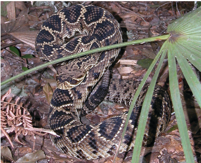
Figure 6. The eastern diamond-backed rattlesnake ( Crotalus adamanteus ) is also similar in appearance to the Florida pinesnake, but is a much heavier-bodied snake with obvious dark diamond marks bordered in white down the back, a dark facial band, and a large rattle.