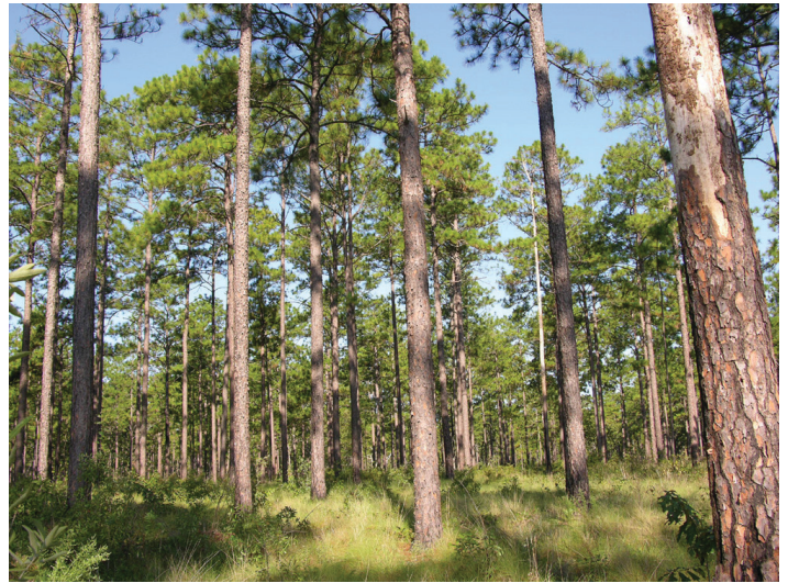
Figure 8. Upland longleaf pine-wiregrass ( Pinus palustris - Aristida beyrichiana ) habitat is excellent habitat for Florida pinesnakes. This habitat requires prescribed burning to maintain the appropriate conditions for Florida pinesnakes and many other species.

Credits: Adapted from Gibbons and Dorcas (2005) by Gabriel Miller, University of Florida, 2008