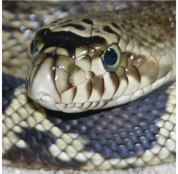
Figure 5a. Pinesnakes can be easily identified by the large rostral scale on the nose.