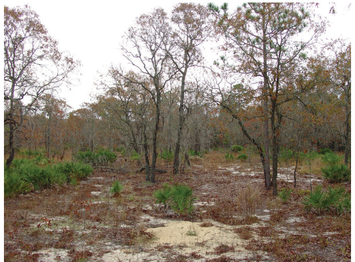
Figure 9. Upland turkey oak ( Quercus laevis ) barren sandhill habitat is also excellent habitat for Florida pinesnakes. When prescribed fire is used to manage oak-dominated sandhills they eventually revert back to pine-dominated systems and remain very suitable for Florida pinesnakes.