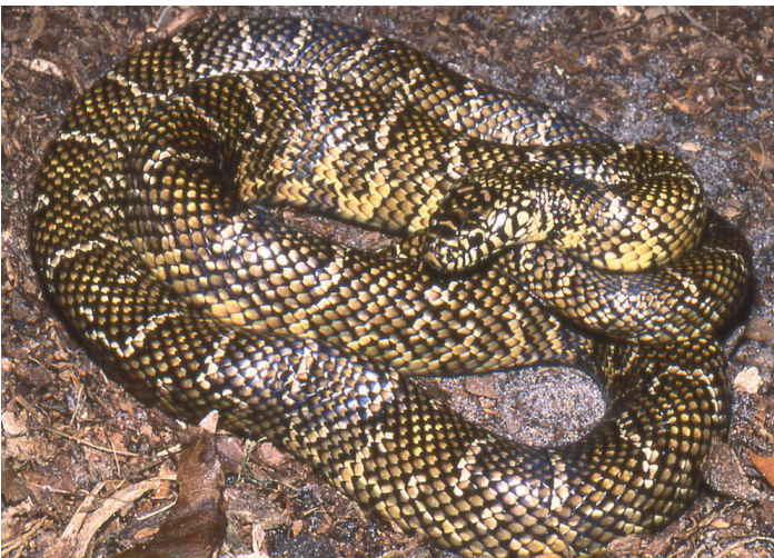
Figure 4. The Florida kingsnake ( Lampropeltis getula floridana ) is similar in appearance to the Florida pinesnake, but has a faint, banded pattern and lacks obvious blotches or an enlarged rostral scale.