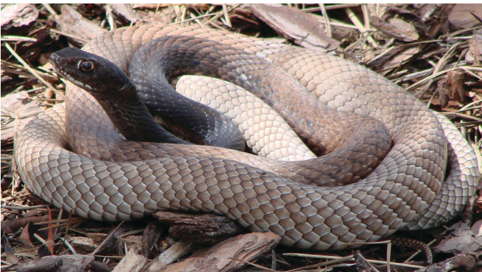
Figure 3. The eastern coachwhip ( Coluber flagellum flagellum ) is similar in appearance to the Florida pinesnake, but has a dark brown-black head and lacks obvious blotches.