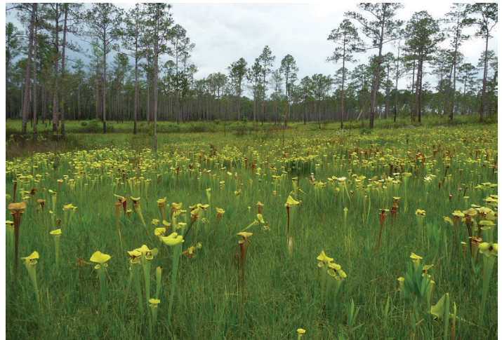
Figure 1. Flowering yellow trumpet pitcherplants in a seepage slope located in Blackwater River State Forest in the western Florida Panhandle.

Seepage slopes and similar communities may also be referred to as pitcherplant bogs, hanging bogs (Folkerts 1982), seepage bogs (Clewell 1986), or herb bogs (FNAI 1990).