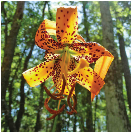
Figure 4. The state-listed, endangered Panhandle lily in Blackwater River State Forest.