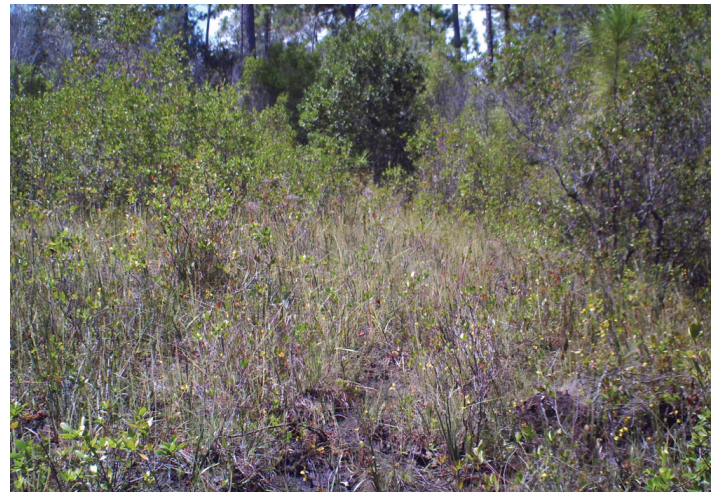
Figure 5. This seepage slope has become overgrown with woody species in the absence of frequent fire.

Woody species invade seepage slopes, outcompeting herbaceous species in the absence of fire or with alteration of the natural fire regime (Johnson 2001) (Figure 5). Frequent low-intensity fire is the most important process maintaining the open canopy and herbaceous composition of these communities. Historically, fires burned through the surrounding uplands about every one to three years (Frost 2006). It is thought that lightning ignited these fires during the spring or the beginning of the growing season (Olson 1992). These lightning-producing thunderstorms coincided with spring drought so that upland fires spread down into dry seepage slopes (Olson and Platt 1995). Encroachment of woody species as a result of fire suppression shades out the sun-loving herbaceous species.