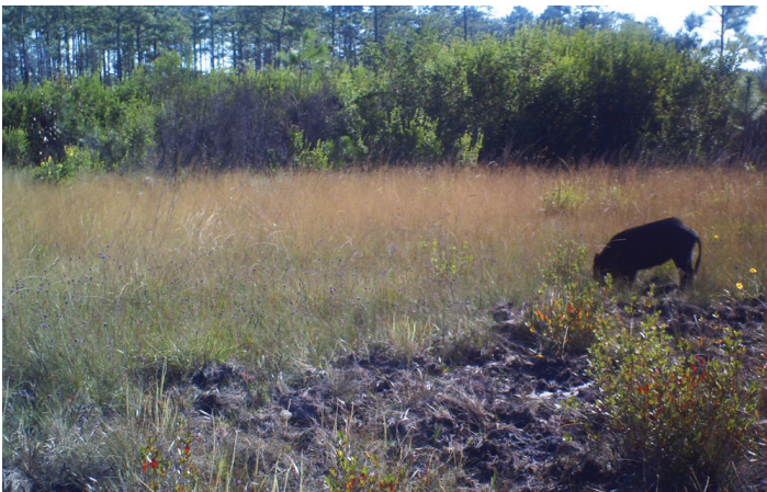
Figure 6. Feral hog rooting in a seepage slope on Eglin Air Force Base.

The savannas and associated ecosystems of the southeastern United States did not evolve with foraging pressure from wild hogs. De Soto introduced domestic hogs during his travels through Florida and eight other states (Mayer and Brisbin 1991). Feral hogs are now one of the most serious threats to seepage slope communities on Eglin Air Force Base. These nonindigenous animals are generalists whose diet consists primarily of fruits, nuts, grasses, forbs, roots, and earthworms. Hogs forage underground by rooting or using their snouts to overturn soil. This belowground foraging uproots vegetation (Engeman et al. 2007), creates hummocks and tussocks that disrupt soil structure (Jensen 1985) and moisture (Arrington et al. 1999), increases areas of bare ground (Engeman et al. 2007), and facilitates soil erosion (Tep and Gaines 2003) (Figure 6). Disturbance from hogs is not uniform across the seepage slope. Our unpublished research has found that hogs preferentially disturb areas in the lower, wetter portions of the seepage slopes, especially areas that have been previously disturbed. This suggests that the erosion, plant mortality, and excrement deposition associated with hog disturbance is not uniform across the landscape. This has implications for the persistence of rare plants (pitcherplants) and amphibians that inhabit the wetter portions of the slope.