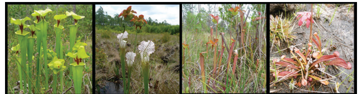
Figure 3. Pitcherplant species from left to right, yellow trumpet, white-top pitcherplant, sweet pitcherplant, and parrot pitcherplant.

There are many rare or endemic species (species that occur nowhere else) that can be found in seepage slopes in the Florida Panhandle. The most notable are the carnivorous plants of the pitcherplant family, Sarraceniaceae (Figure 3). Members of this family include the yellow trumpet ( Sarracenia flava ), white-top pitcherplant ( S. leucophylla ) (endangered in Florida), hooded pitcherplant ( S. minor ) (threatened in Florida), sweet pitcherplant ( S. rubra ) (threatened in Florida), purple pitcherplant ( Sarracenia purpurea ) (threatened in Florida), and parrot pitcherplant ( S. psittacina ) (threatened in Florida). Other carnivorous flora, including the dewthread ( Drosera tracyi ), threadleaf sundew ( D. filiformis ) (endangered in Florida), pink sundew ( D. capillaris ), dwarf sundew ( D. brevifolia ), bladderworts ( Utricularia spp.), and butterworts ( Pinguicula spp.), also inhabit seepage slopes (FNAI 2010).