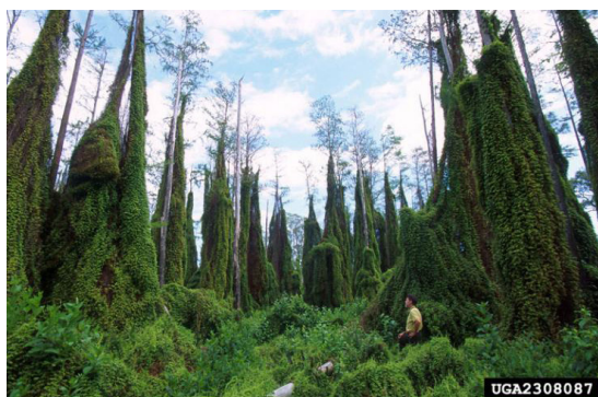
Figure 6. Old World climbing fern ( Lygodium microphyllum ).

This invasive vine smothers trees and plants in swamps and other wet areas. It forms thick mats of dead plant material that increase fire risk. Lygodium is widespread in south and central Florida and cannot be eradicated. Management aims to suppress its growth through biocontrols and herbicides.