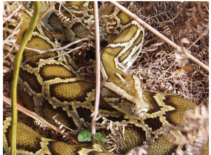
Figure 7. Burmese python ( Python molurus bivittatus ).

Burmese pythons eat a variety of prey, including endangered species, and may be responsible for a severe decline of mammals in the Everglades. Despite considerable research and development of control methods, no effective management option currently exists to remove pythons year-round across the landscape.