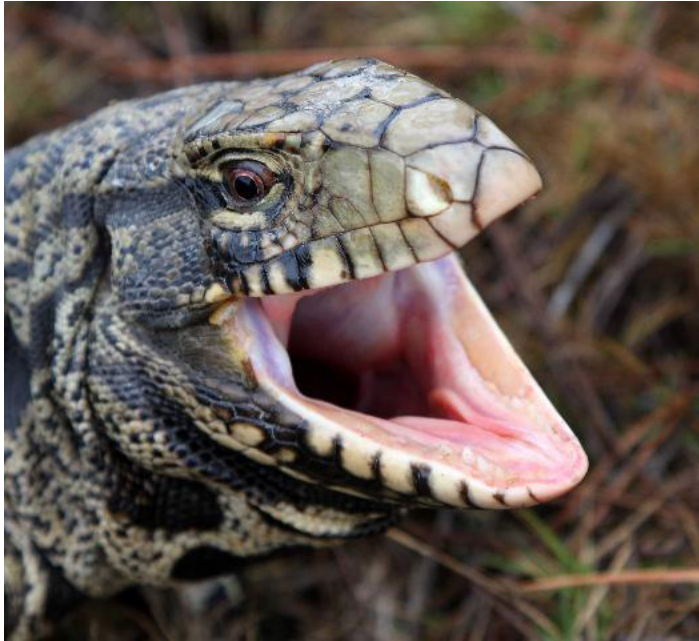
Figure 5. Argentine black and white tegu ( Tupinambis merianae ).

Tegus have established populations in south Florida and are expanding to new areas. To stop the spread, managers are removing tegus, monitoring the populations, and educating the public about reporting tegus. These large lizards were introduced through the pet trade and are a threat to native wildlife.