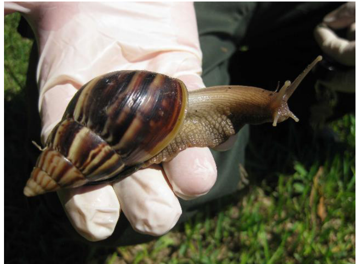
Figure 4. Giant African land snail ( Lissachatina fulica ).

The GALS is a voracious plant eater that threatens Florida agriculture. An emergency eradication program was initiated immediately after these snails were detected.