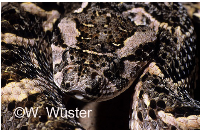
Figure 2. Puff adder ( Bitis arietans ).

This venomous snake was identified as a potential invader because it is frequently imported and difficult to manage as a pet. If it establishes in Florida, this species poses danger to humans and the ecosystem. In Africa, puff adders are responsible for more snakebite deaths than any other species.