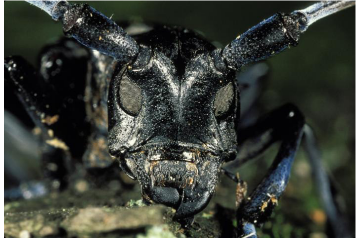
Figure 3. Asian longhorned beetle ( Anoplophora glabripennis ).

The United States Department of Agriculture and Customs and Border Protection inspect imported agricultural products for insect “hitchhikers.” The ALB is currently destroying forests in the northeastern United States. Preventing this high-risk species from entering Florida will save millions of dollars in management costs.