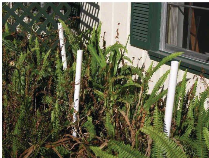
Figure 5. You can erect PVC pipes in your yard to capture Cuban treefrogs.

Video 1. “How to: Build a Tree Frog House” https://youtu.be/N_4gI46hpF0