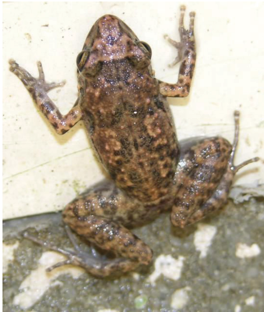
Figure 1. Florida's greenhouse frog.