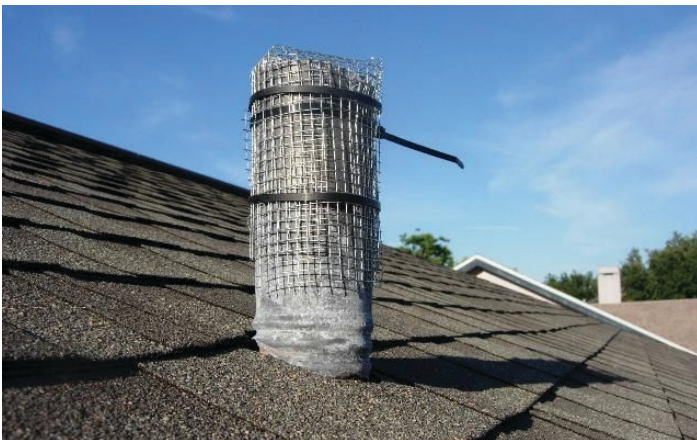
Figure 7. Cover roof vent pipes with hardware cloth to prevent entry into buildings by Cuban treefrogs.