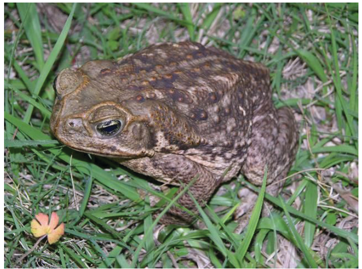
Figure 3. Florida's cane toad (aka "Bufo toad").