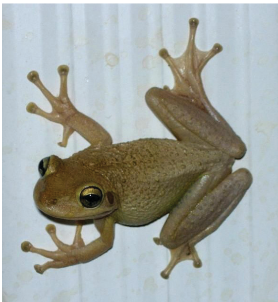
Figure 2. Florida's Cuban treefrog.