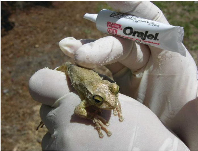
Figure 6. Cane toads and Cuban treefrogs can be euthanized humanely after capture by applying a benzocaine- or lidocaine-based ointment or spray to the frog's back or belly, securing the frog in a plastic bag, and placing the bag in a freezer overnight.